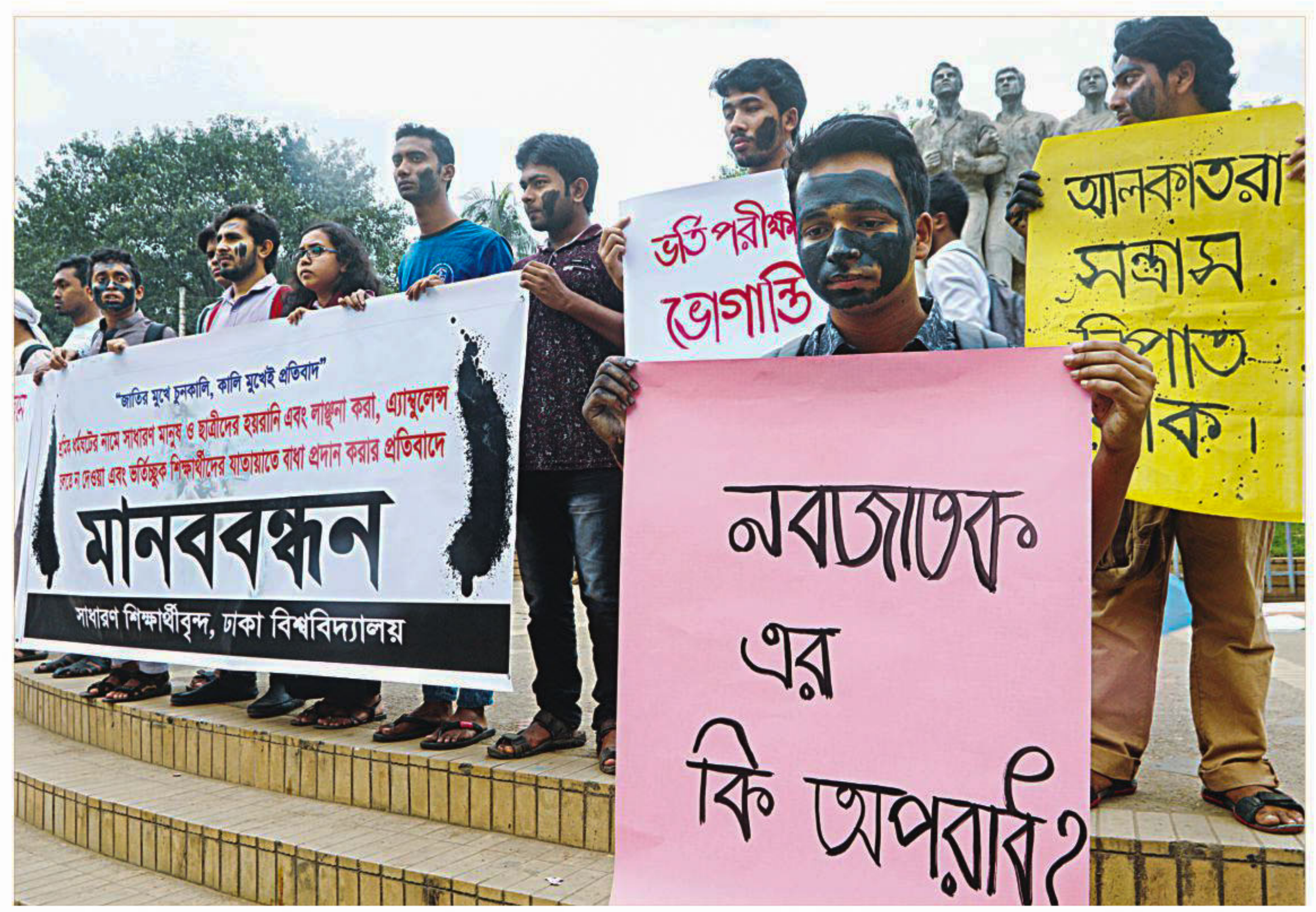
With ink on their faces, a group of Dhaka University students forms a human chain near TSC on the campus yesterday. They were protesting the death of a seven-day-old baby in an ambulance held by striking transport workers in Moulvibazar on Sunday and harassment of people, including smearing of their faces and clothes with burnt engine oil, by pickets.