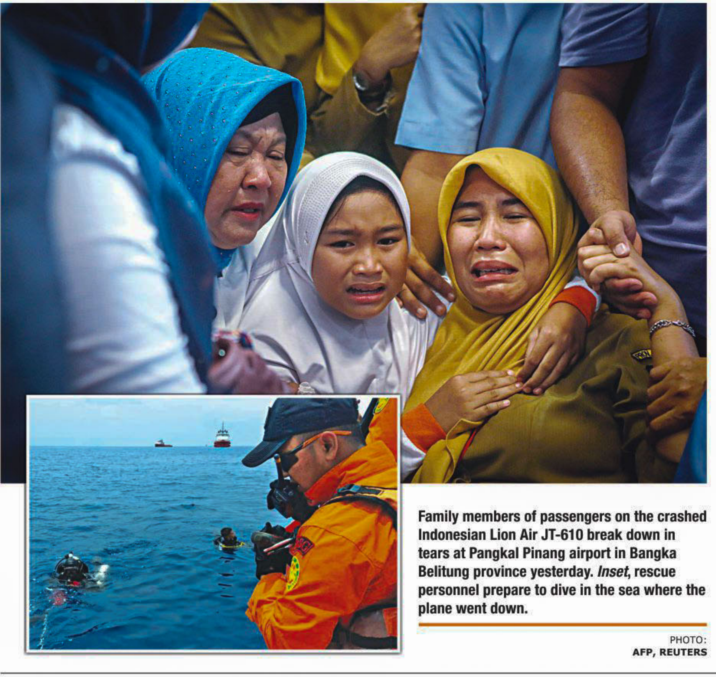
Family members of passengers on the crashed Indonesian Lion Air JT-610 break down in tears at Pangkal Pinang airport in Bangka Belitung province yesterday. Inset, rescue personnel prepare to dive in the sea where the plane went down.