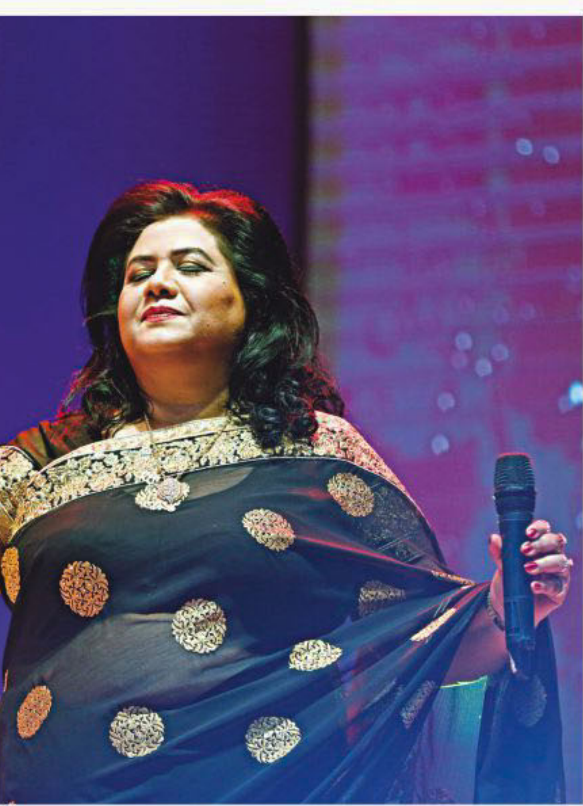
The legendary Runa Laila performing at the event.