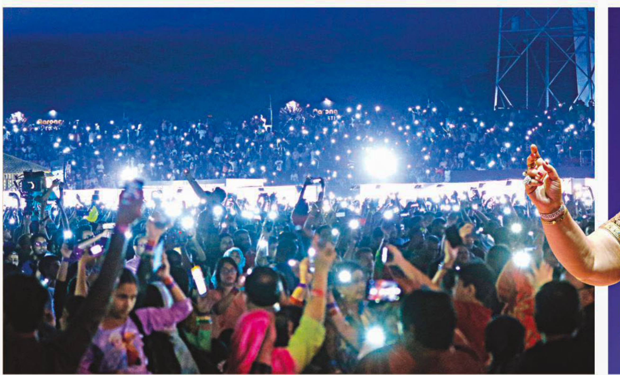
A breathtaking tribute to the great Ayub Bachchu.