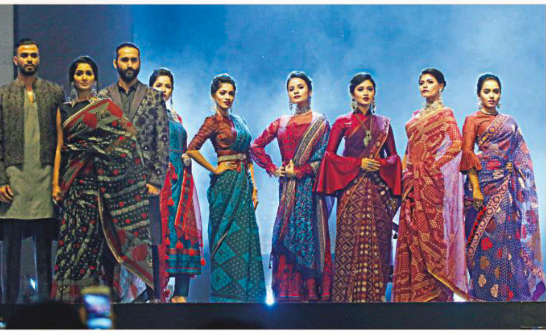
Fashion shows increased the grandeur of the event.