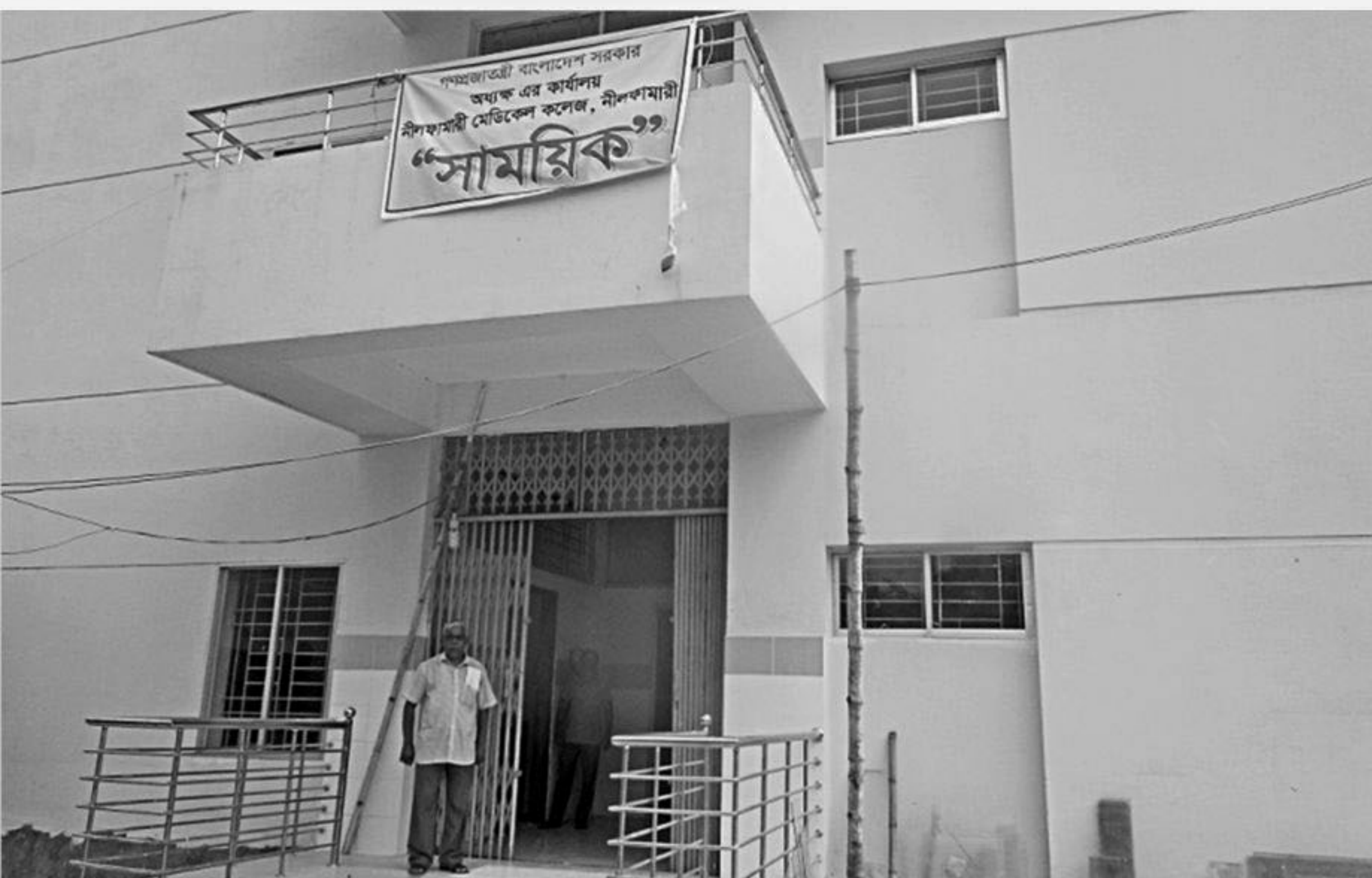
Nilphamari Medical College has started functioning in a section of the ground floor of the 250-bed Sadar Hospital in the town.

He said police sent the body to Rangamati Sadar Hospital for autopsy.