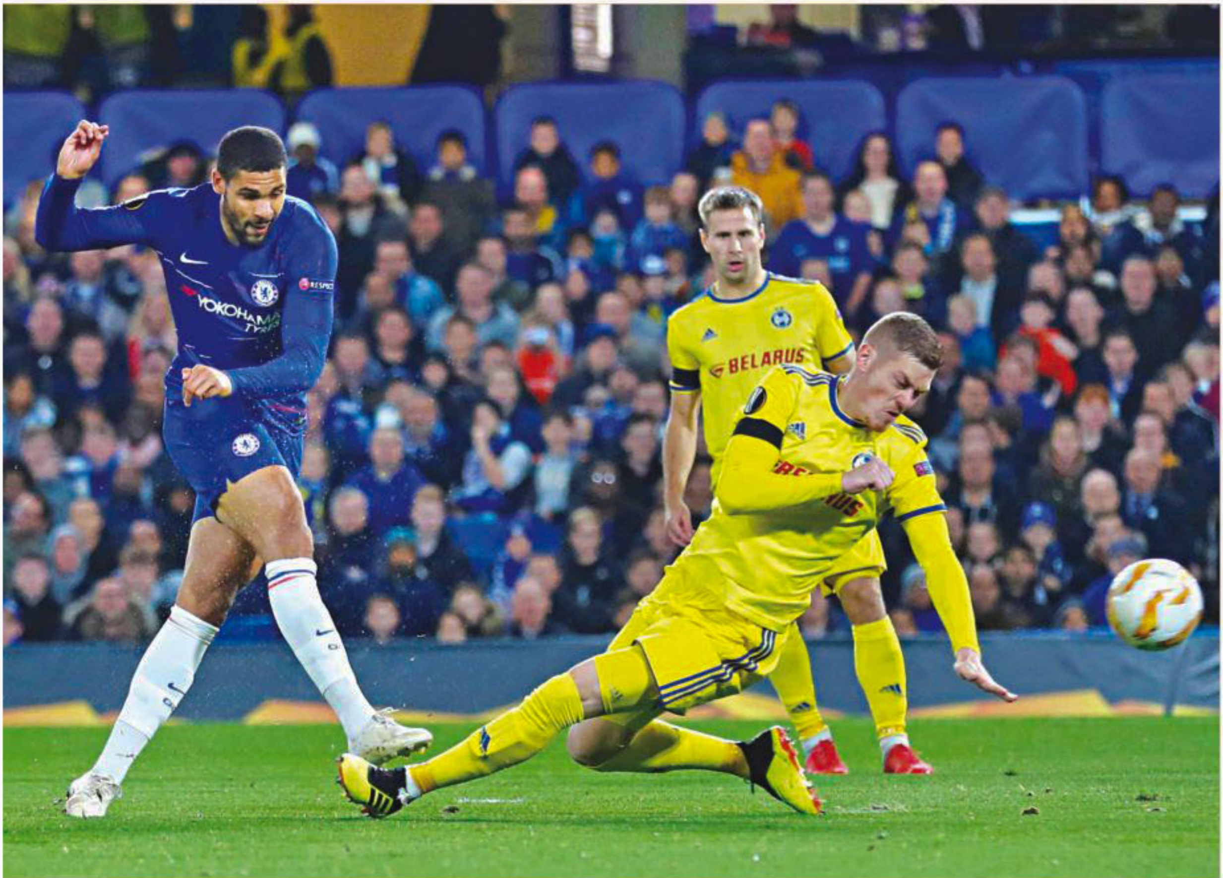
Chelsea midfielder Ruben Loftus-Cheek (L) scores the opening goal against BATE Borisov during their Europa League encounter at Stamford Bridge on Thursday.