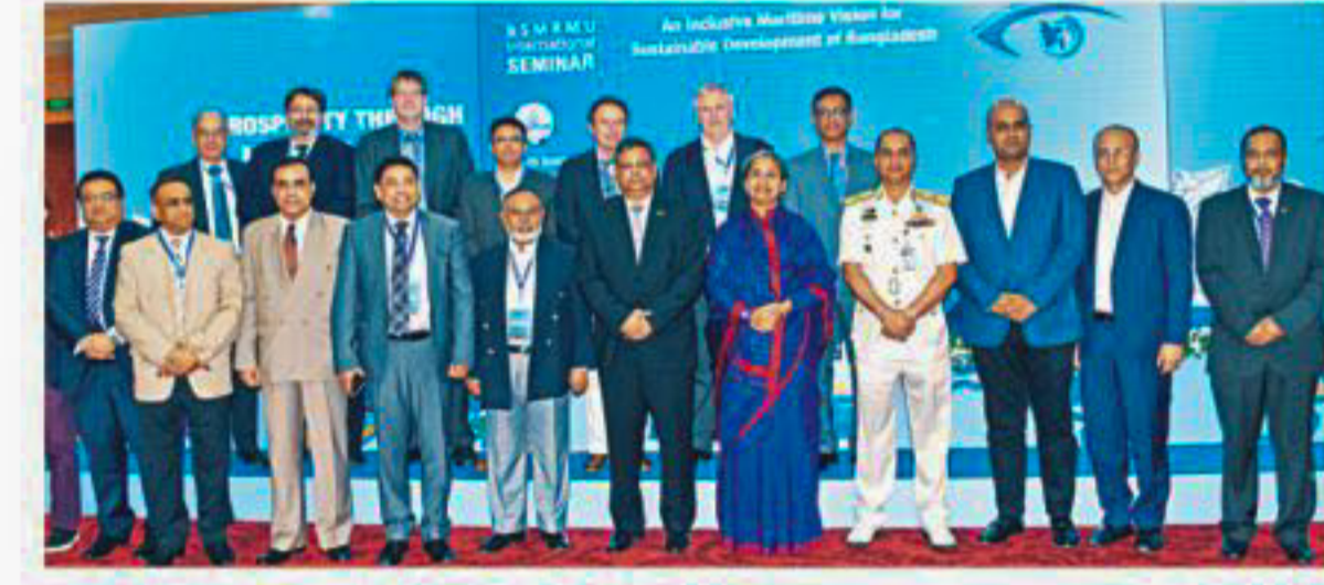
Speakers at a recently concluded international seminar, "An Inclusive Maritime Vision for Sustainable Development of Bangladesh", organised by Bangabandhu Sheikh Mujibur Rahman Maritime University, Bangladesh in the capital.