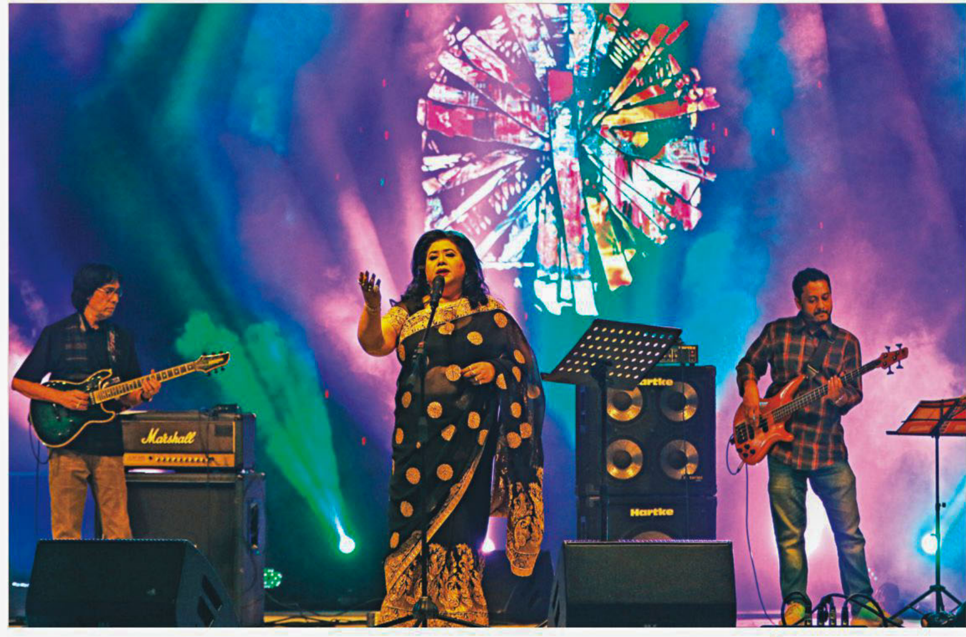
Renowned singer Runa Laila performs at the 40th anniversary celebrations of Aarong, a lifestyle retail chain under Brac, at Army Stadium in Dhaka last evening.