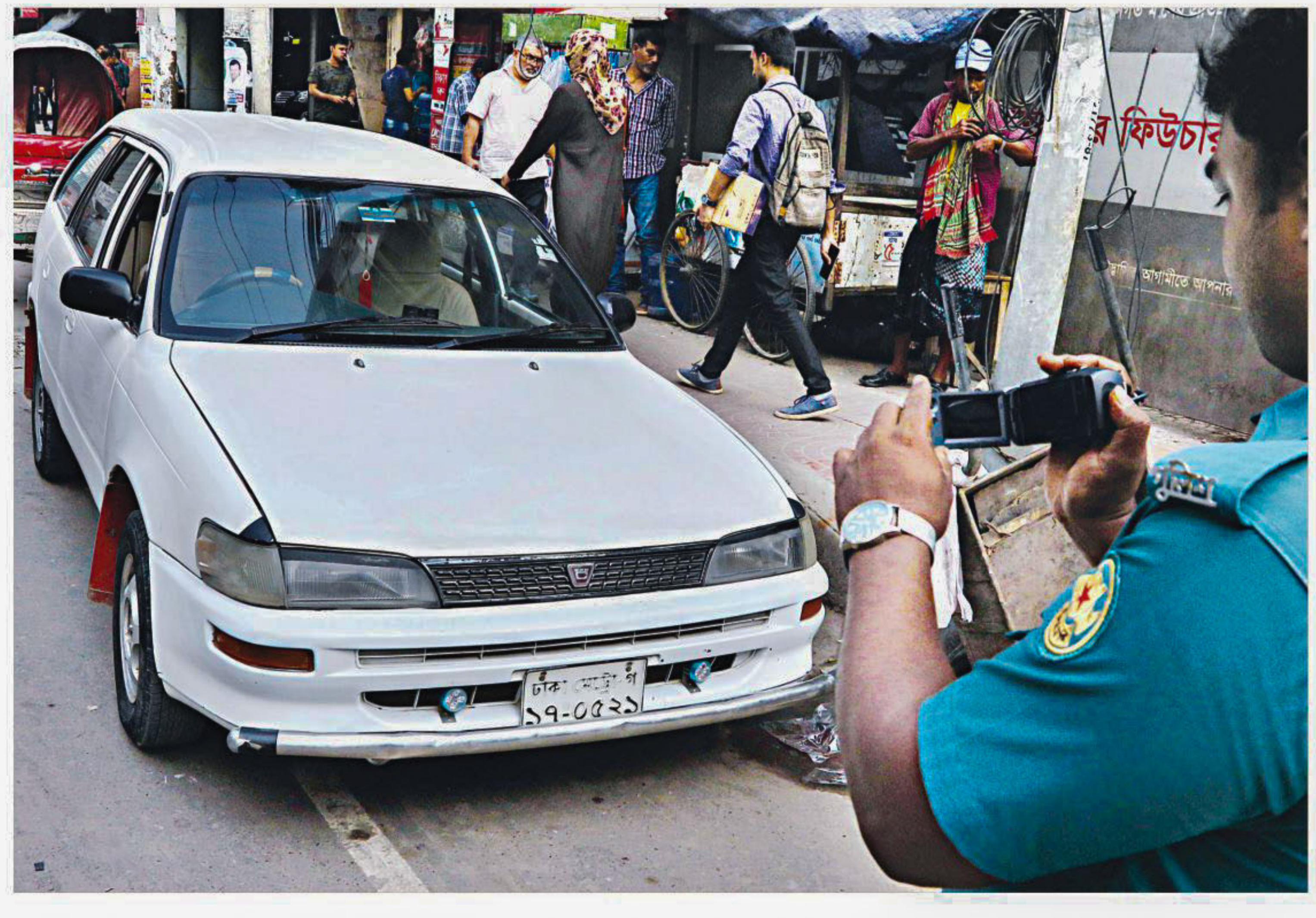
A police official taking video footage of an illegally parked car, including its number plate, in the capital's Malibagh area yesterday. He said the DMP's traffic department will fine the car owner after getting details of the vehicle with the BRTA's help. The move is more efficient as sometimes the drivers are not found near their vehicles and on-the-spot fine causes hassles for others.