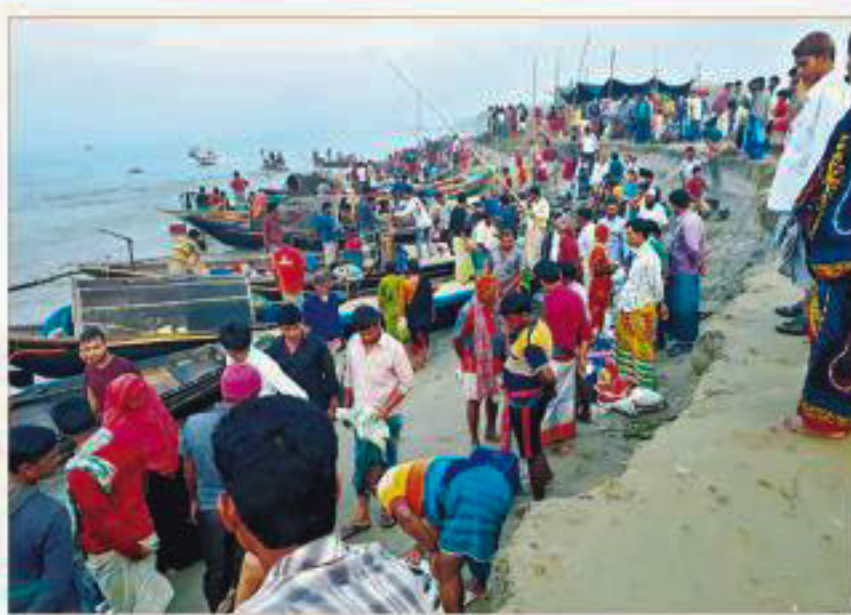
Defying a ban, hilsa being sold in broad daylight on the bank of the Padma at Char Jhautia village of Munshiganj's Louhajang upazila on Monday.