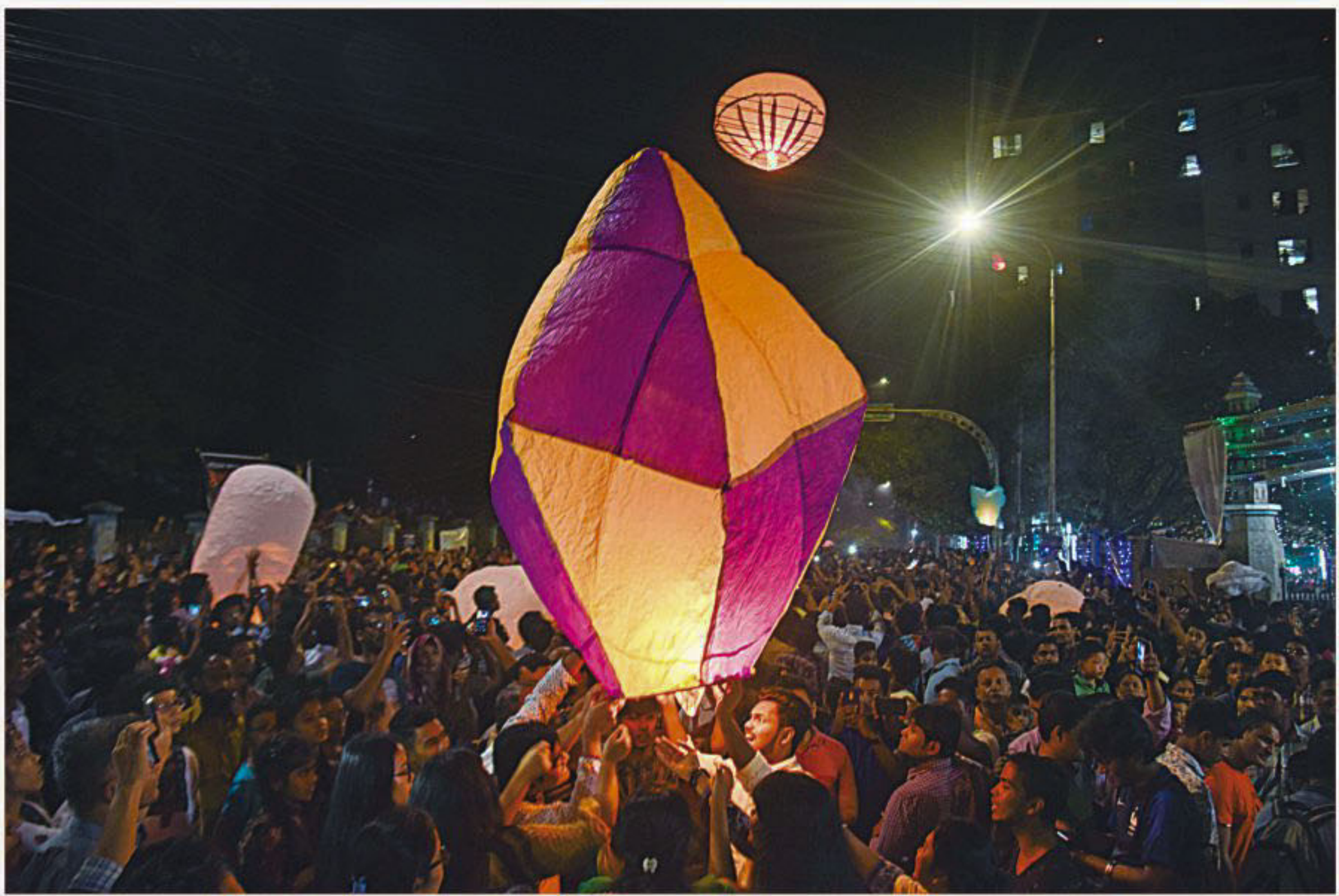
Sky lanterns being flown by Buddhists as they celebrate Prabarana Purnima in front of Nanda Kanan temple in Chattogram city last night.

AFP, Riyadh Saudi Arabia's crown prince yesterday denounced the "painful" murder of journalist Jamal Khashoggi and vowed justice would prevail, in his first public comments on the case, without addressing US accusations of a monumental cover-up. After phoning Turkish President Recep Tayyip Erdogan to discuss the October 2 killing in the Saudi consulate in Istanbul, which triggered a diplomatic crisis, Crown Prince Mohammed bin Salman also pledged there would be "no rupture" in ties with Ankara. "The incident was very painful for all Saudis, it's a repulsive incident and no one can justify it," Prince Mohammed said during an address to the Future Investment Initiative forum in Riyadh. "Those responsible will be held accountable... in the end justice will prevail," the heir apparent to the Saudi throne said in Arabic. The prince, faced with mounting international censure, appeared relaxed and occasionally joked as he shared the stage with Lebanon's prime minister-designate Saad Hariri and Bahrain's Crown Prince Salman bin Hamad. Three weeks since Khashoggi, a Saudi citizen living in self-imposed exile, disappeared after walking into the consulate to obtain marriage documents, the crisis shows no sign of abating. Washington, a long-time ally of Riyadh, moved late Tuesday to revoke the visas of several Saudis. Britain followed suit yesterday. Saudi leaders have denied involvement in Khashoggi's murder, pushing responsibility SEE PAGE 11 COL 1