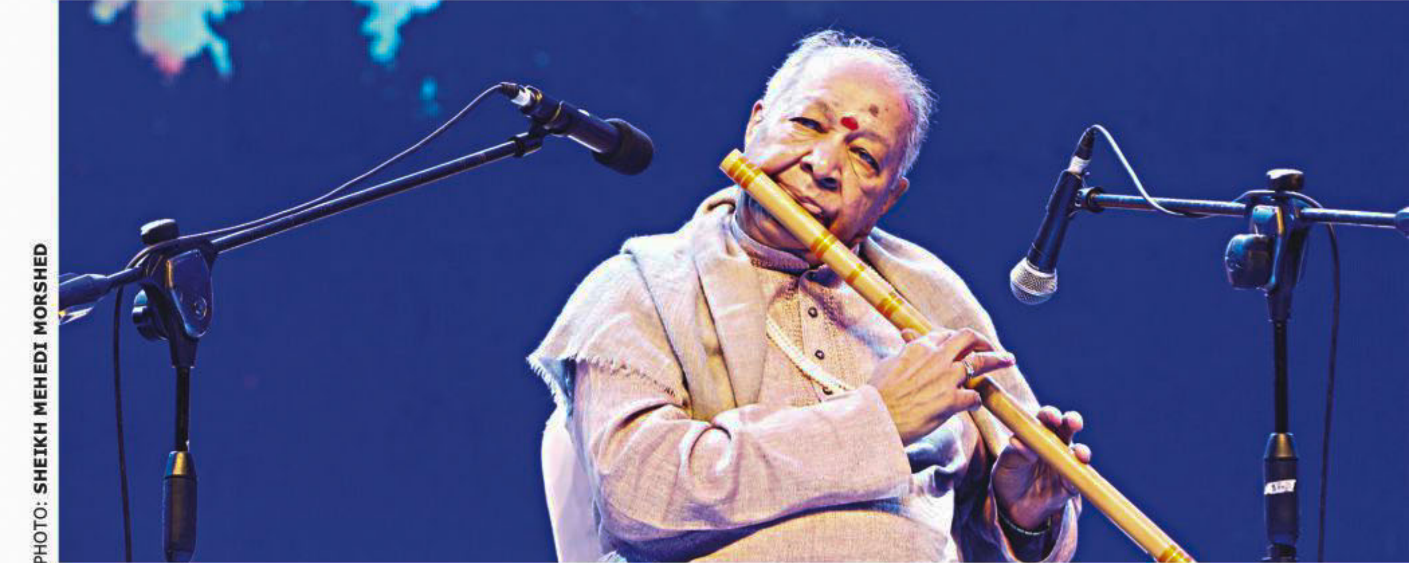
Pandit Hariprasad Chaurasia mesmerising the audience in last year's iteration of the Bengal Classical Music Festival.

singer. I would love to continue lending my voice for films. My last playback was in the film Jannat . Tell us about your latest track. Shomoyer Kache Minoti is a song that was written, composed, tuned and voiced by me. I am very hopeful about this new song, which may drop sometime in late November. You have been a part of this industry for 12 years. How do you feel about that? I feel blessed to have come this far since I started. The recognition and admiration that I receive from the audience is unparallel and priceless. I want to continue to do what I love and entertain my fans. You're also heavily involved in international shows. Where are you going next? I feel honoured to represent Bangladesh in the foreign lands. I'm in talks at the moment to sing in Australia and Malaysia in the near future. Since you're regularly writing books now, what can we expect from you at the next book fair? I am currently working on a novel that will be available at the book fair. Besides, I also enjoy writing poetry and my poems had been published earlier. My topics usually revolve around women's psychology, and it will be the same for my upcoming novel, which will be released under the banner of Tamralipi.