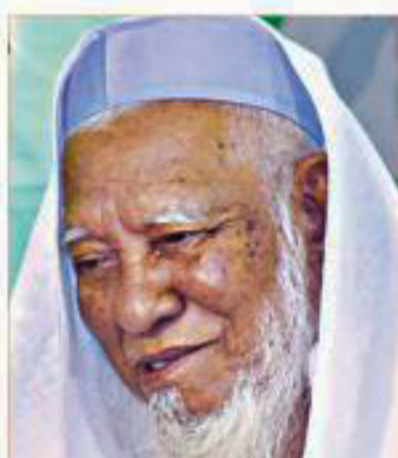
Shah Ahmad Shafi