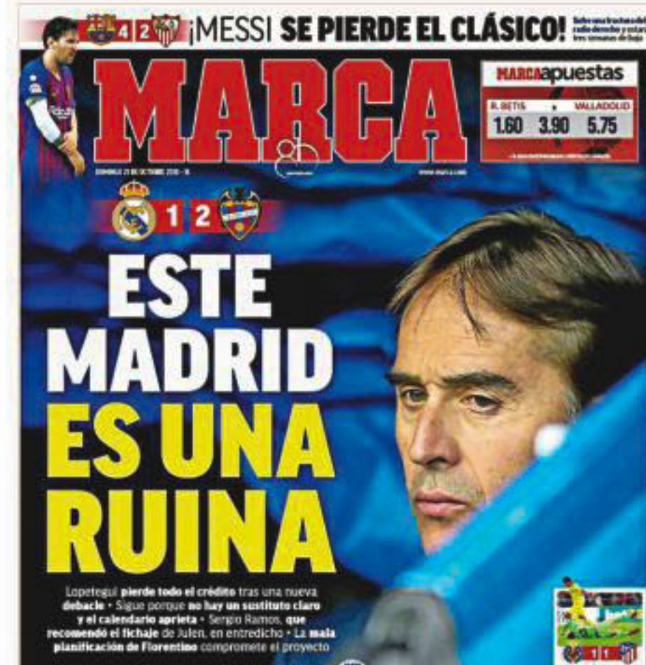
Marca's cover on Sunday read "This Madrid is in ruins".

However, Spain's Cadena SER reported after the match that Lopetegui reportedly had a short meeting with Perez which lasted around 15 minutes with no others present, where the pair reached an understanding that Lopetegui would remain coach at least