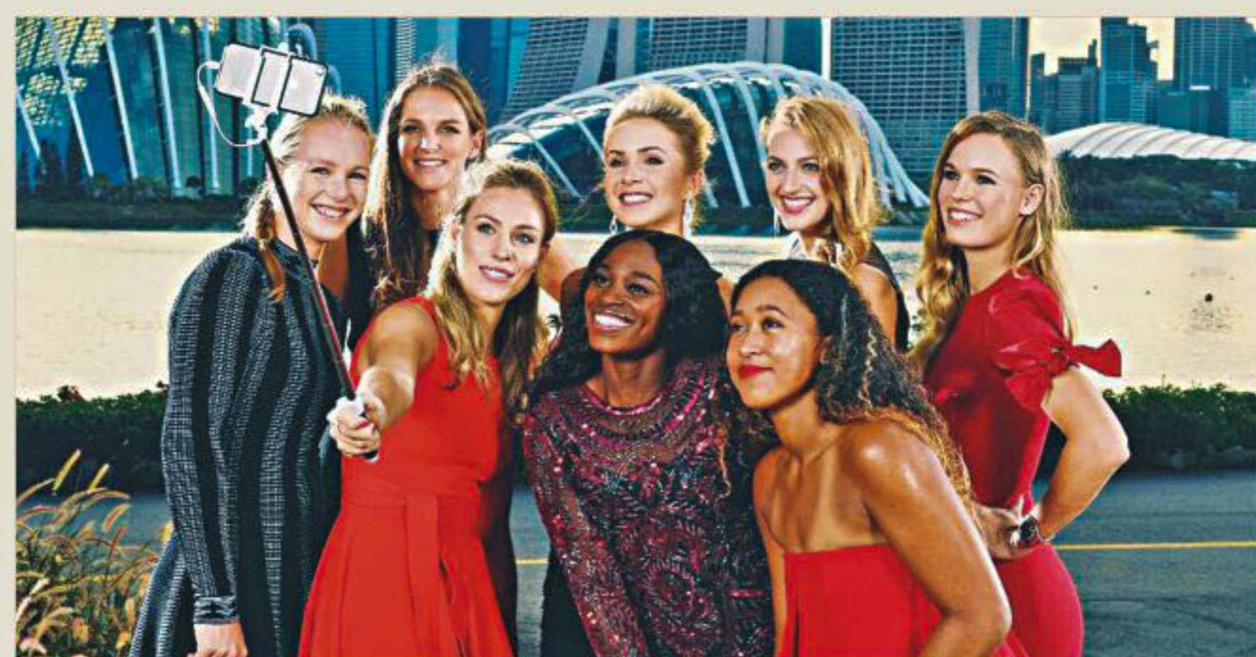
Led by top seed Angelique Kerber (3rd from L) and defending champion Caroline Wozniacki (R), the Elite Eight of women's tennis met in Singapore on Friday ahead of the WTA Finals and posed for the official photoshoot.