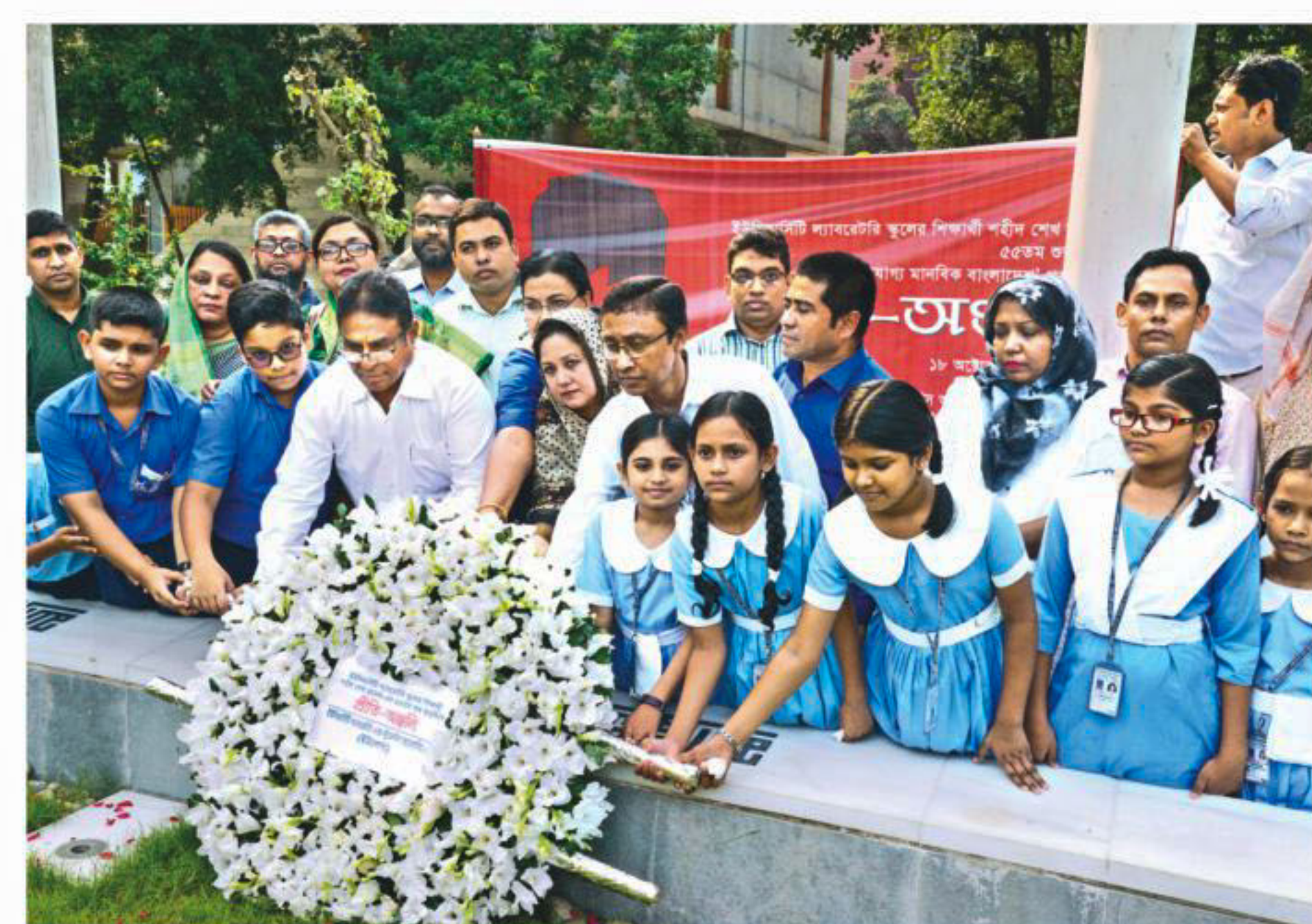
A wreath being placed at Sheikh Russel's grave yesterday.

Former and current students and teachers of University Laboratory School and College paid tribute to Sheikh Russel yesterday, marking his birth anniversary. University Laboratory Ex-Students' Association placed wreaths at the Banani grave of the youngest son of Bangabandhu Sheikh Mujibur Rahman and a student of the school. Russel, also the youngest brother of Prime Minister Sheikh Hasina, was born on this day in 1964 at the historic Bangabandhu Bhaban in the capital's Dhanmondi. Russel was a fourth-grader when he along with most of the family members of Bangabandhu was brutally killed on August 15, 1975.