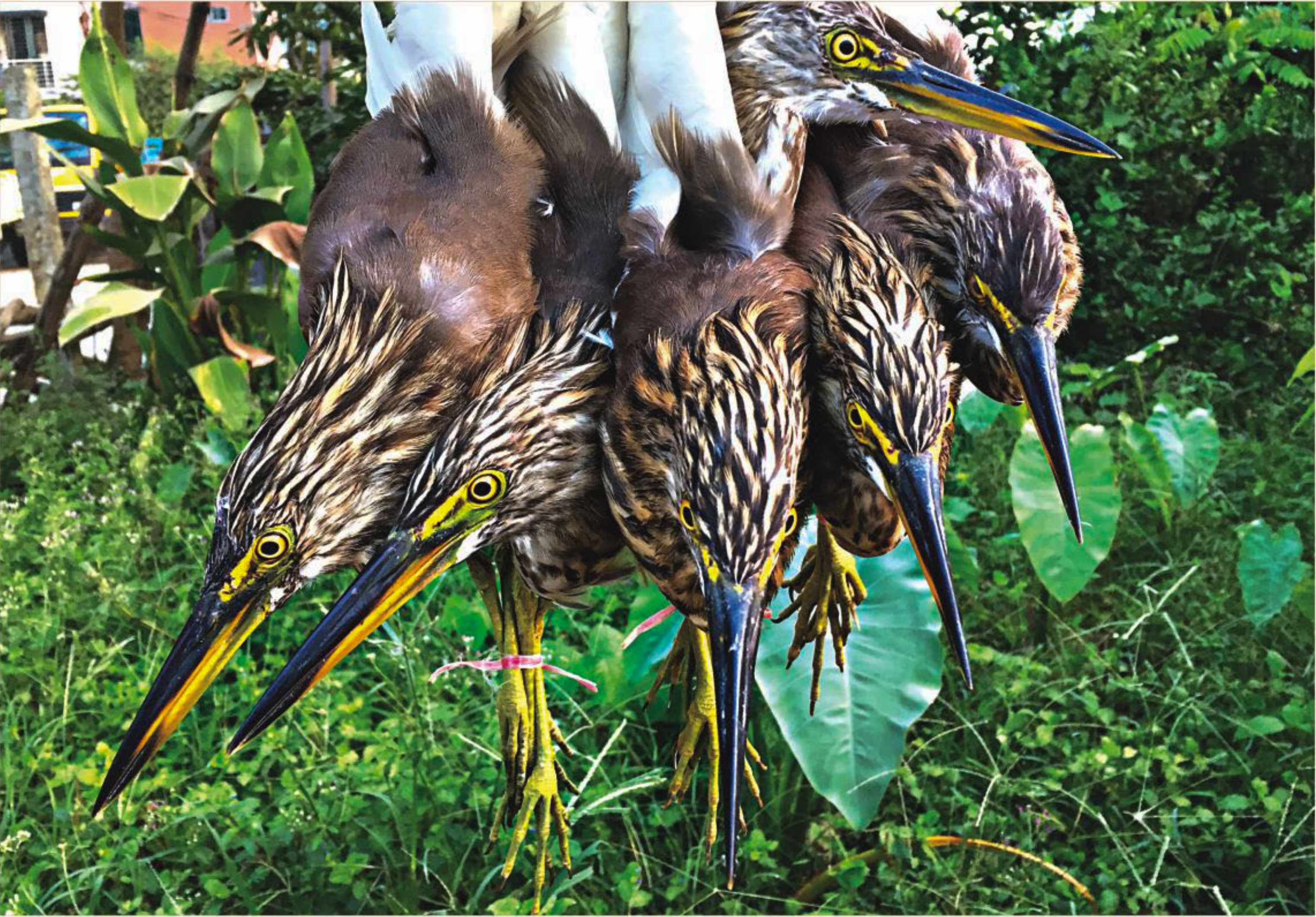
Pond herons being sold illegally on Wasa Road in the capital's Bashabo yesterday morning. The man selling the birds said he used bait to trap them in Mymensingh's Muktagachha and brought them to Dhaka for better price.