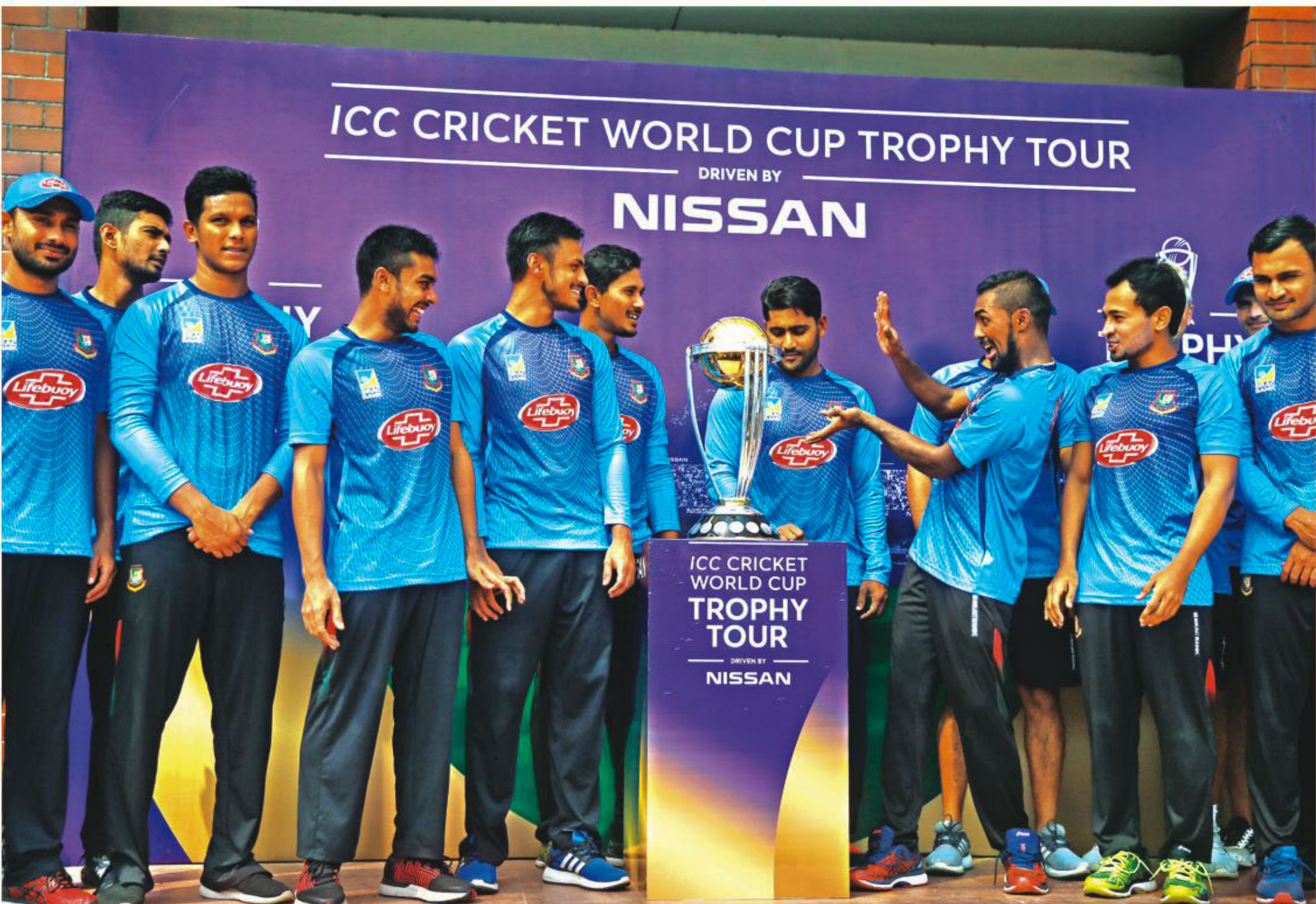
Bangladesh cricketers take a break from practice to pose with the coveted ICC World Cup trophy at the Sher-e-Bangla National Stadium in Mirpur yesterday. The cup will be on display at the Jamuna Future Park today for people to see and then taken to Chittagong and Sylhet as part of a four-day tour of the country.