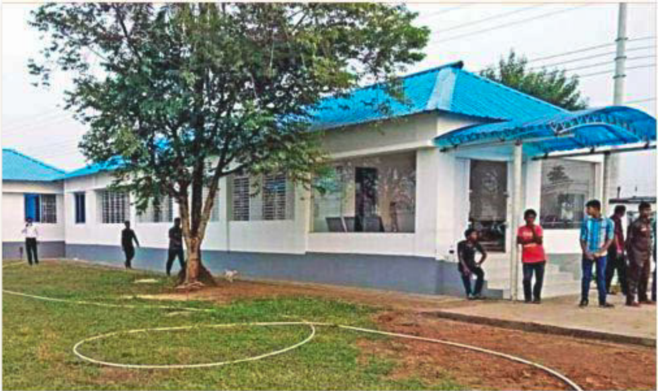
ARUN BIKASH DEY, Chattogram

Country's first pet hospital ready to open