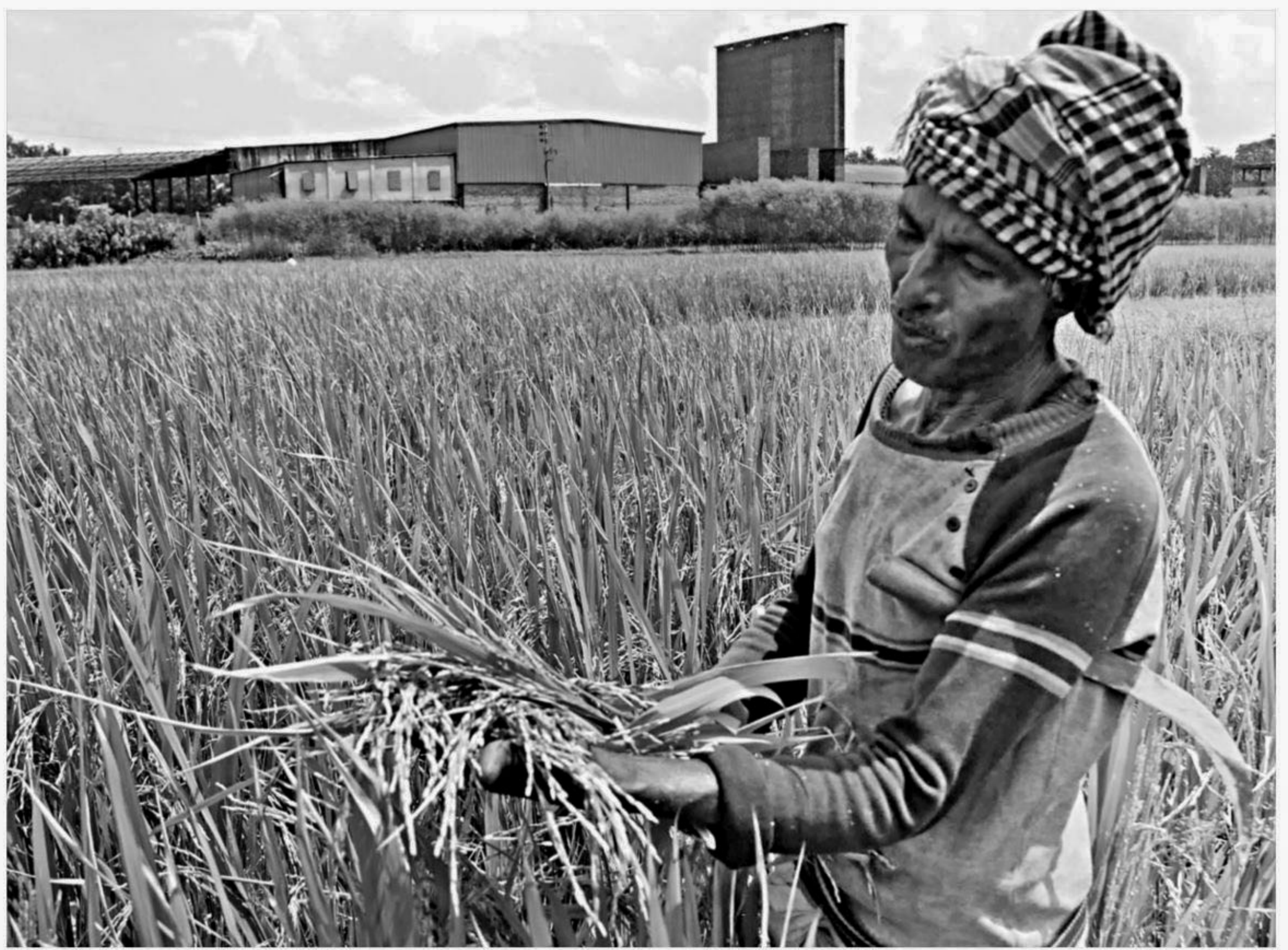
A farmer shows his paddy that has been badly damaged by toxic gas emitted from a brick kiln at Dhuldi Gopalpur village in Ambikapur union under Faridpur Sadar upazila.