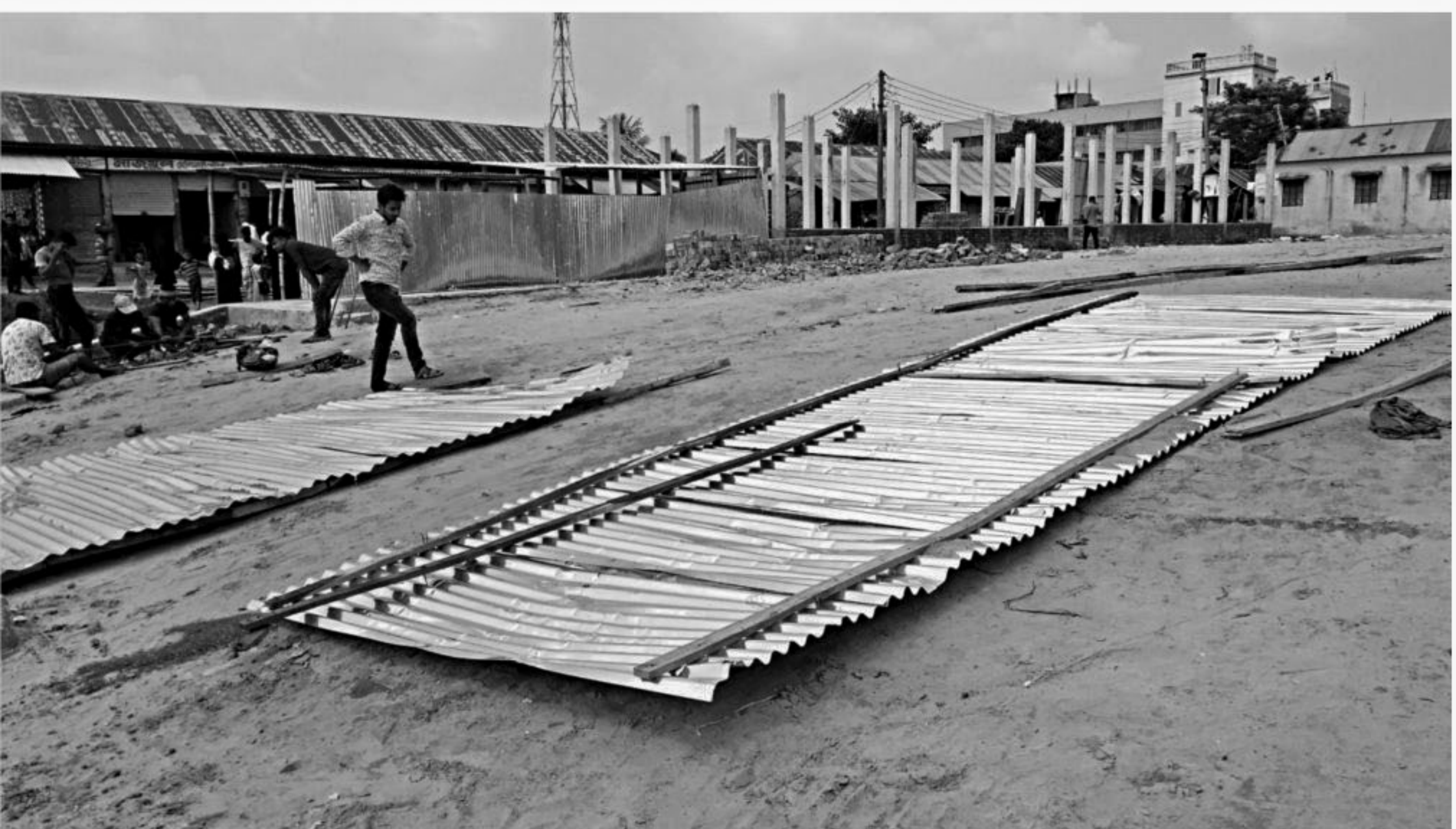
Land grabbers demolished newly built tin-shed shops at a government-approved market on the leased land at Gokarna Ghat in Brahmanbaria municipality on October 8 while the illegal structure earlier built by the perpetrators has remained intact.