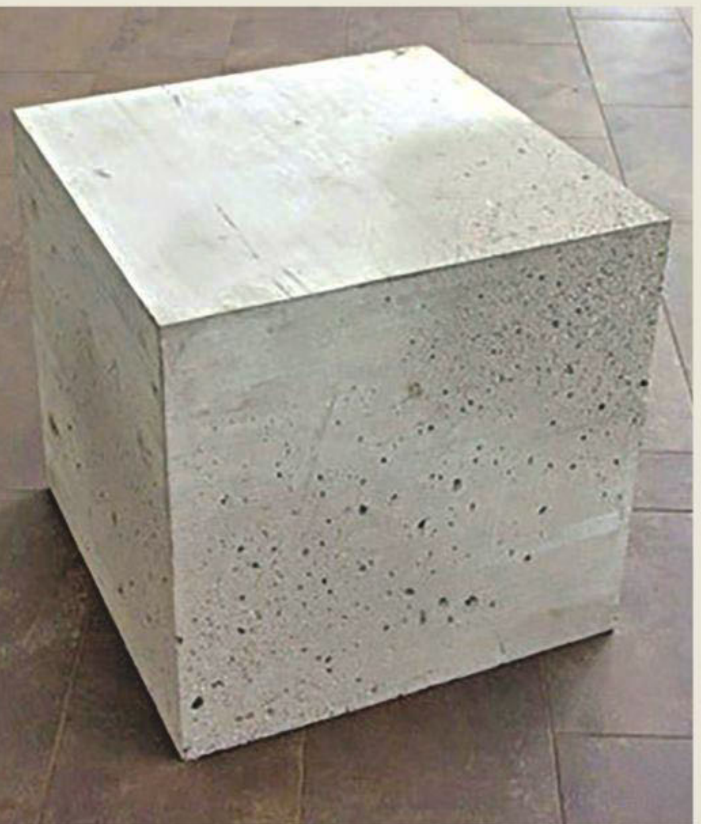
'The Debate On The Climate Change, 2018 Beton (60x60x60cm)'

The exhibition constitutes four sculptures which are, in an abstract way, borne out of a certain global political consciousness and the current issues facing the world today. Each of the four pieces highlights global inequality, refugee crises, wars and conflicts that peril peace in this day and age as well as the threatening issues of climate change.