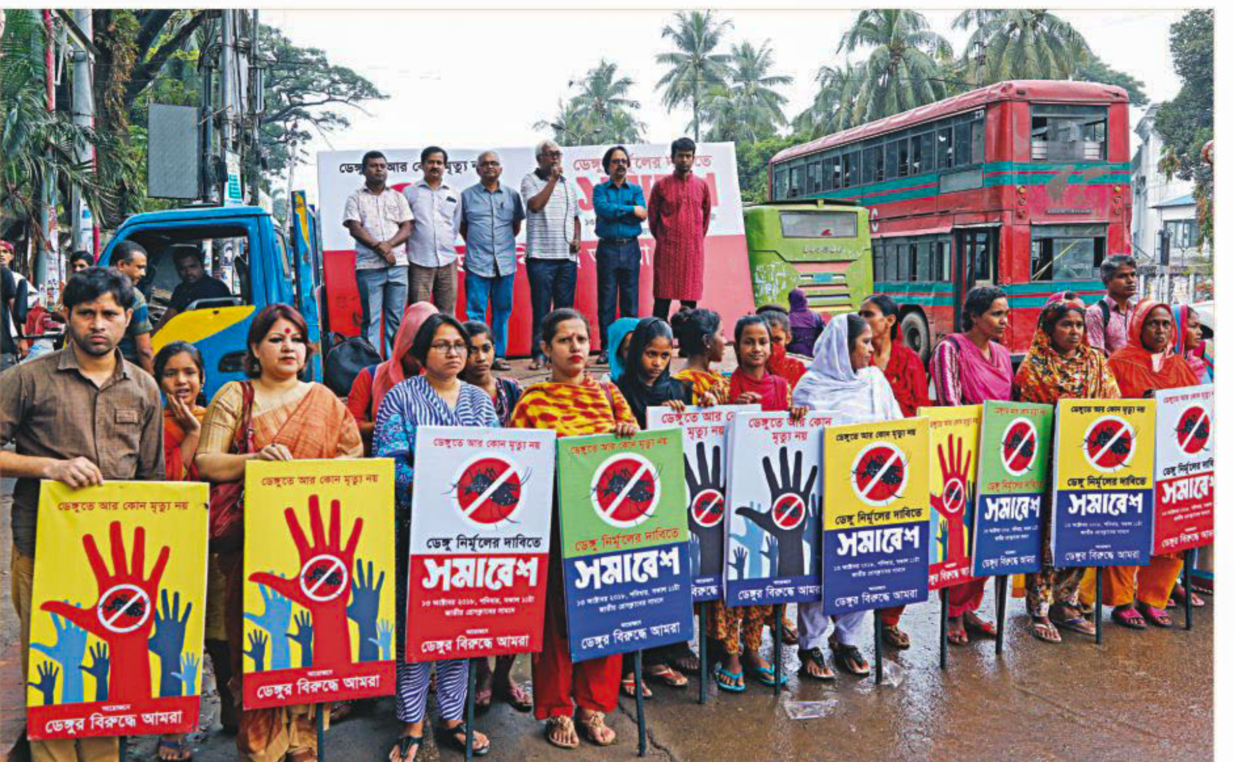
A group under the banner of "Dengue-r Birudhe Amra" (Fight against dengue) holds a rally in front of Jatiya Press Club yesterday, demanding proper measures to protect people against the mosquito-borne disease. Recently there has been an increase in the number of dengue-affected patients in Dhaka city.