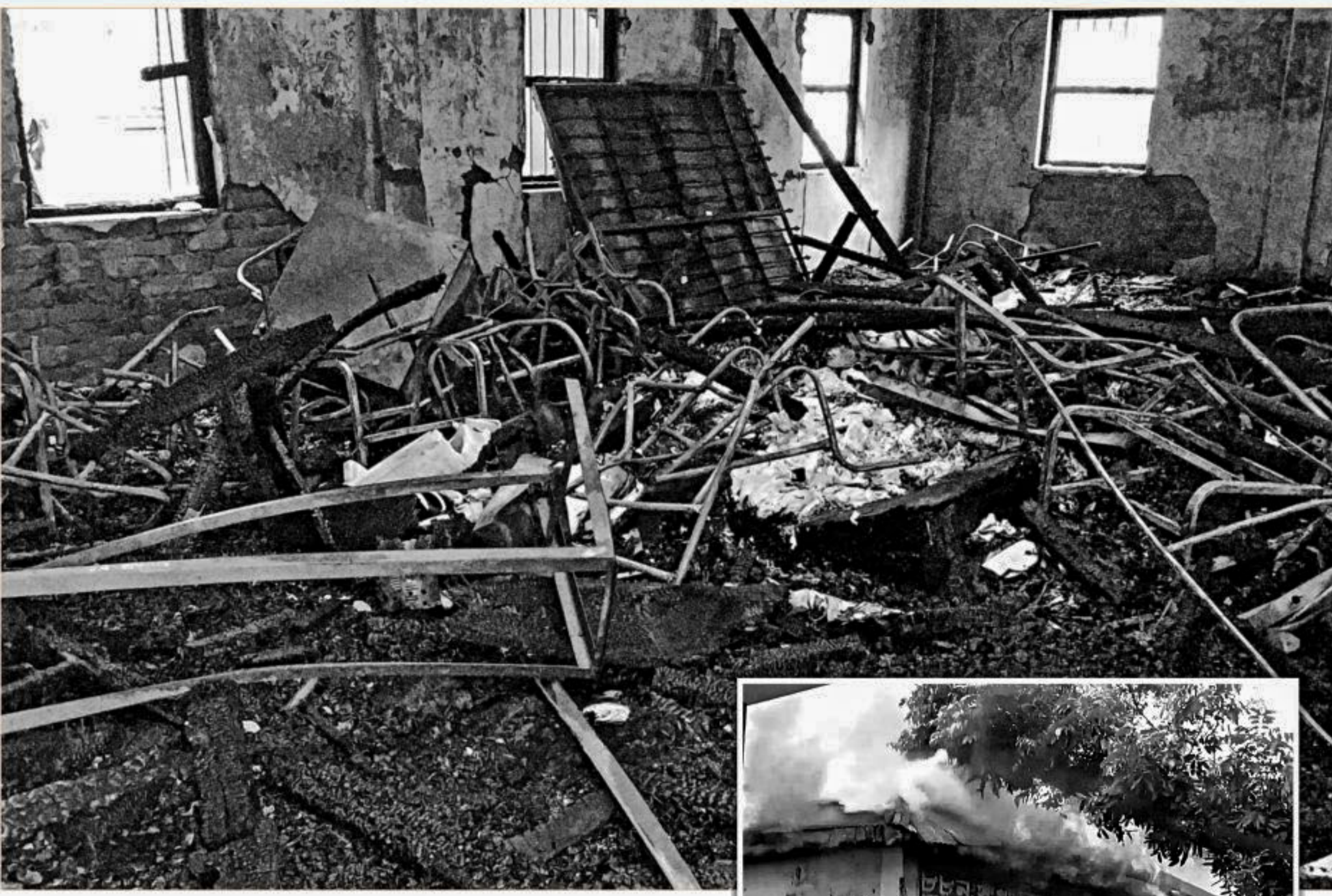
Charred furniture inside a classroom of a primary school in Manikganj after it caught fire yesterday. Inset, firefighters try to douse the blaze that engulfed another school, on the same building. All the classrooms of the two schools were gutted in the mysterious fire.