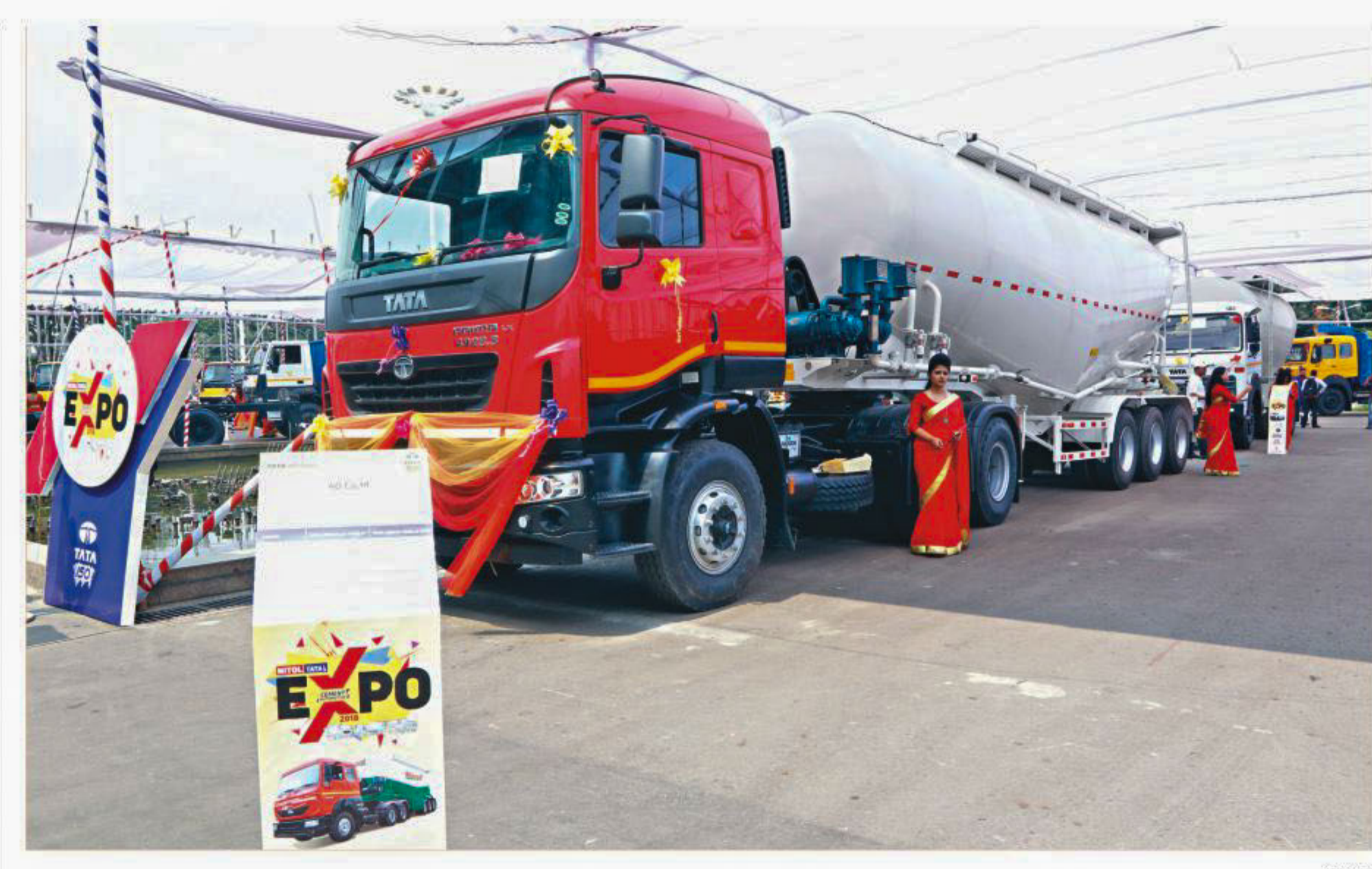
A bulk cement truck is on display at the Cement Automotive Expo 2018 at Bangabandhu International Conference Centre in the capital yesterday.

UNB, Dhaka Proper utilisation of maritime resources available in South Asia can help the region achieve tremendous success in socio-economic development of the people, Prime Minister Sheikh Hasina said yesterday. The maritime sector in South Asia has huge potential, she said. It is possible to take a big leap in the socio-economic development of the people by utilising the potential, Hasina said. The prime minister was addressing the inauguration of a two-day second South Asia Maritime and Logistics Forum 2018 at hotel Le Meridien Dhaka. She said Bangladesh has already settled maritime boundary disputes with two neighbours -- with Myanmar in 2012 and with India in 2014 -- through which it reclaimed 118,813 square kilometres of the Bay of Bengal. "The total area of resources includes 200 nautical miles of exclusive economic zone and over 354 nautical miles of resources on seabed." It is estimated that the resources from the sea of Bangladesh constitute 81 percent of the resources existing in its land territory, the premier said.