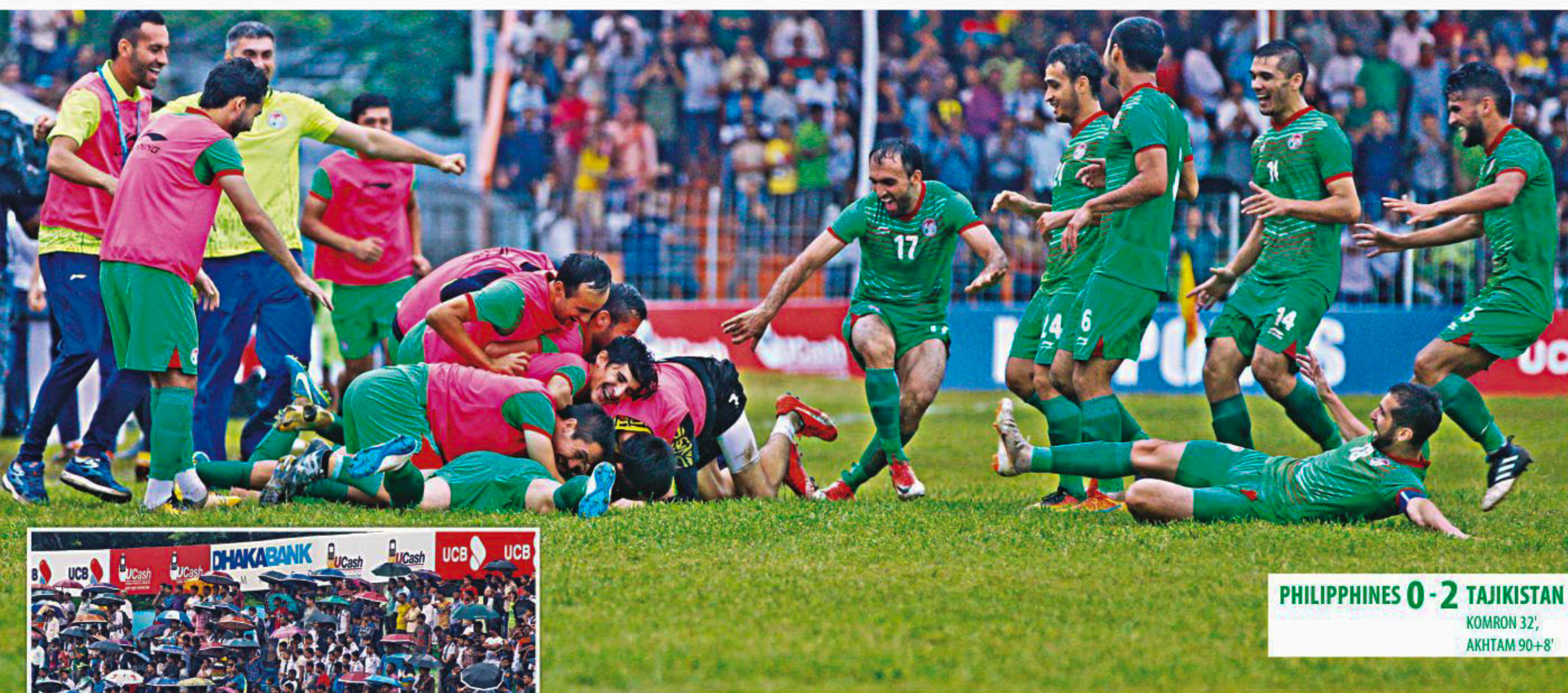
PHILIPPINES 0 - 2 TAJIKISTAN KOMRON 32', AKHTAM 90+8'

Bangladesh v Palestine Time: 2:30pm Venue: Birshreshtha Shaheed Ruhul Amin Stadium