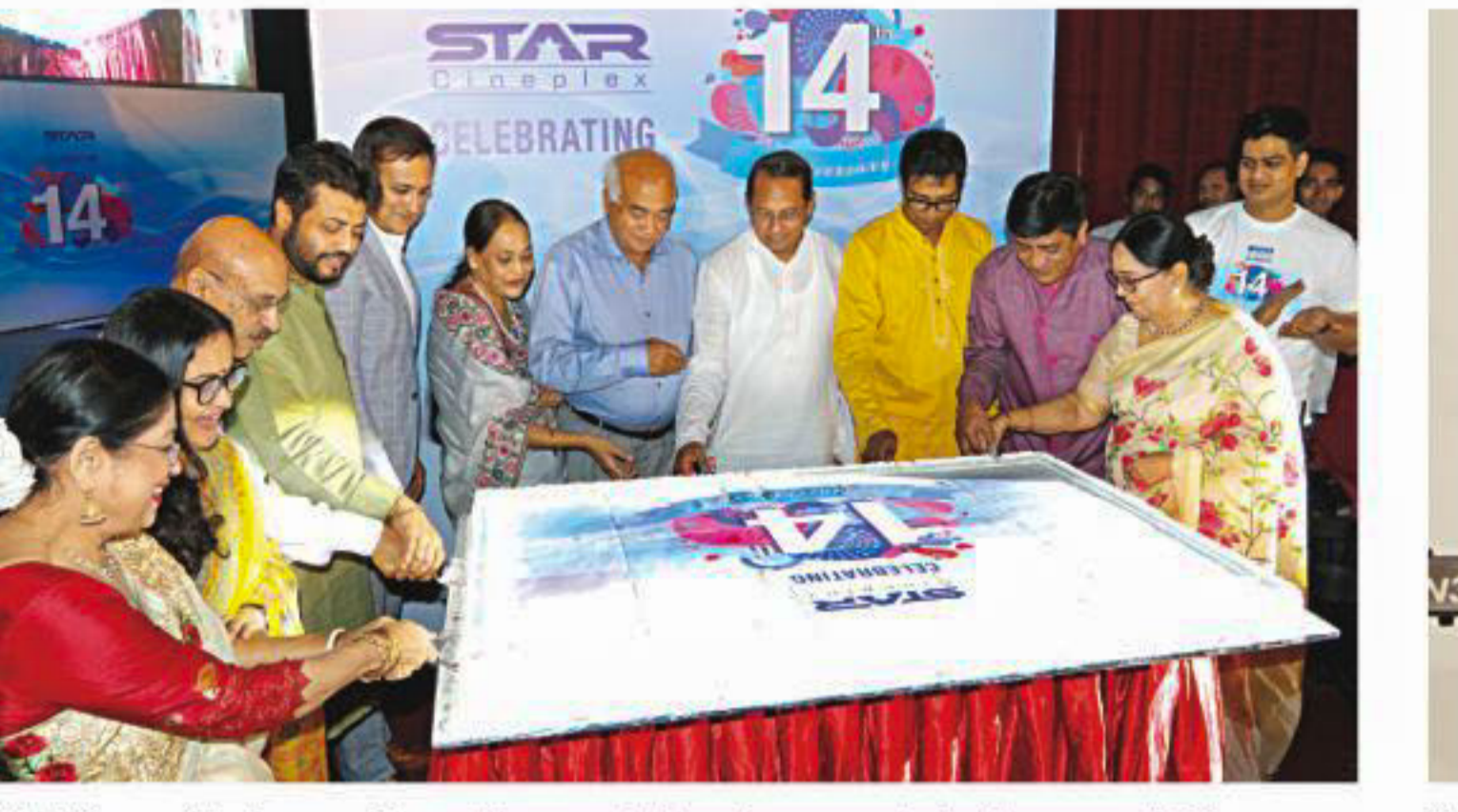
Minister of Information, Hasanul Haq Inu, and chairman of Star Cineplex Mahboob Rahman, cut a cake with other eminent guests.