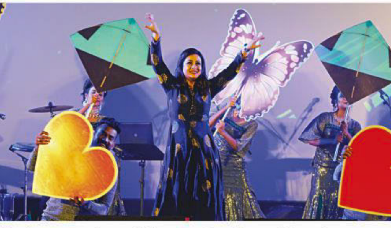
The festive atmosphere of the event is enhanced by a dance performance from popular actor Purnima.

Projapati, Zero Degree, Hridoyer Kotha, Chandragrohon, Shikari, Aynabaji, Bhuban Majhi and Dhaka Attack. Producers, directors and actors of the aforementioned films were present to receive the honours. Four juggernauts