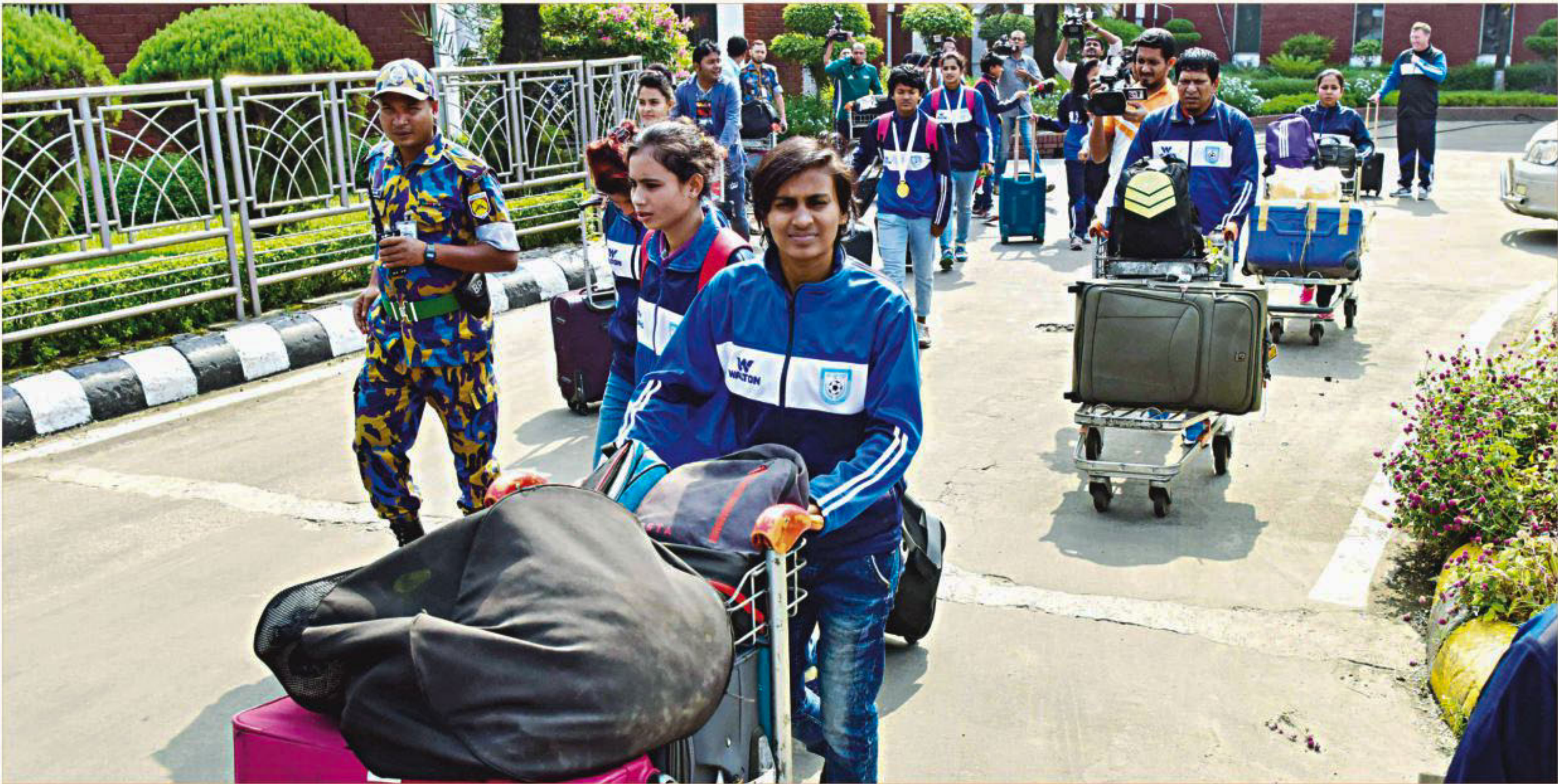
Bangladesh players and officials walk out of the Hazrat Shahjalal International Airport yesterday morning on their return from Bhutan where they won the title of the inaugural SAFF U-18 Women's Championship on the previous night.

But they know that their job is not done yet since it is a continuous process and since they are still