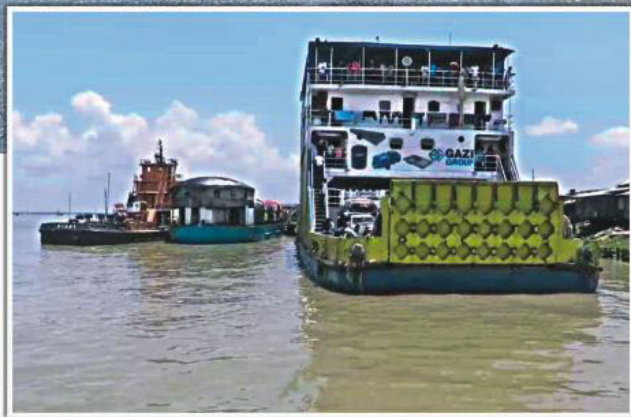
Vehicles in a long queue wait to cross the Padma from the Paturia terminal in Manikganj yesterday afternoon amid disruption of ferry services due to poor navigability and strong currents in the river. Inset, ferries anchored at Shimulia terminal in Munshiganj as their operations on Shimulia-Kathalbari route remain suspended.