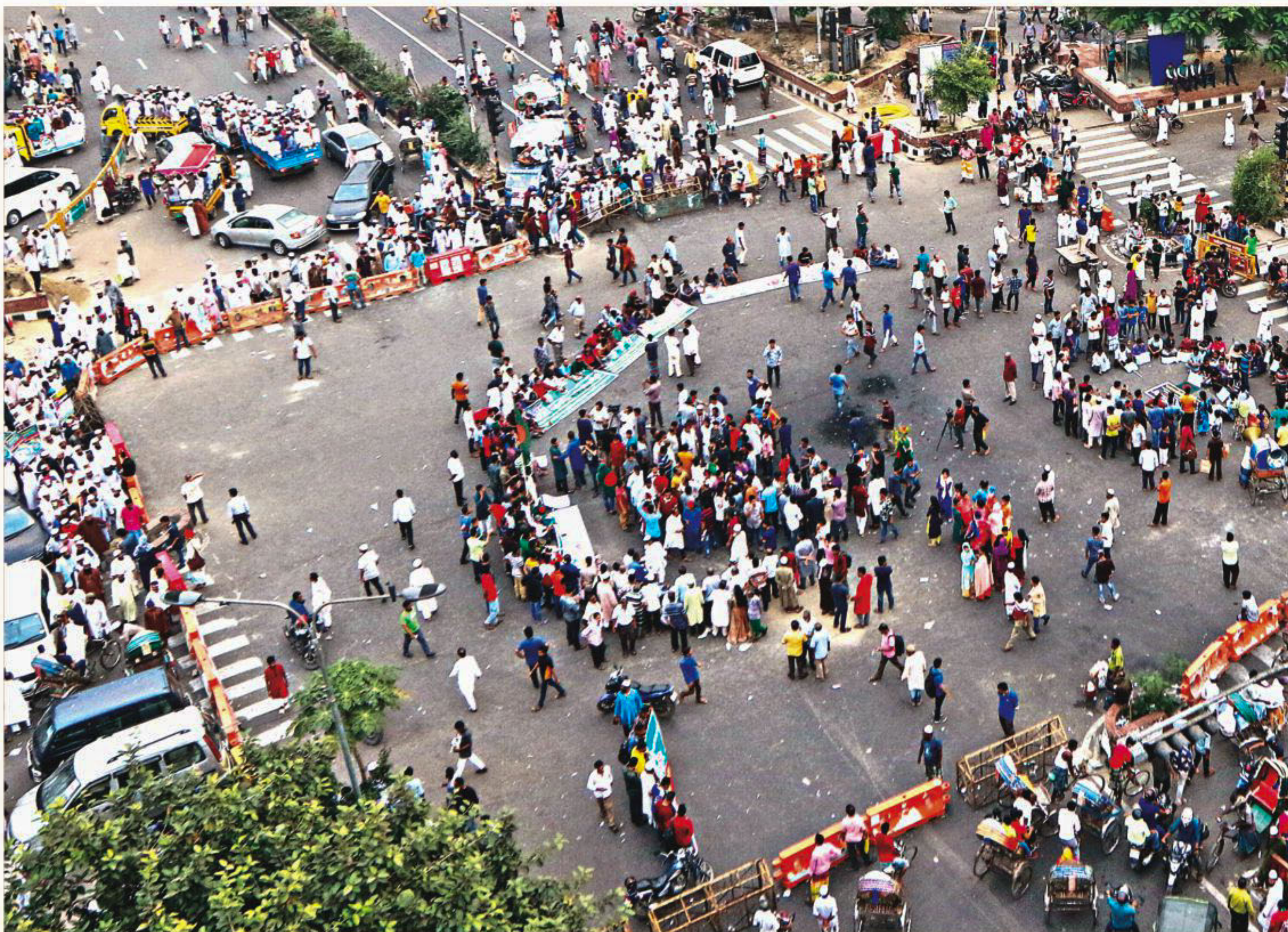
The blockade of Shabbagh intersection continues for the third consecutive day yesterday to protest the scrapping of freedom fighter quota for class-I and class-II jobs in civil service.