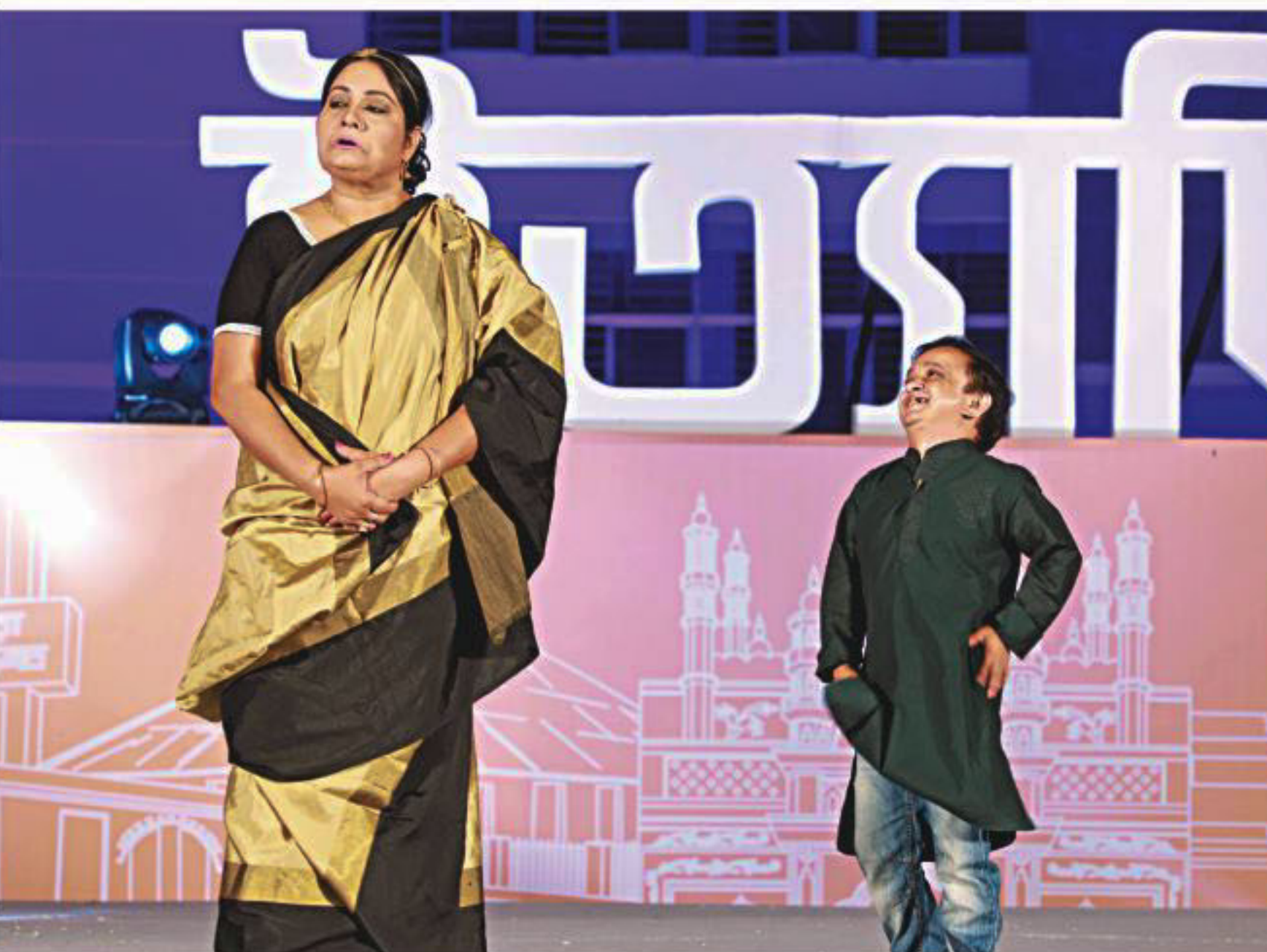
The famous duo of 'Nani' and 'Nati'.