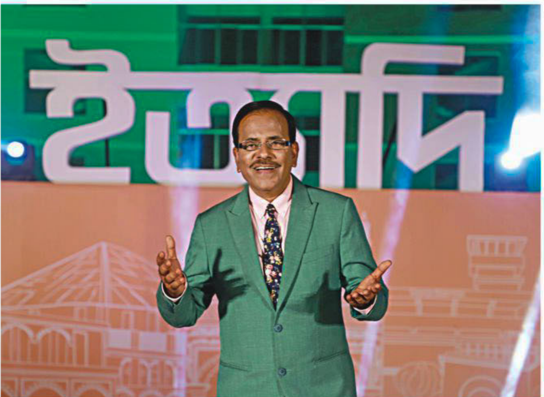
Hanif Sanket hosting the show.

Minister of Cultural Affairs, Asaduzzaman Noor, MP, who also happens to be a proud son of Nilphamari, graced the segment and distributed prizes among the winners.