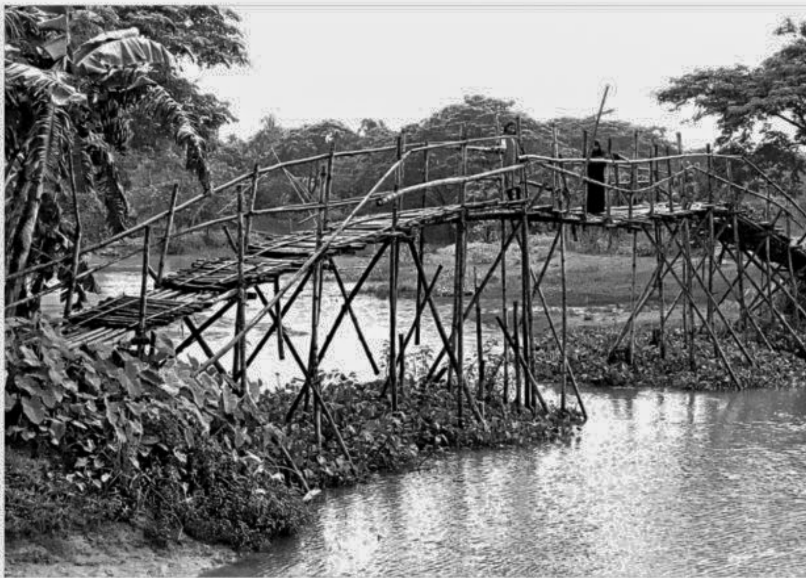
Locals cross the bamboo bridge on the Bhogai river in Netrakona's Kalmakanda upazila.

Local people alleged that on various occasions, the political leaders of different parties gave pledges to construct a bridge on the river but none did it yet.