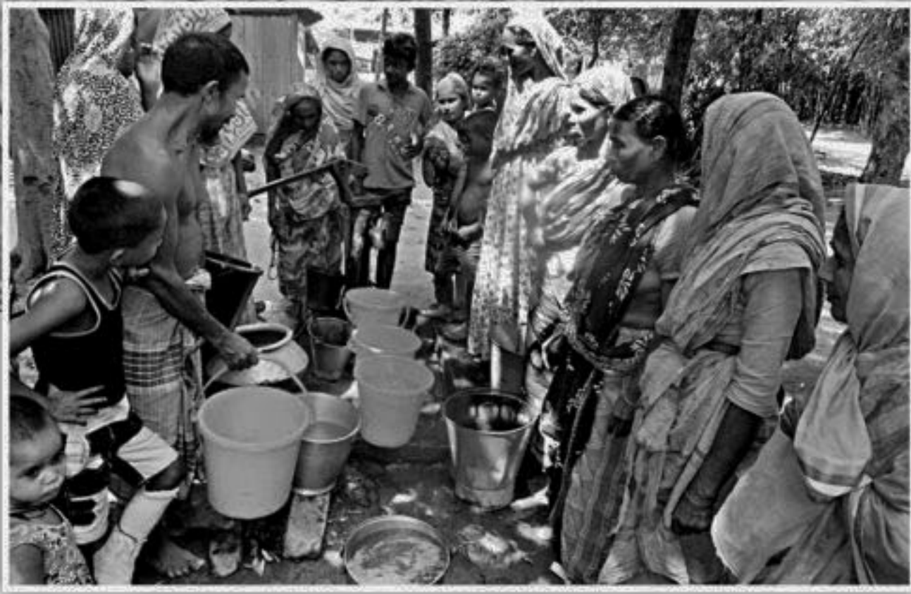
Residents of Horish Chandra Pat Abasan project at Khutamara union in Jaldhaka upazila of Nilphamari standing in front of a totally damaged house. Inset, residents of Horish Chandra Gar Dharmapal Abasan project collect drinking water from the lone tube-well for 100 families with 500 members residing there.