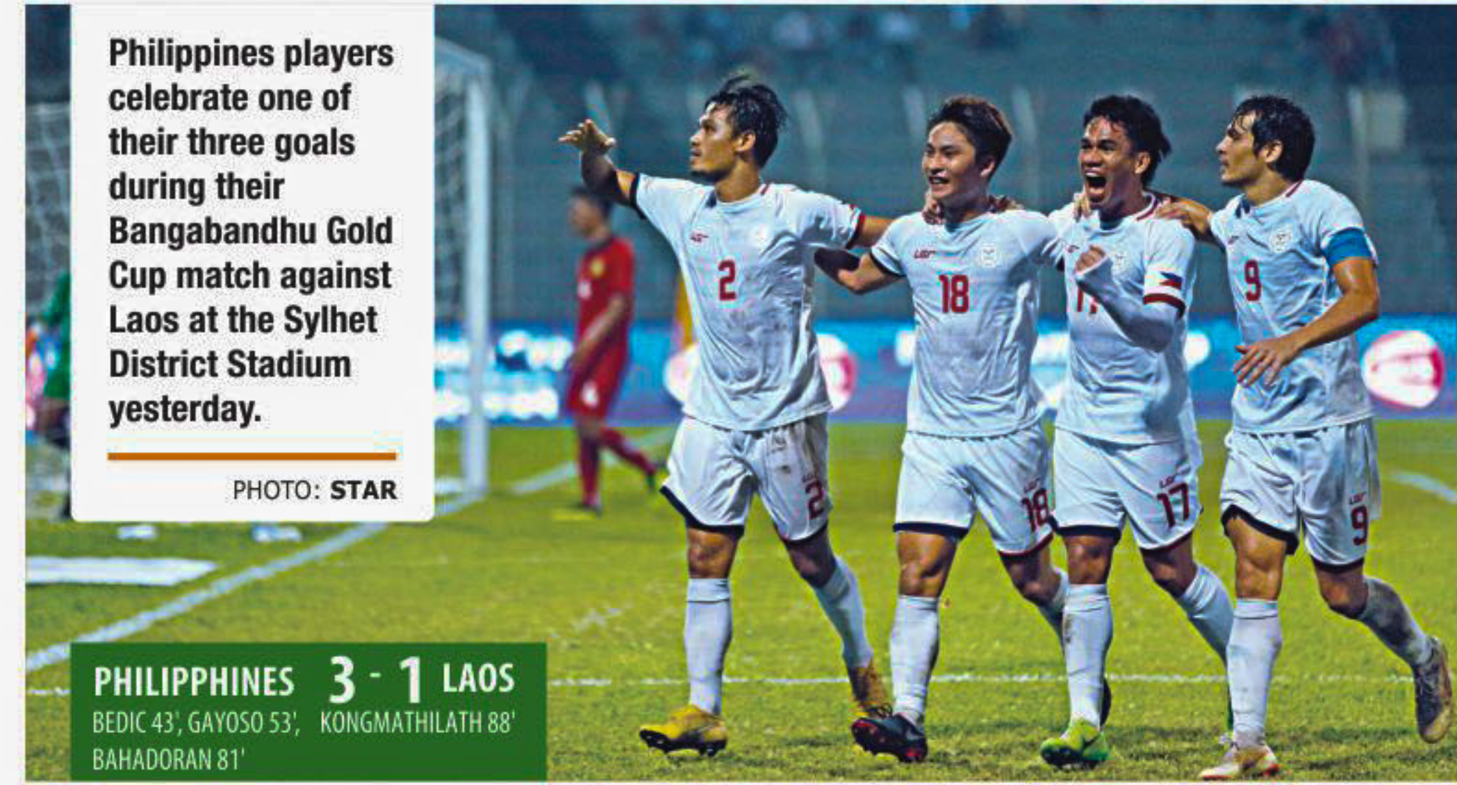
Philippines players celebrate one of their three goals during their Bangabandhu Gold Cup match against Laos at the Sylhet District Stadium yesterday.

Despite those odds, Philippines showed their