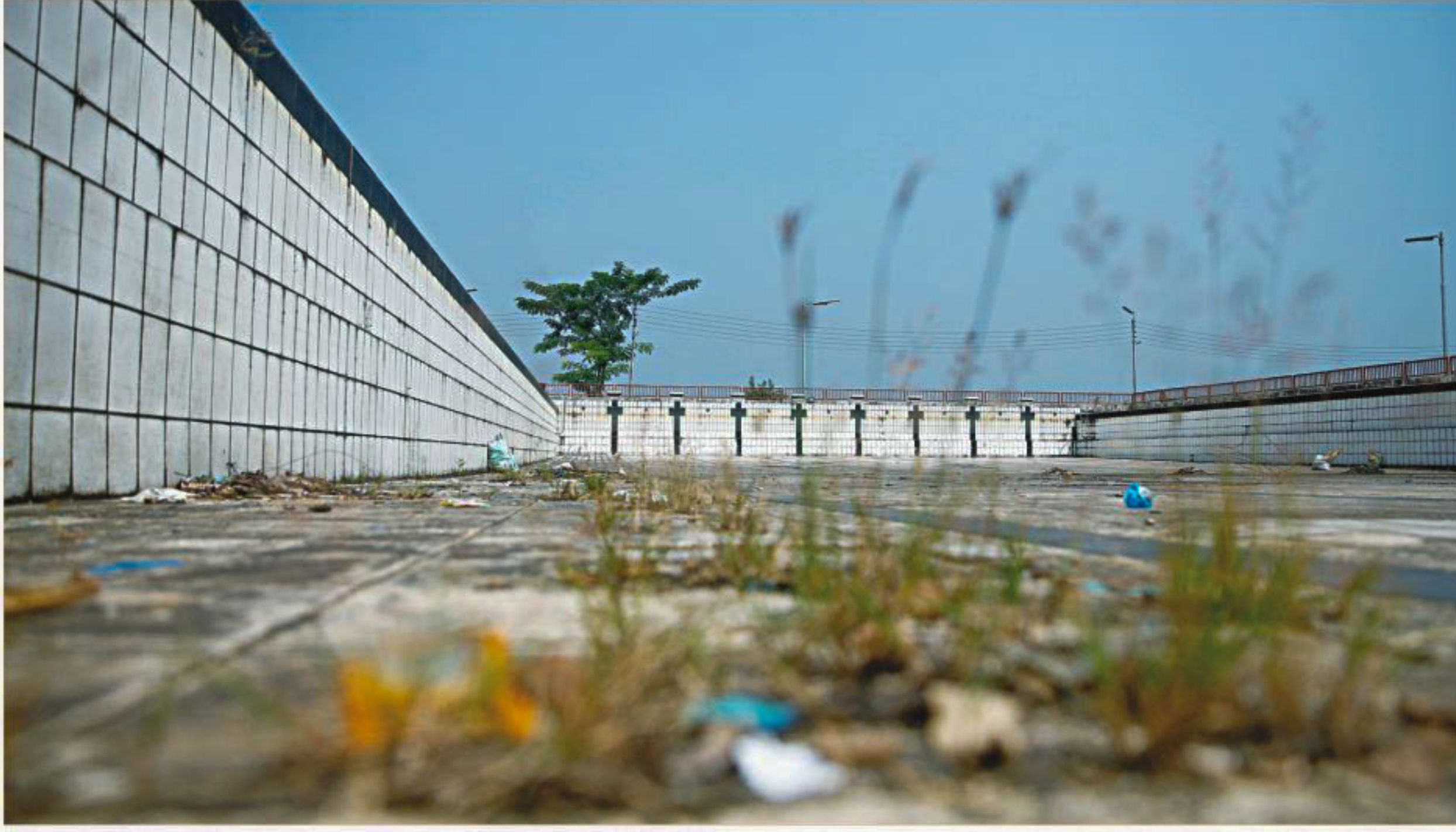
Unrecognisable and dilapidated, the swimming pool at the Sylhet BKSP has been neglected for so long that plants have begun to bloom through the broken tiles that line the bottom of the structure.

After training in the calm and quiet environment, the Bangladesh under-16 team, comprising mostly players