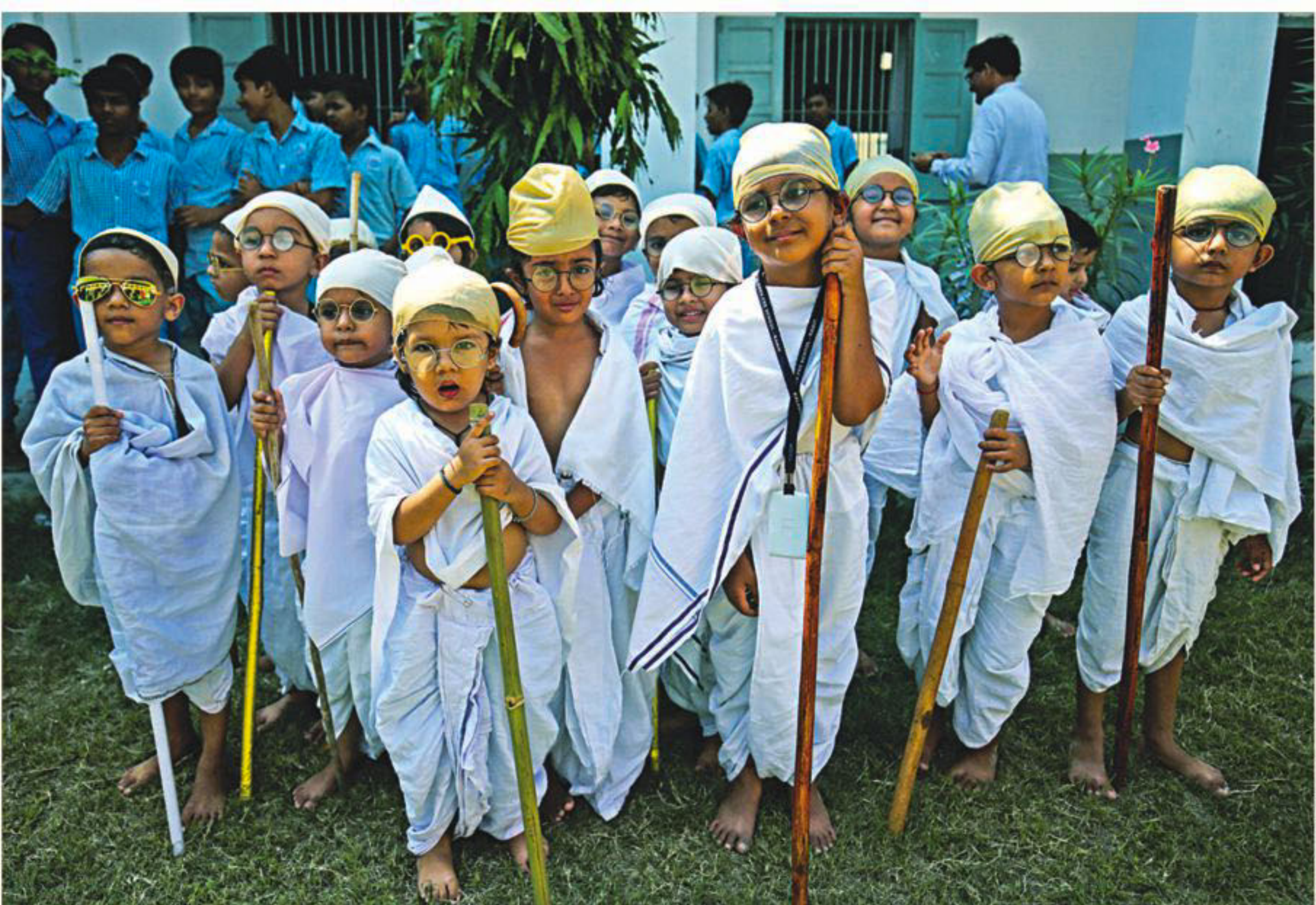
Students dressed as Mahatma Gandhi take part in an event to mark Gandhi's 150th birth anniversary, at a school in Ahmedabad, India, yesterday. Gandhi Jayanti or Birthday of Mahatma Gandhi is celebrated on October 2 every year.

His remarks were quickly denounced by two former civil service heads of the Foreign Office.