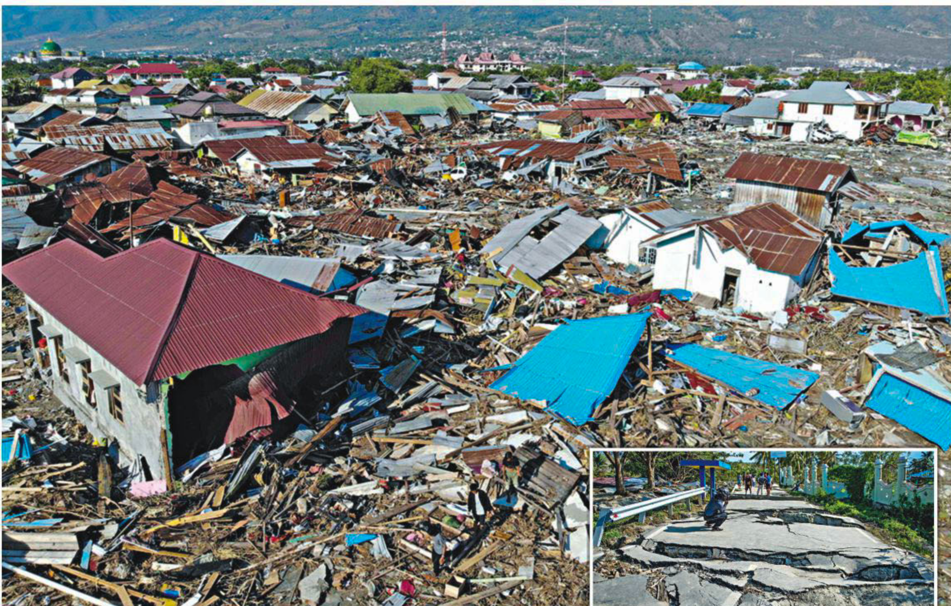
An aerial view shows the earthquake and tsunami devastated neighbourhood in Palu, Indonesia's Central Sulawesi, yesterday. Inset, A damaged road in Palu.

A total of 675 migrants, including children and babies, were rescued off the Spanish coast over the weekend, a government spokesman told AFP. On Saturday, 405 were picked up from what are often unseaworthy people smugglers' vessels, with seven children and babies among the African migrants.