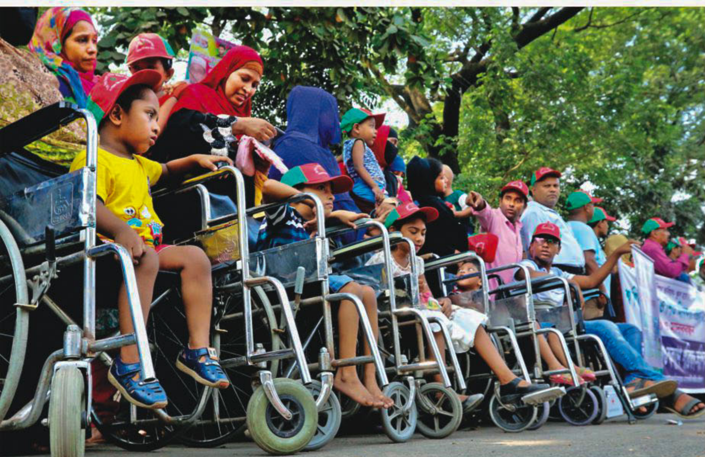
Marking World Children's Day (observed on the first Monday of October) and National Child Rights Week 2018 (October 1-7), Bangladesh Shishu Kalyan Parishad, a platform working for children's welfare, brought out a rally and formed a human chain in front of the Jatiya Press Club yesterday. Speakers at the programme called on people from all walks of society to come forward in ensuring children's rights.