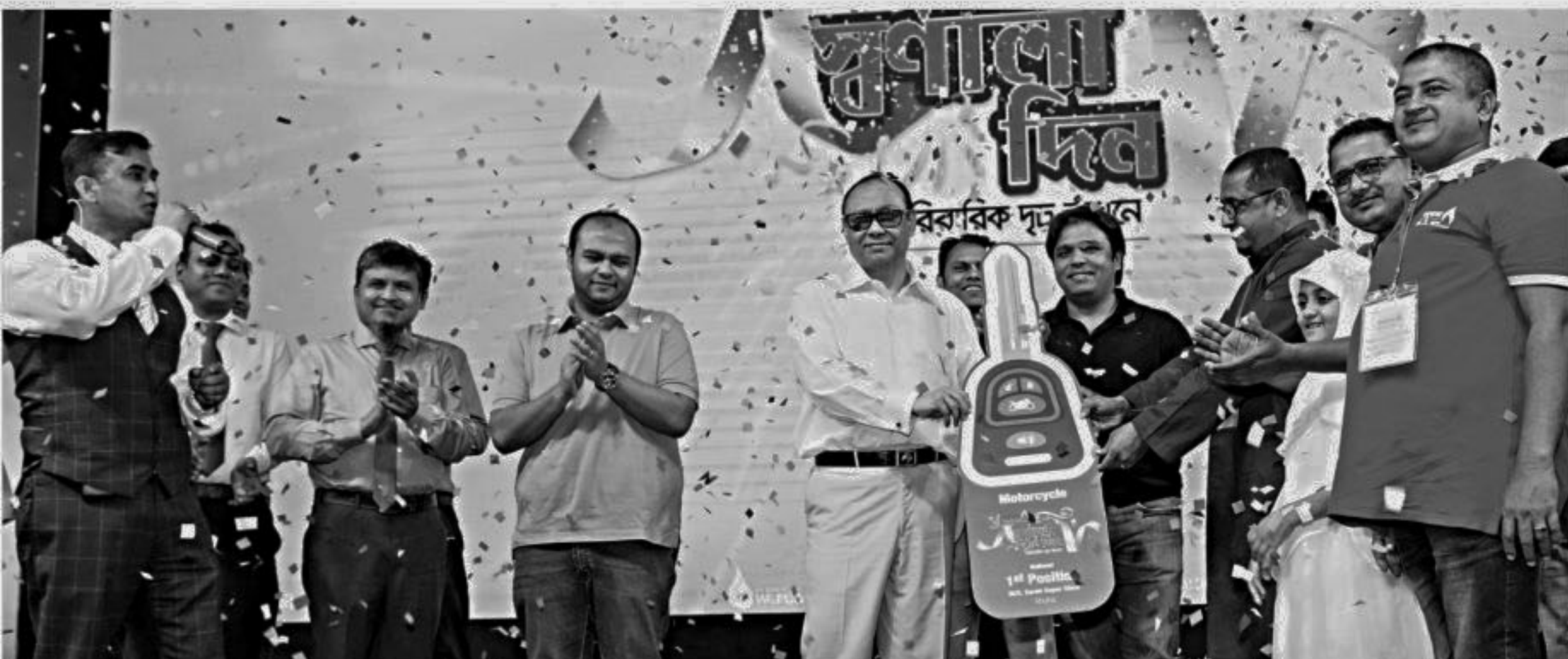
BASHUNDHARA LP GAS

Neither Musk nor Tesla admitted or denied the SEC's findings as part of the settlement, which still must be approved by a court. Tesla and Musk did not immediately respond to requests for comment.