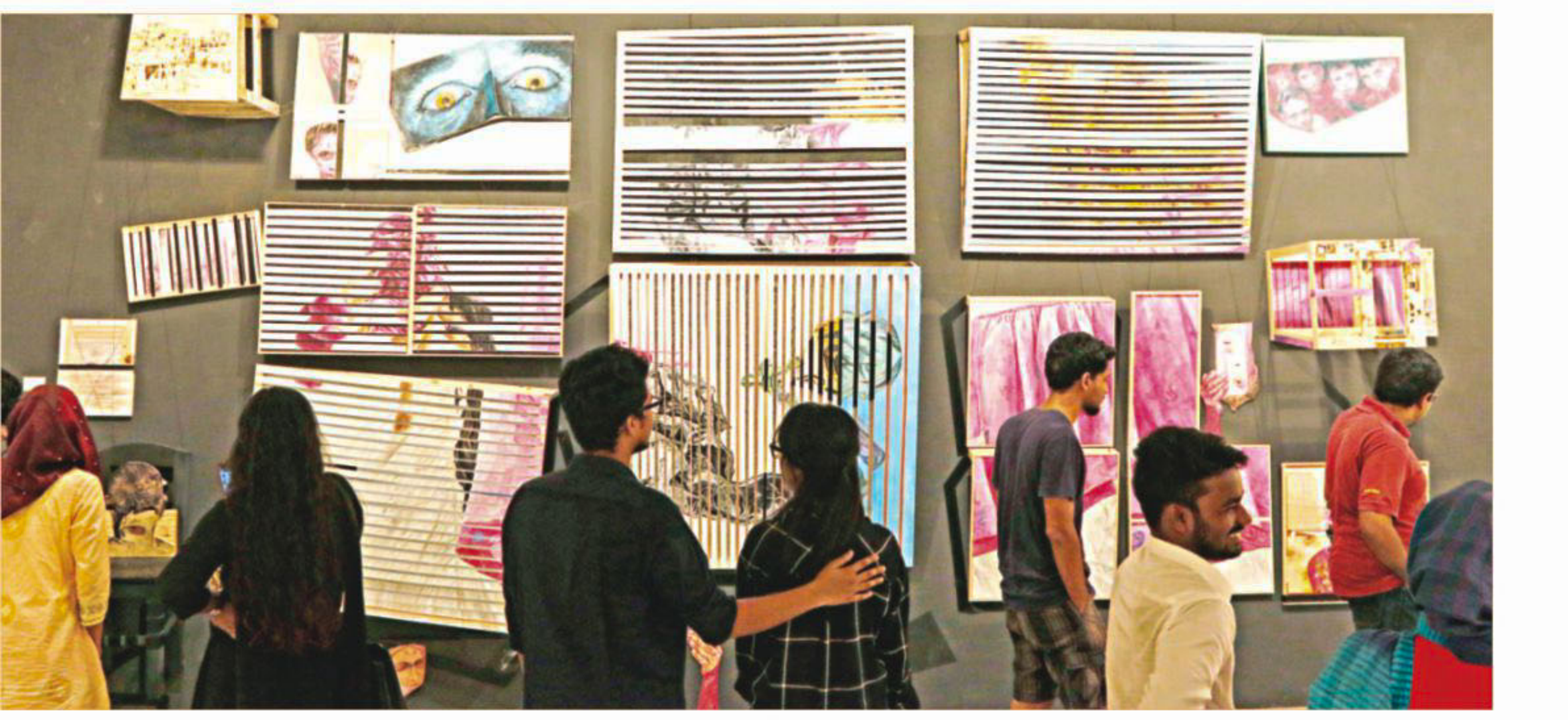
A cramped display of artworks at the biennale.