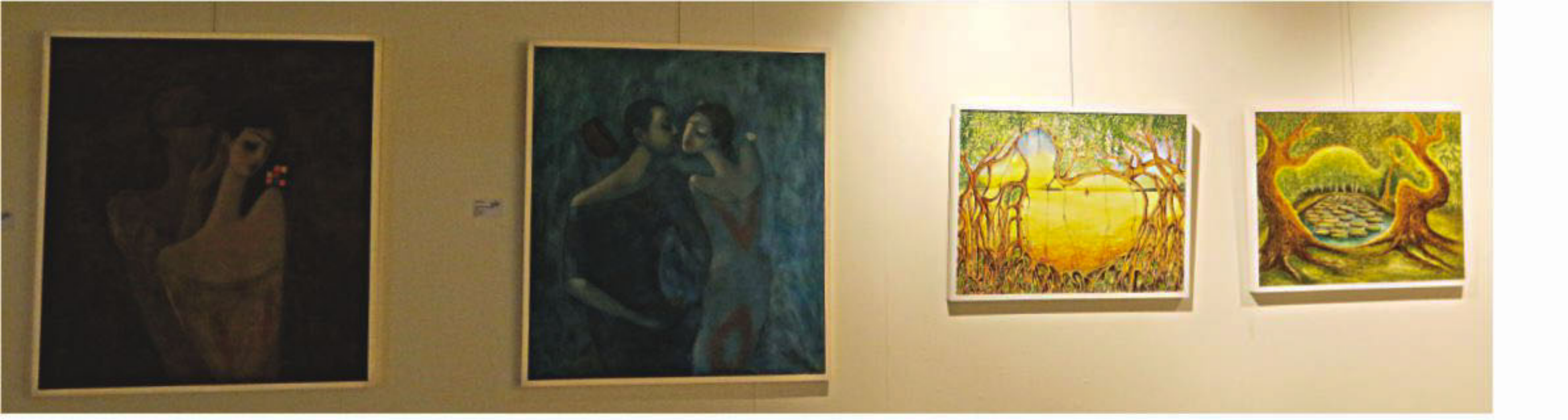
One of the many poorly lit sections of the exhibition.