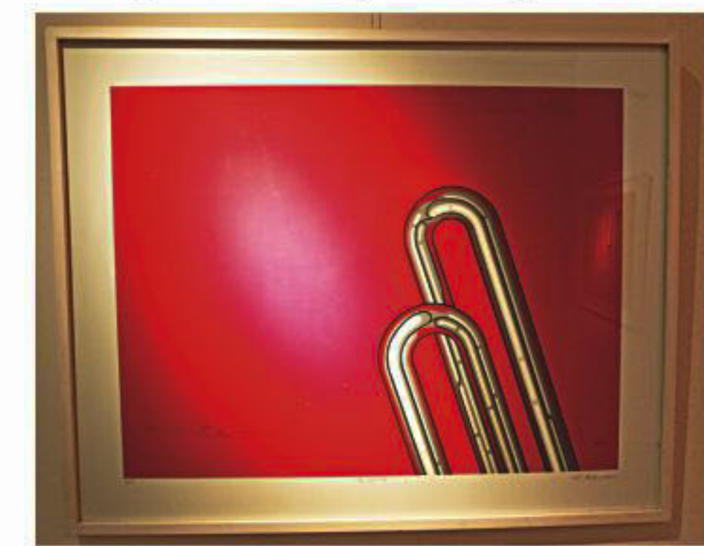
An artwork which had the frame manufacturer's name on it. Loose paint was splattered across the painting as well.