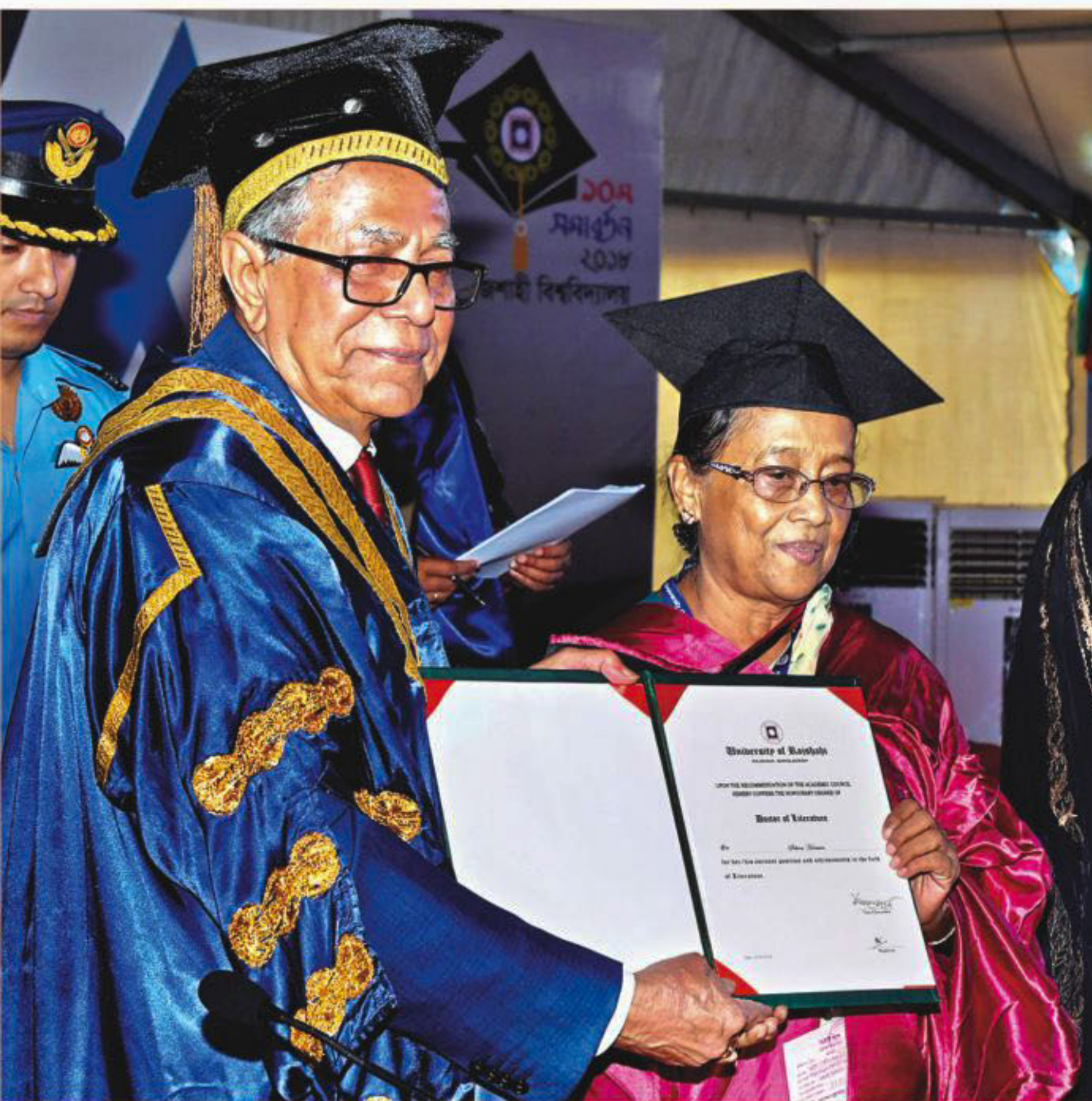
President Abdul Hamid, also chancellor of Rajshahi University, hands over the Doctor of Letters (DLitt) degree to litterateur Selina Hossain at the 10th convocation of the university yesterday.