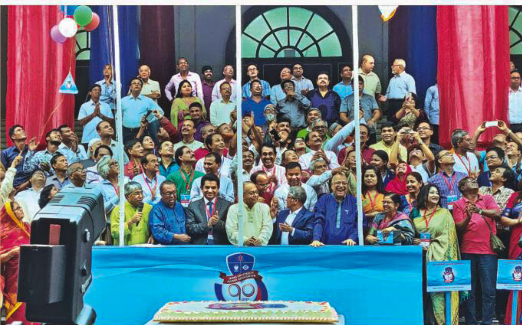
A ripple of laughter runs through a gathering of former students as they celebrate the 70th founding anniversary of Dhaka University Alumni Association yesterday.