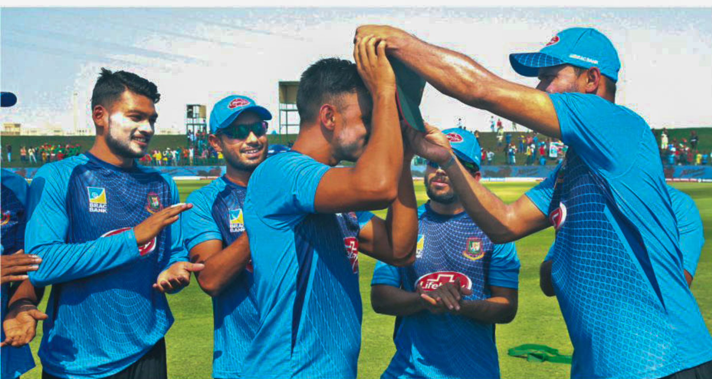
Captain Mashrafe Bin Mortaza gives Abu Haidar his debut cap in the Asia Cup.

Bangladesh's young cricketers came under immense criticism in the recently concluded Asia Cup. It did not take too long for people to dismiss the likes of Nazmul Hossain Shanto, Liton Das and Mosaddek Hossain.