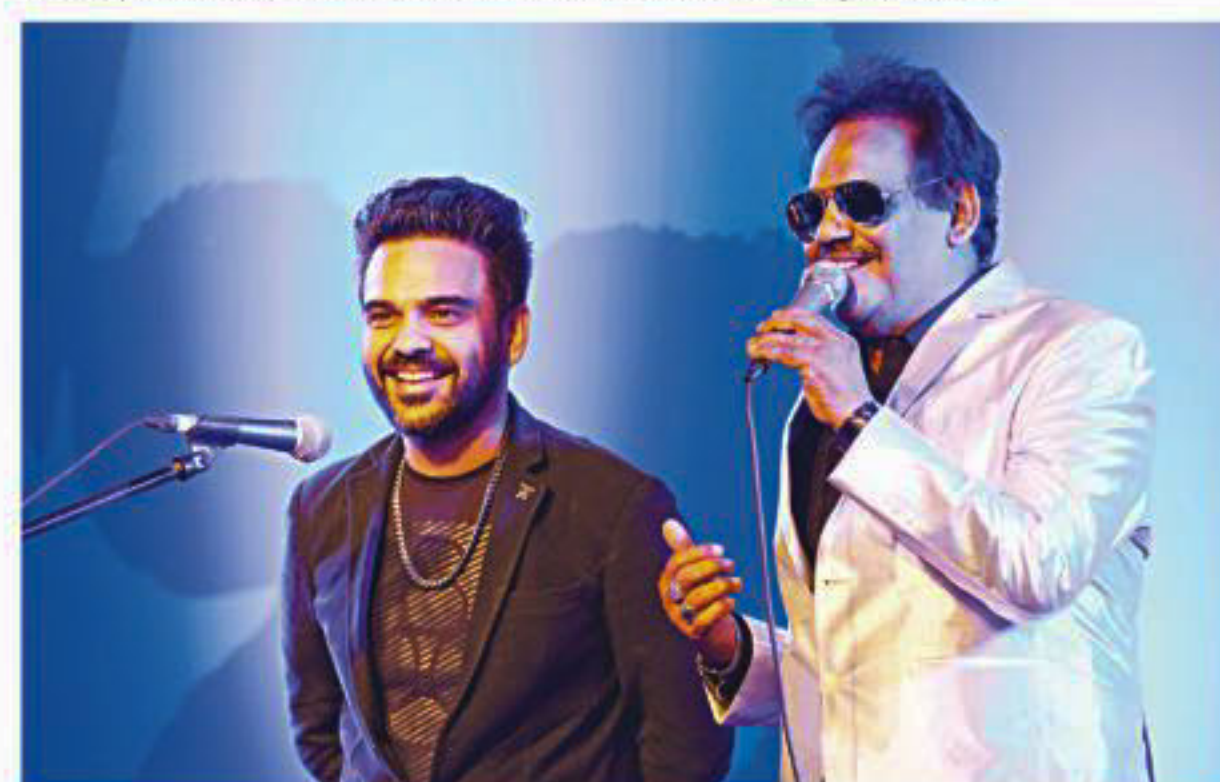
Habib Wahid and Ferdous Wahid