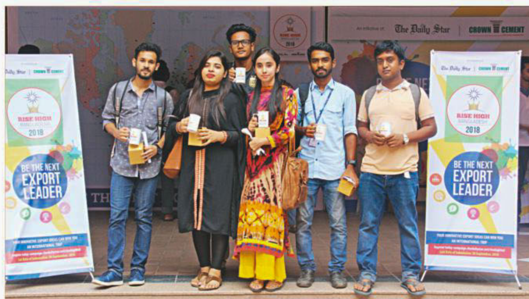
Campus activation programmes of the export idea contest "Rise High Bangladesh - Season 3" were held at North South University and East West University on Wednesday and yesterday respectively. In this photo, puzzle winners posing at East West University.