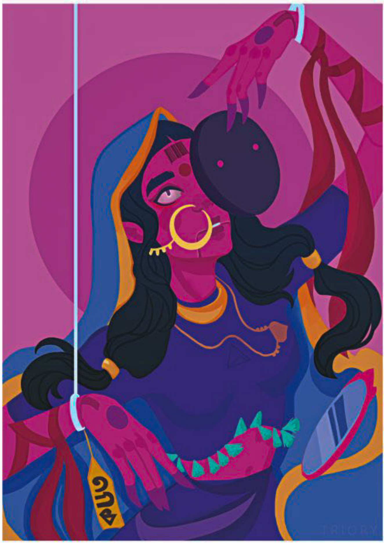
'Puppets of Patriarchy'