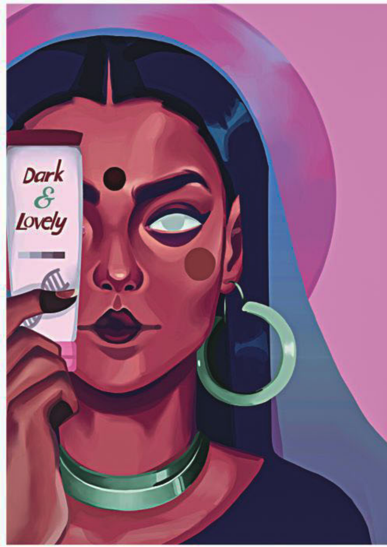
'Dark and Lovely'