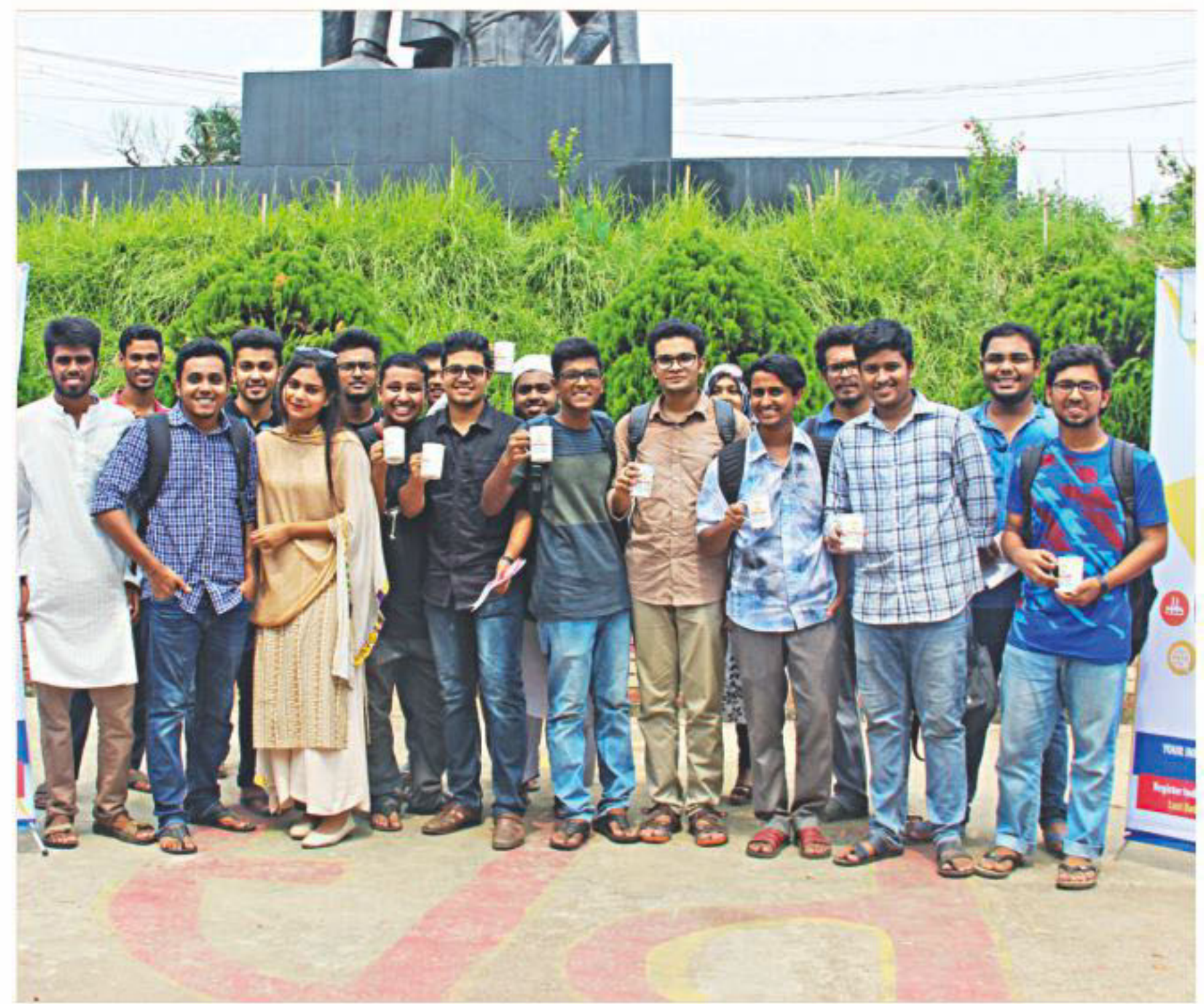
Students posing with token prizes on Jahangirnagar University campus yesterday.

Earlier, two activations were also held at Independent University of Bangladesh (IUB) and Brac University on Sunday and Monday respectively.