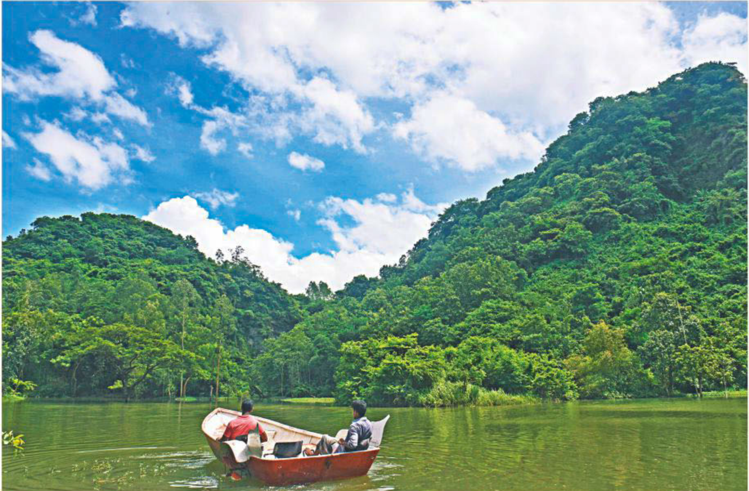
This beautiful natural setting left , is only a prelude to the waterfall, Sahasradhara Jharna (a waterfall of a thousand streams). It is located only a few kilometres from the bustle of Sitakunda upazila headquarters. A traveller can take a short motorcycle or car ride, trek on the meandering path along the green hillocks from Chhoto Darogar Haat and then take a boat to soak in the greenery. The photos were taken recently.