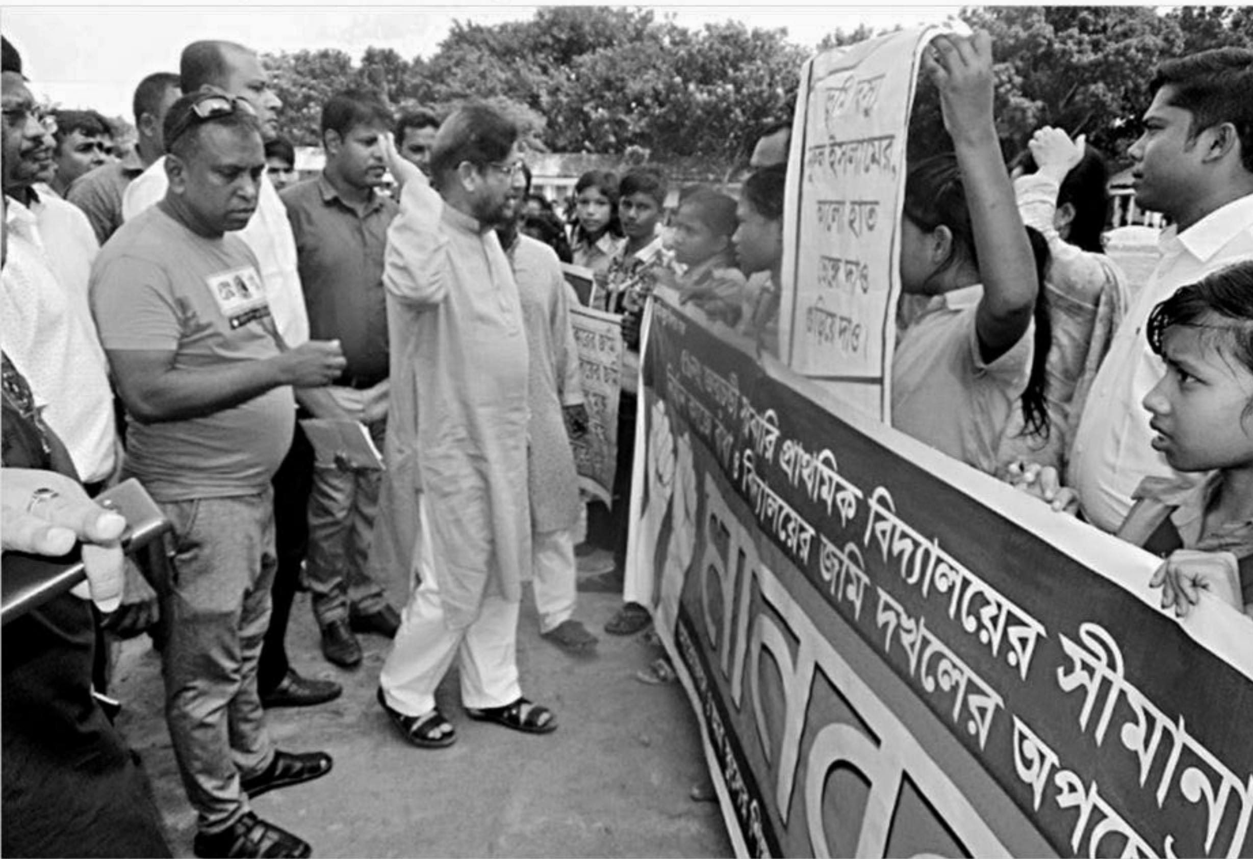
Cultural Affairs Minister Asaduzzaman Noor listens as students of Joichondi Government Primary School in Nilphamari Sadar upazila seek his interference yesterday to recover their school land from an influential grabber.