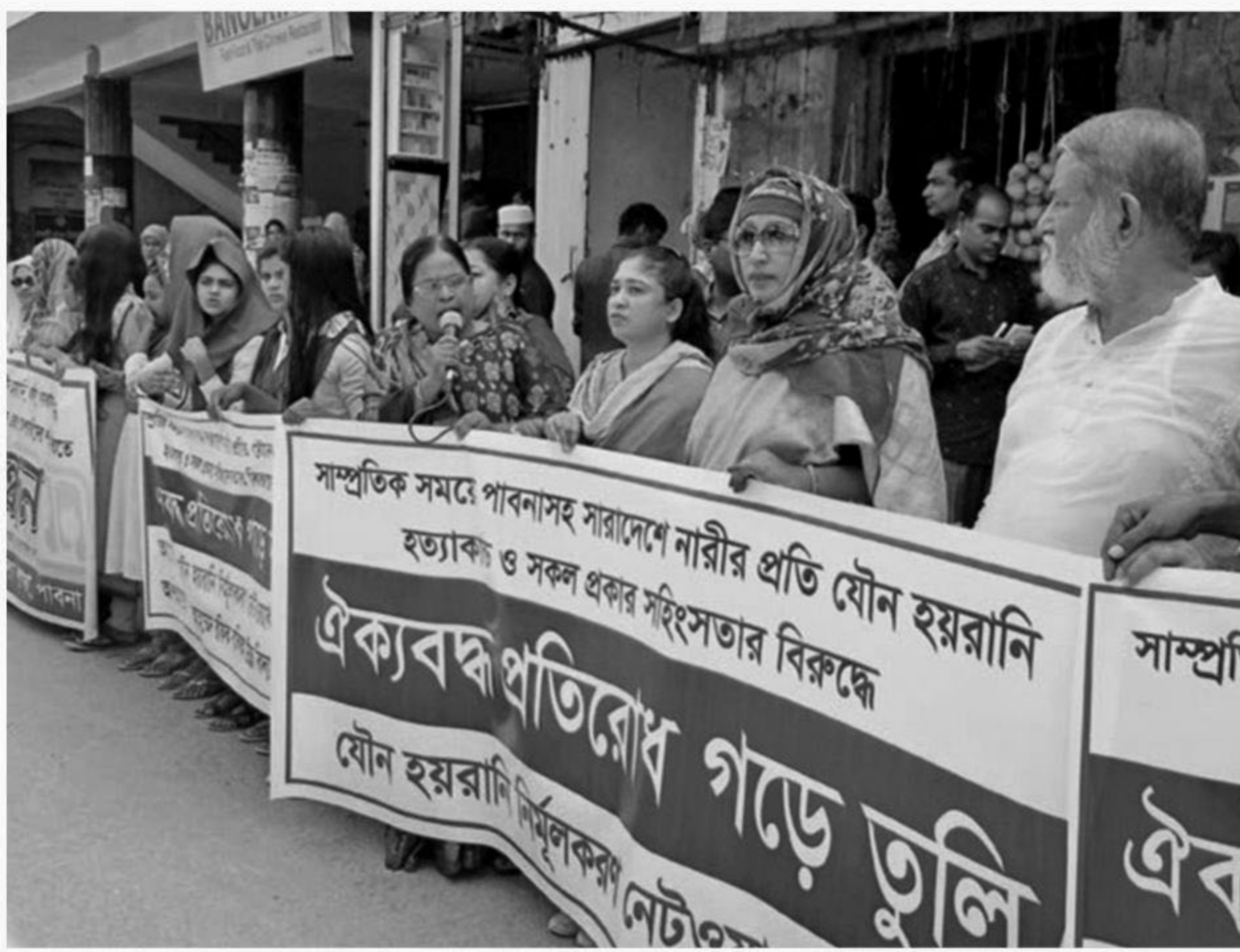
Cross section of people join a human chain in Pabna town yesterday demanding stern action against offenders to prevent sexual harassment and violence against women.

After examining witnesses and evidence, the court found them guilty and pronounced the verdict.