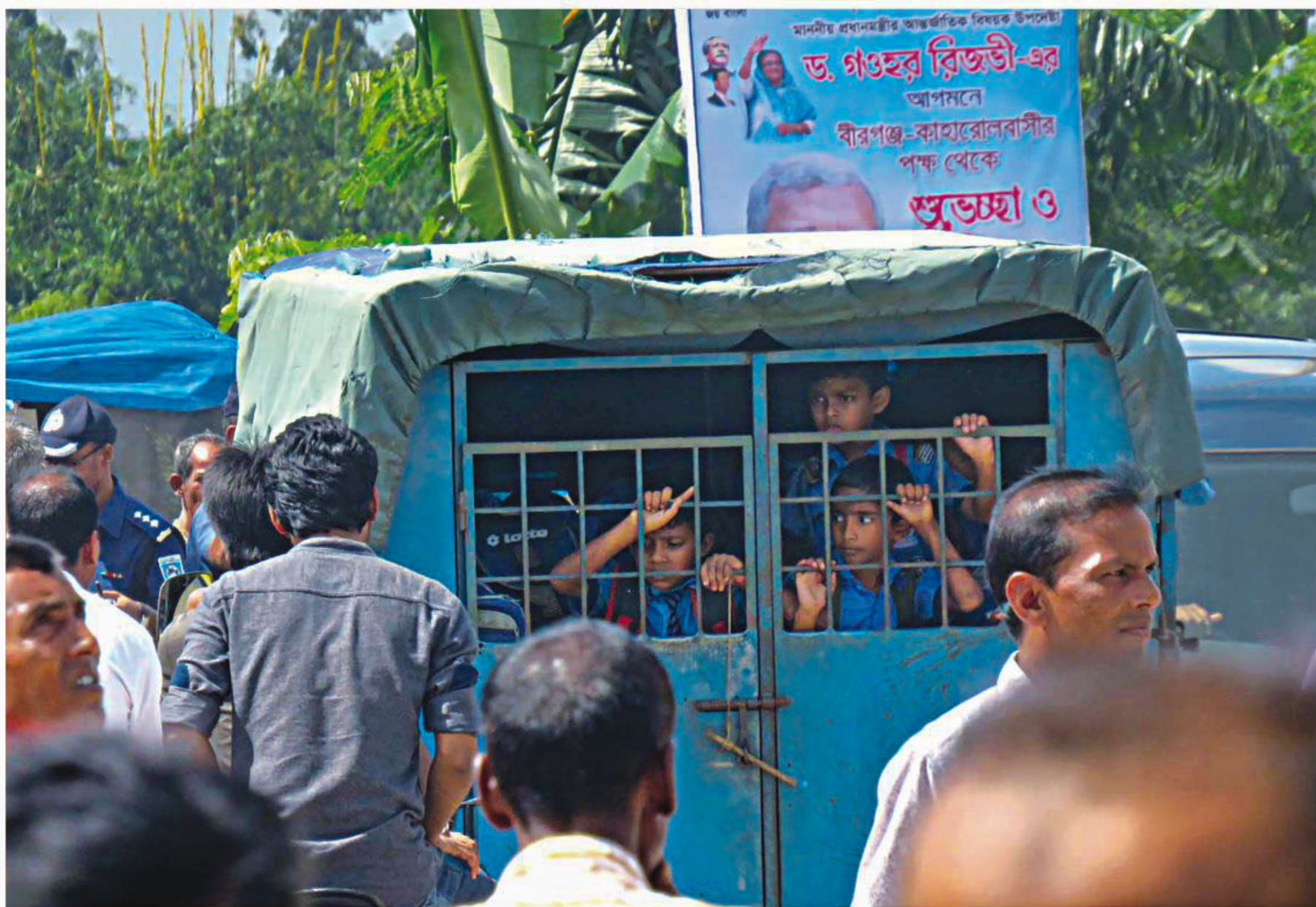
Children in uniform are seen peeking out through the rear door locked from the outside. A dangerously-designed van, resembling a prison bus, is used to transport children from school to their homes. The photo was taken from Kantajew Temple Road on Dinajpur-Panchagarh highway recently.