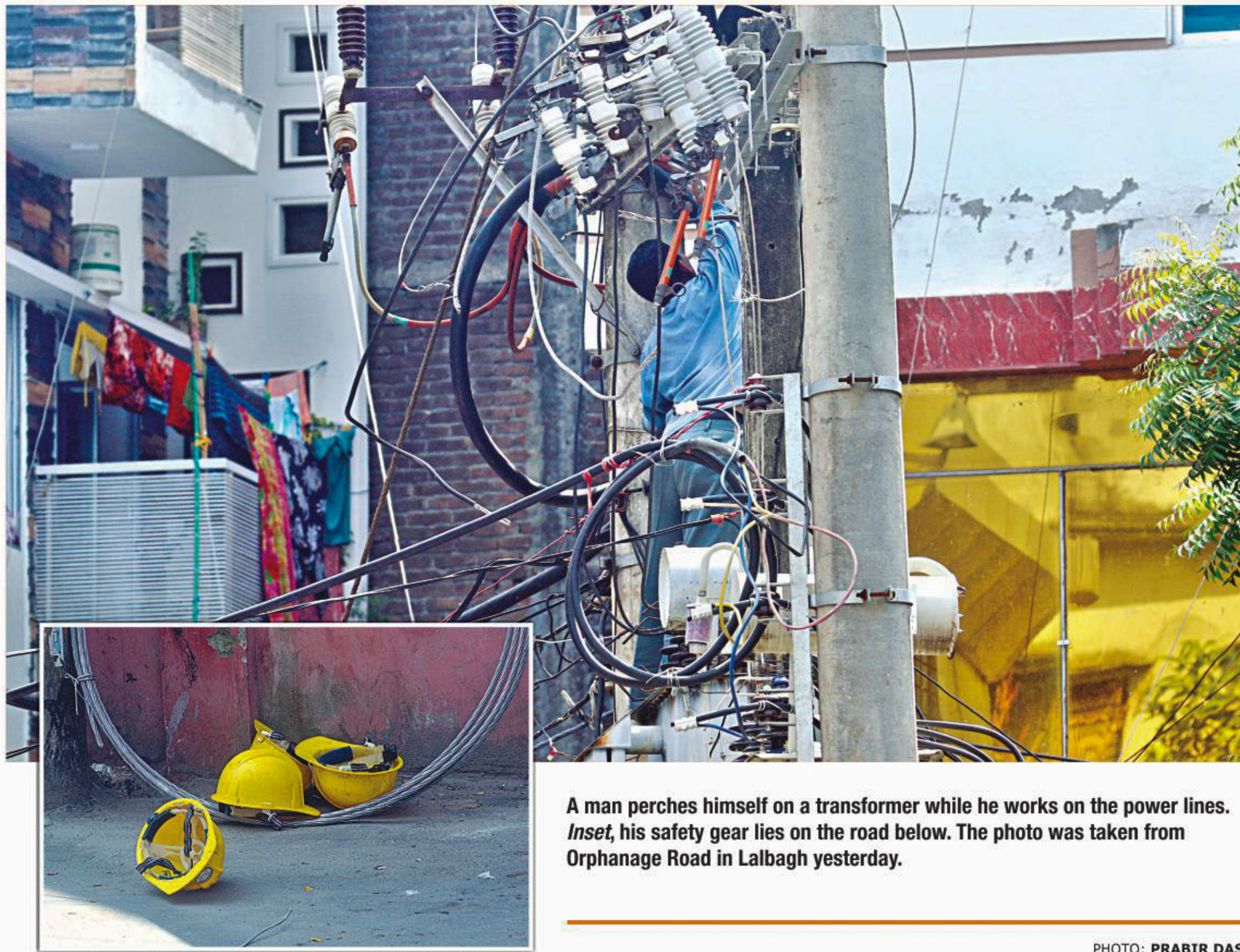
A man perches himself on a transformer while he works on the power lines. Inset, his safety gear lies on the road below. The photo was taken from Orphanage Road in Lalbagh yesterday.