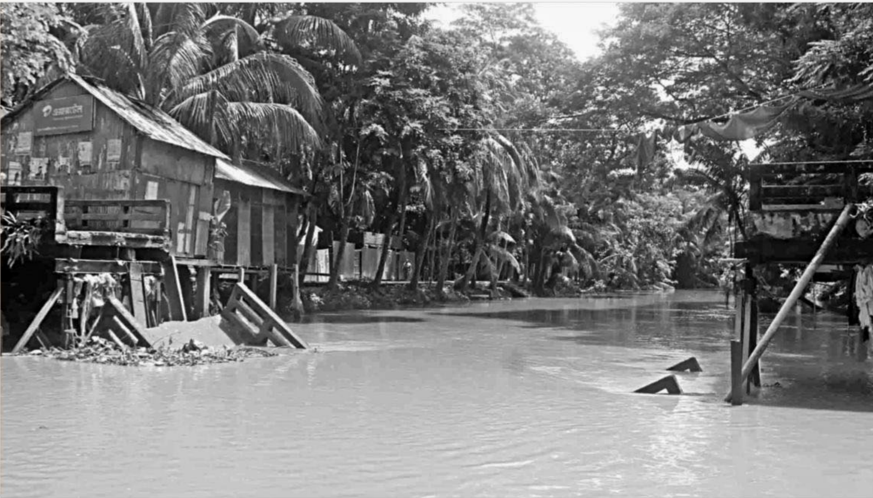
This 32-metre-long iron-frame concrete bridge, constructed about 20 years ago over Kachuakathi canal in Pirojpur's Kawkhali upazila, collapsed on Friday due to strong current, snapping road communication between Kachuakathi village and the upazila headquarters.

Police arrested auto-rickshaw driver Selim Mia, 30, on September 15 in this regard and drives are on to arrest all the accused, he added.