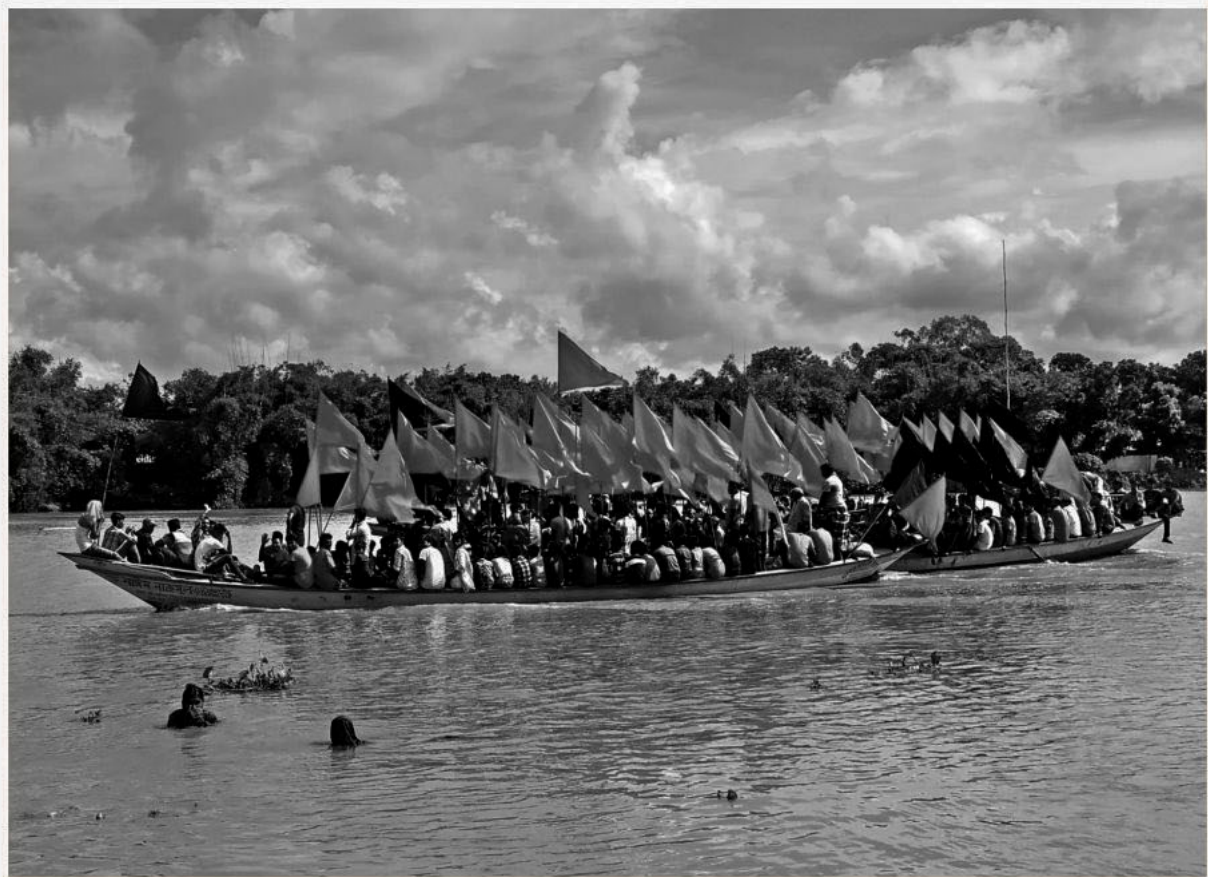
Followers of different pirs (spiritual leaders) bring out a boat procession in the Kaliganga river in Char Bewtha area of Manikganj Sadar upazila on Friday, marking the holy Ashura.