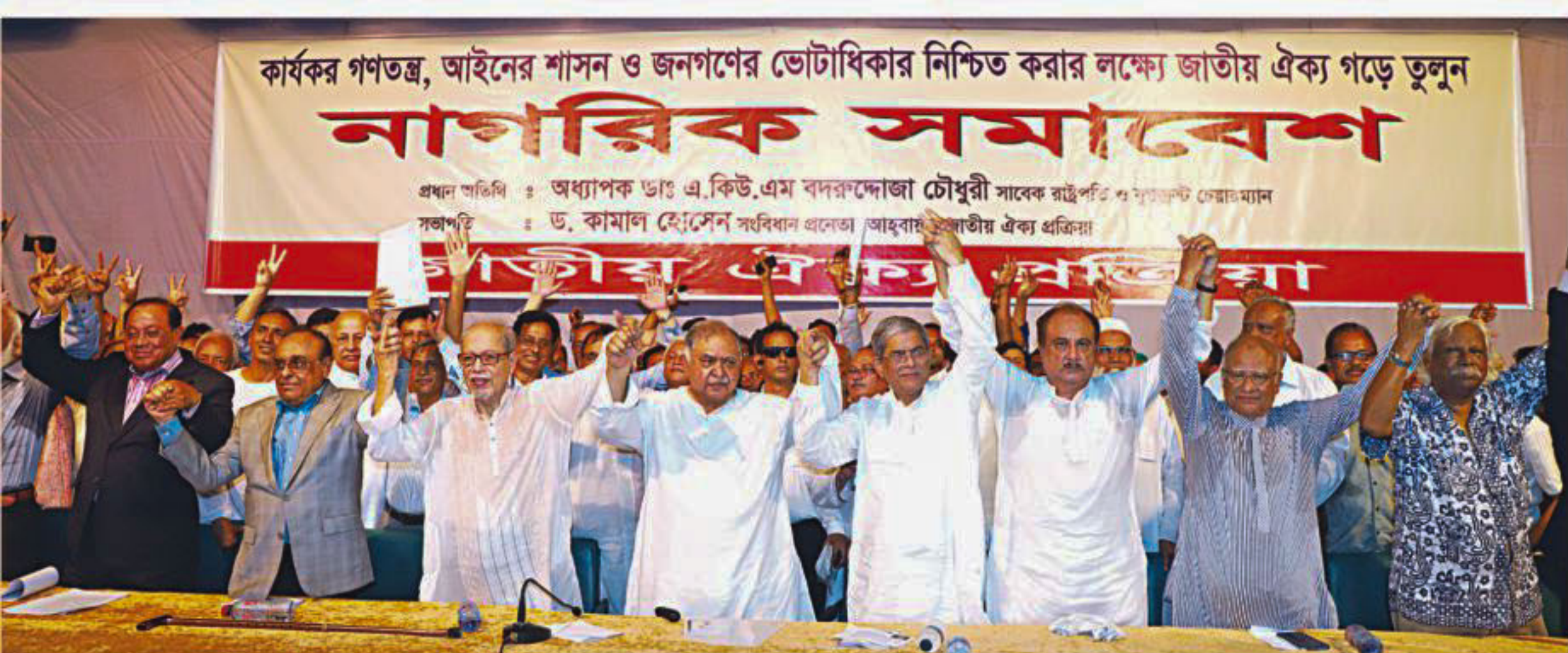
From left, BNP leader Moudud Ahmed, former adviser to a caretaker government Mainul Hosein, Bikalpa Dhara Bangladesh President AQM Badruddoza Chowdhury, Gono Forum President Dr Kamal Hossain, BNP Secretary General Mirza Fakhru Islam Alamgir, JSD President ASM Abdur Rob, BNP leader Khandakar Mosharraf Hossain, and Gonoshasthaya Kendra founder Zafrullah Chowdhury join hands at a citizens' rally organised by Jatiya Oikya Prokriya at Mahanagar Natya Mancha in the capital yesterday.