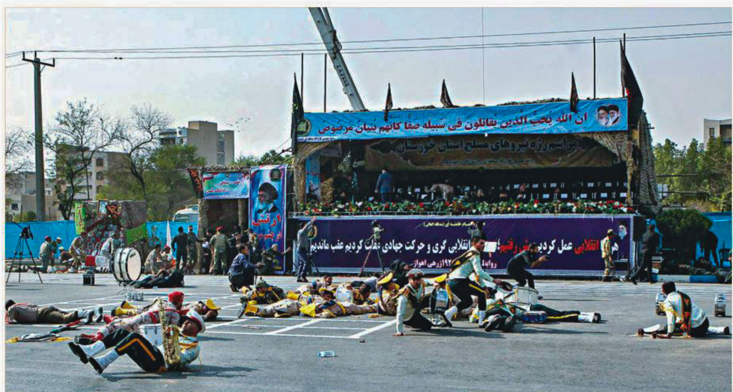
Injured soldiers lying on the ground after a gun attack on a military parade in the southwestern Iranian city of Ahvaz yesterday. The parade was for marking the anniversary of the outbreak of its devastating 1980-1988 war with Saddam Hussein's Iraq.