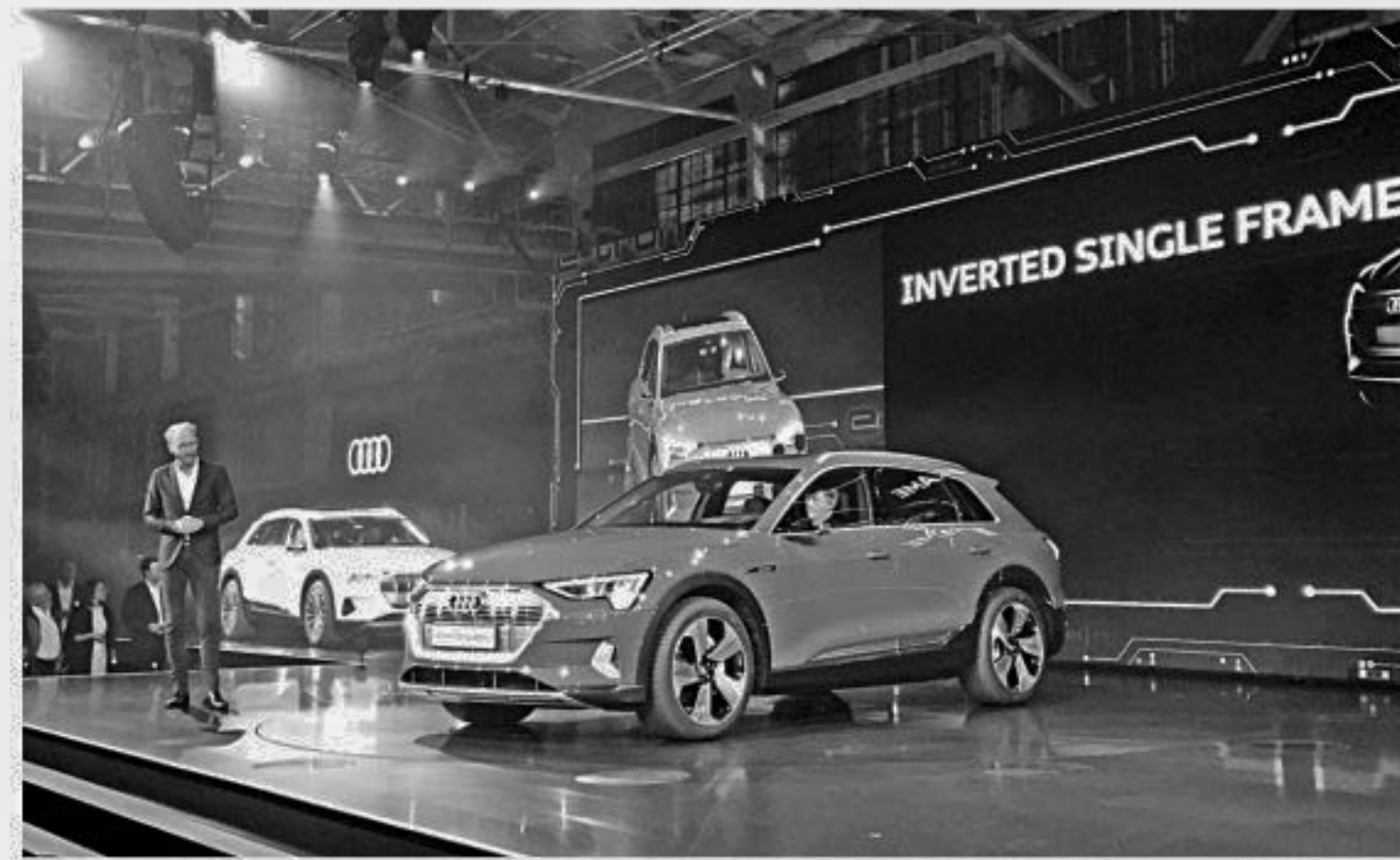
Audi unveiled an all-electric vehicle at an event in California on Monday.

Audi and parent Volkswagen are using the US launch of the e-tron SUV in mid-2019 to take aim at one obstacle to expanding electric vehicle sales - the lack of convenient ways to recharge their batteries,