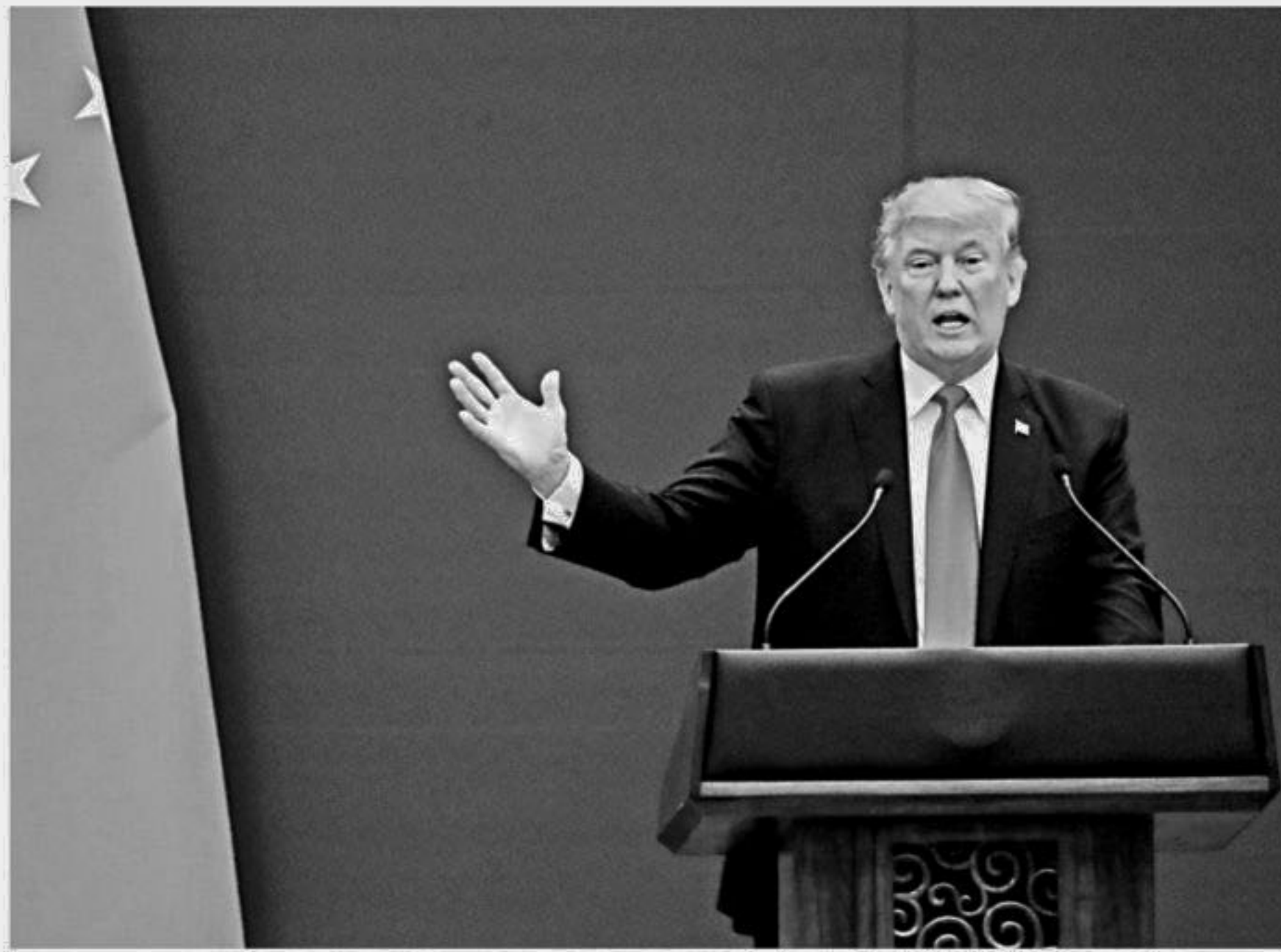
US President Donald Trump delivers his speech as he and China's President Xi Jinping meet business leaders at the Great Hall of the People in Beijing.

But Trump warned that "if China takes retaliatory action against our farmers or other industries, we will immediately pursue phase three, which is tariffs on approximately $267 billion of additional