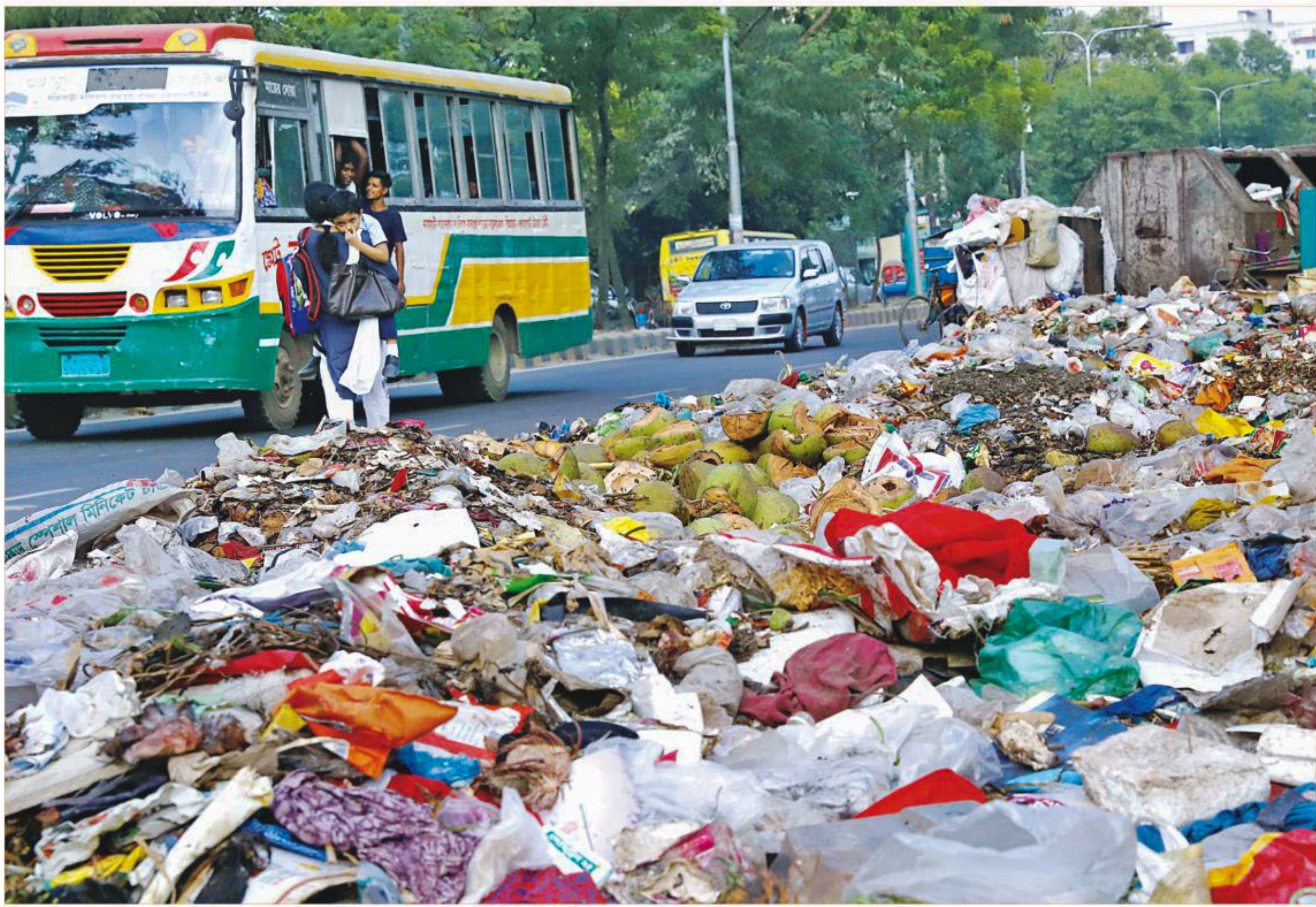
Garbage is piled up on almost half of a street in the capital's Khilgaon area, obstructing traffic movement and giving off foul smell. Though there is a large garbage container nearby, waste is dumped there out in the open. In this photo taken around 2:45pm yesterday, a schoolboy is seen crossing the area on his mother's lap covering his nose.