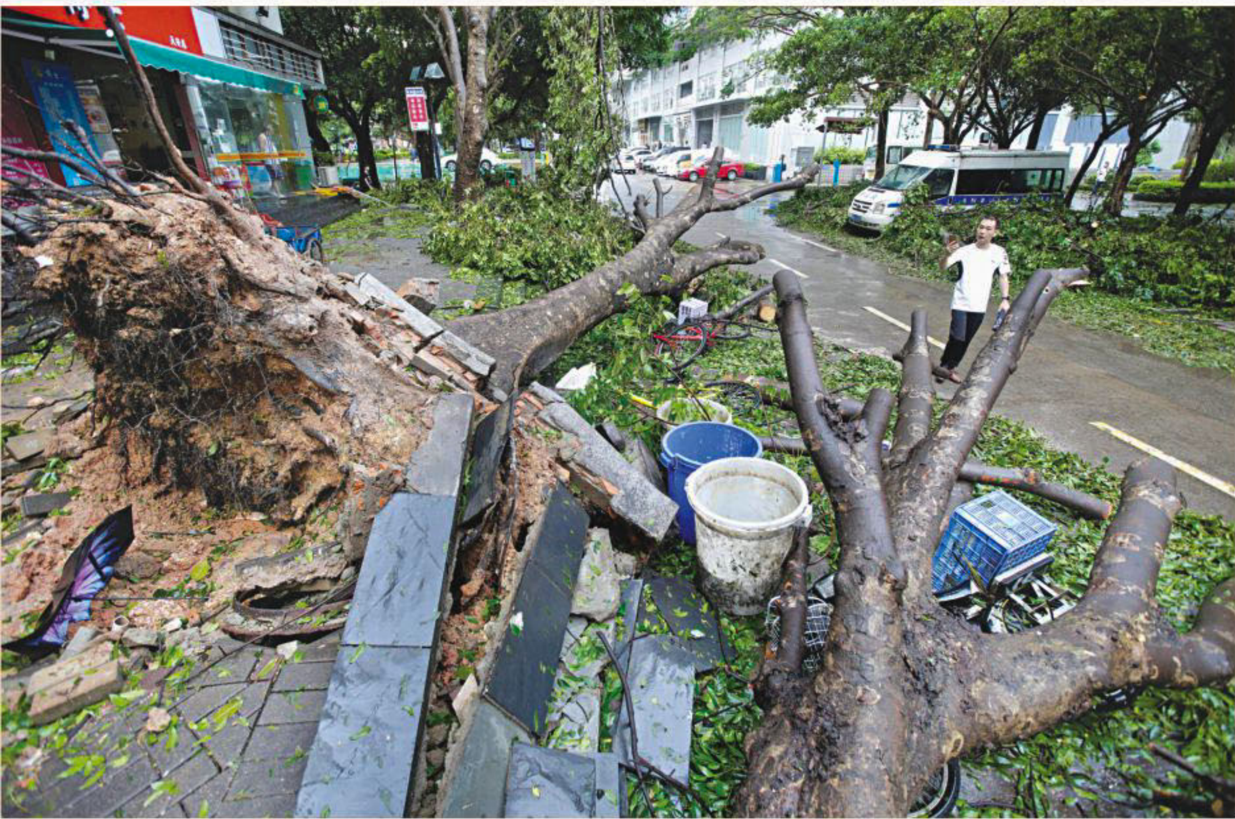
A man walks past uprooted trees on a damaged street after Typhoon Mangkhut hit Shenzhen in China's Guangdong province yesterday. Inset, a harbourside commercial building in Hong Kong. Its windows were blown out in the storm. Hong Kong began a massive clean-up after Typhoon Mangkhut raked the city, shredding trees and bringing damaging floods, in a trail of destruction that left dozens dead in the Philippines and millions evacuated in southern China.