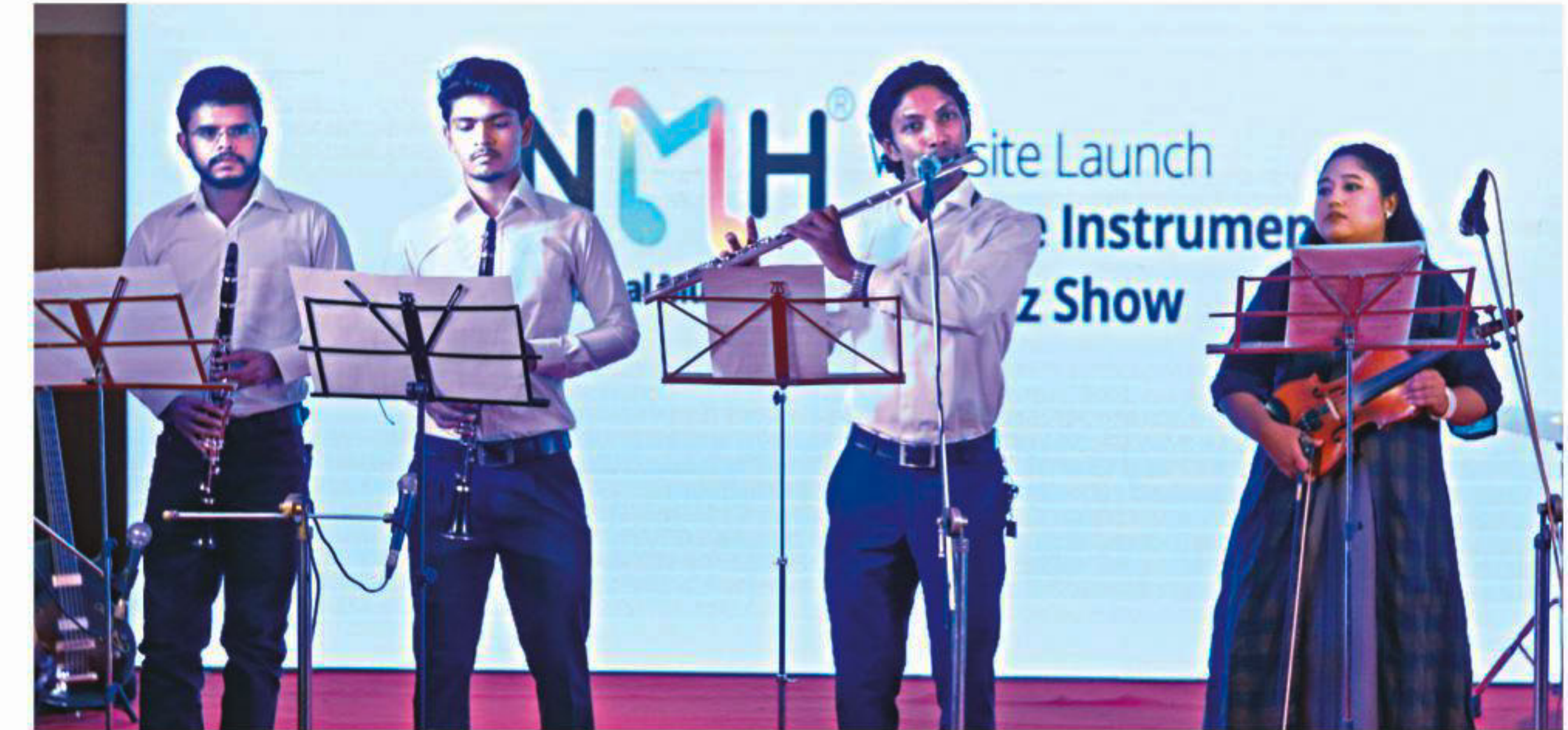
The Prime Orchestra's performance included the flute, clarinet and violin.