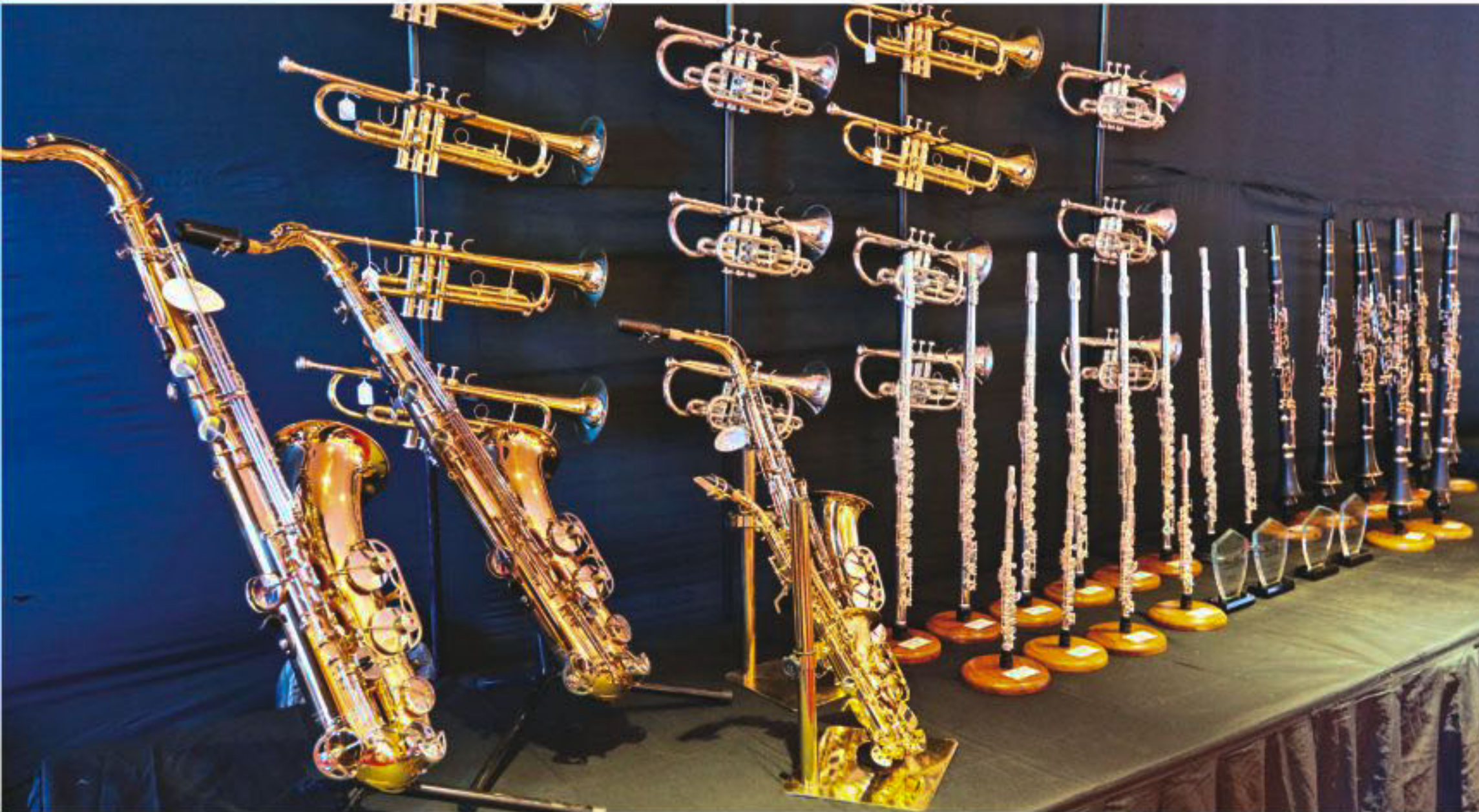
Exclusive musical instruments were on exhibit at the event.