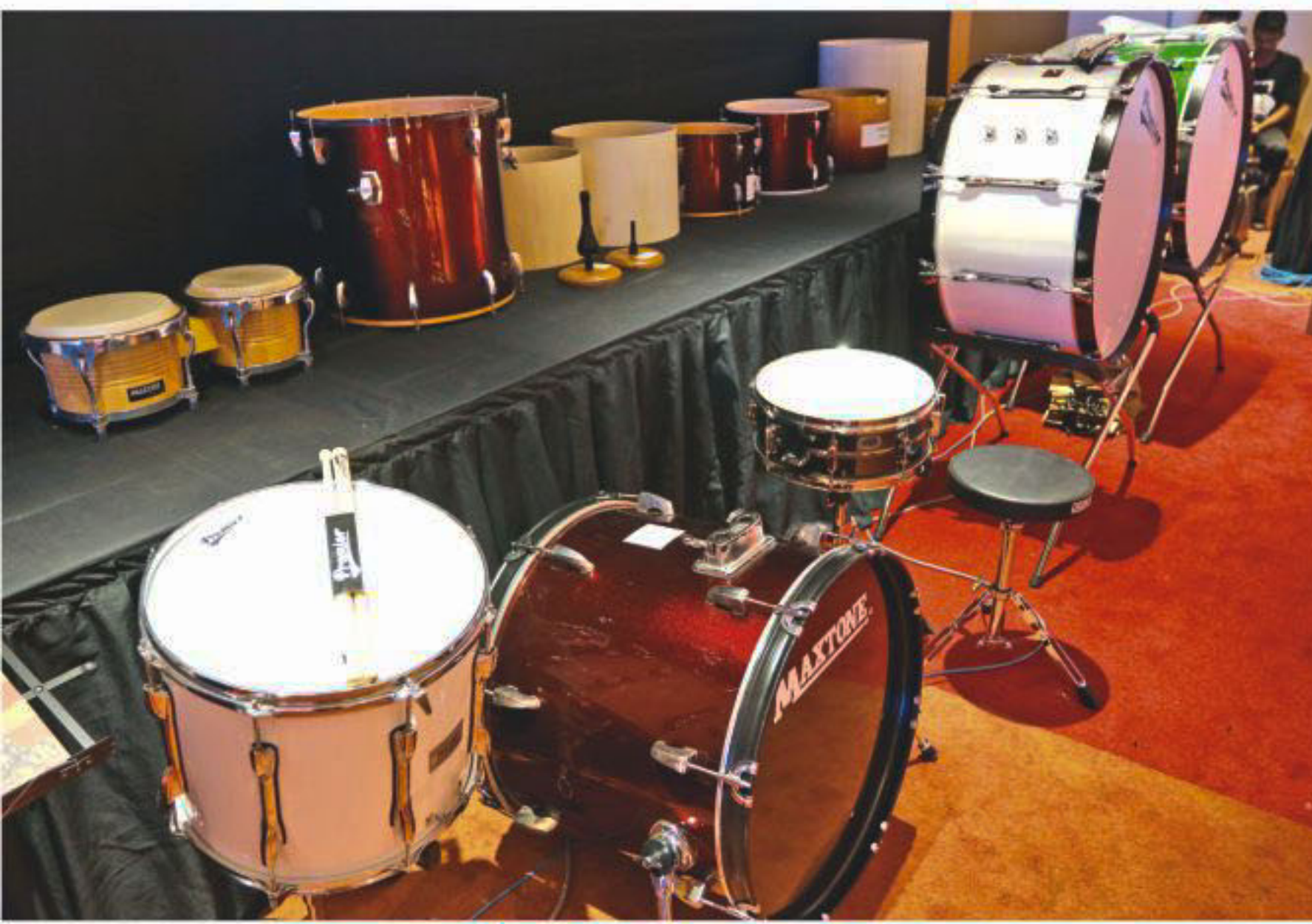
NMH offers a variety of brass, wind and percussion instruments.