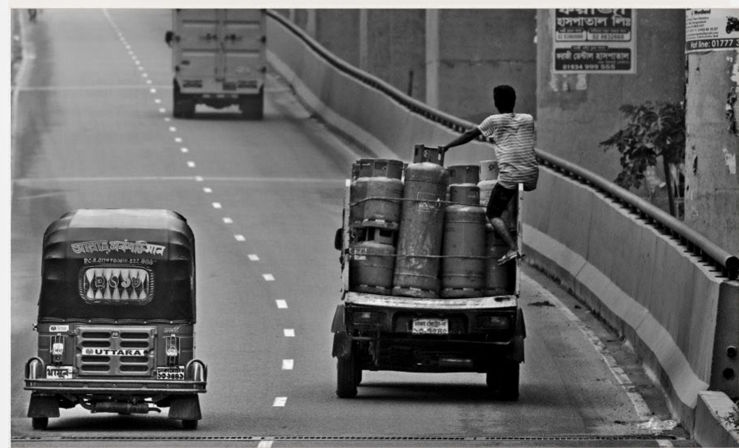
Gas cylinders loosely fastened together, a wobbly vehicle, and an uphill run on the flyover -- a recipe for an impending disaster. The photo was taken near Eskaton intersection in Dhaka yesterday.