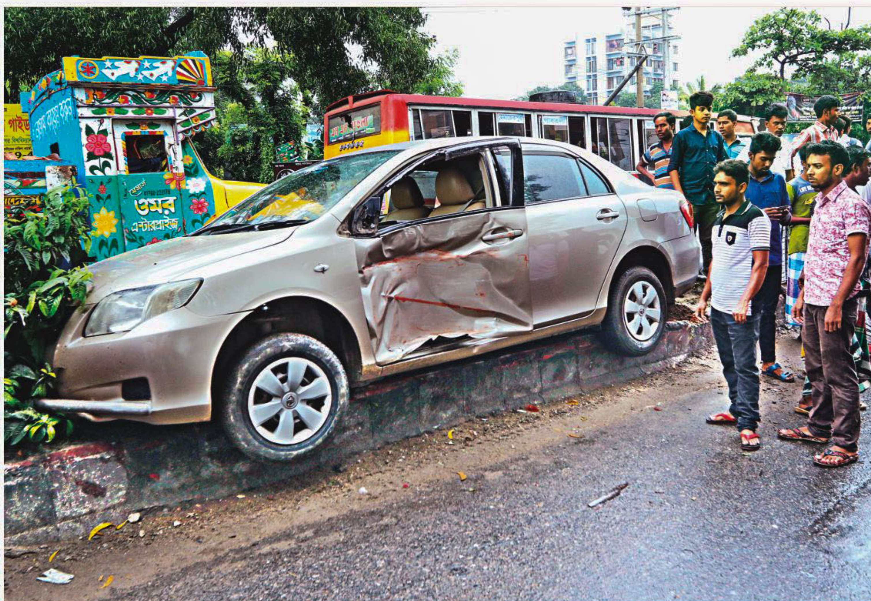
People gather near a battered car, on the central reservation of the Dhaka-Aricha highway. The vehicle was side-swiped by an Itihas Paribahan bus, while the bus was overtaking it at around 10:00am yesterday. The accident comes amid growing demands for ensuring road safety.