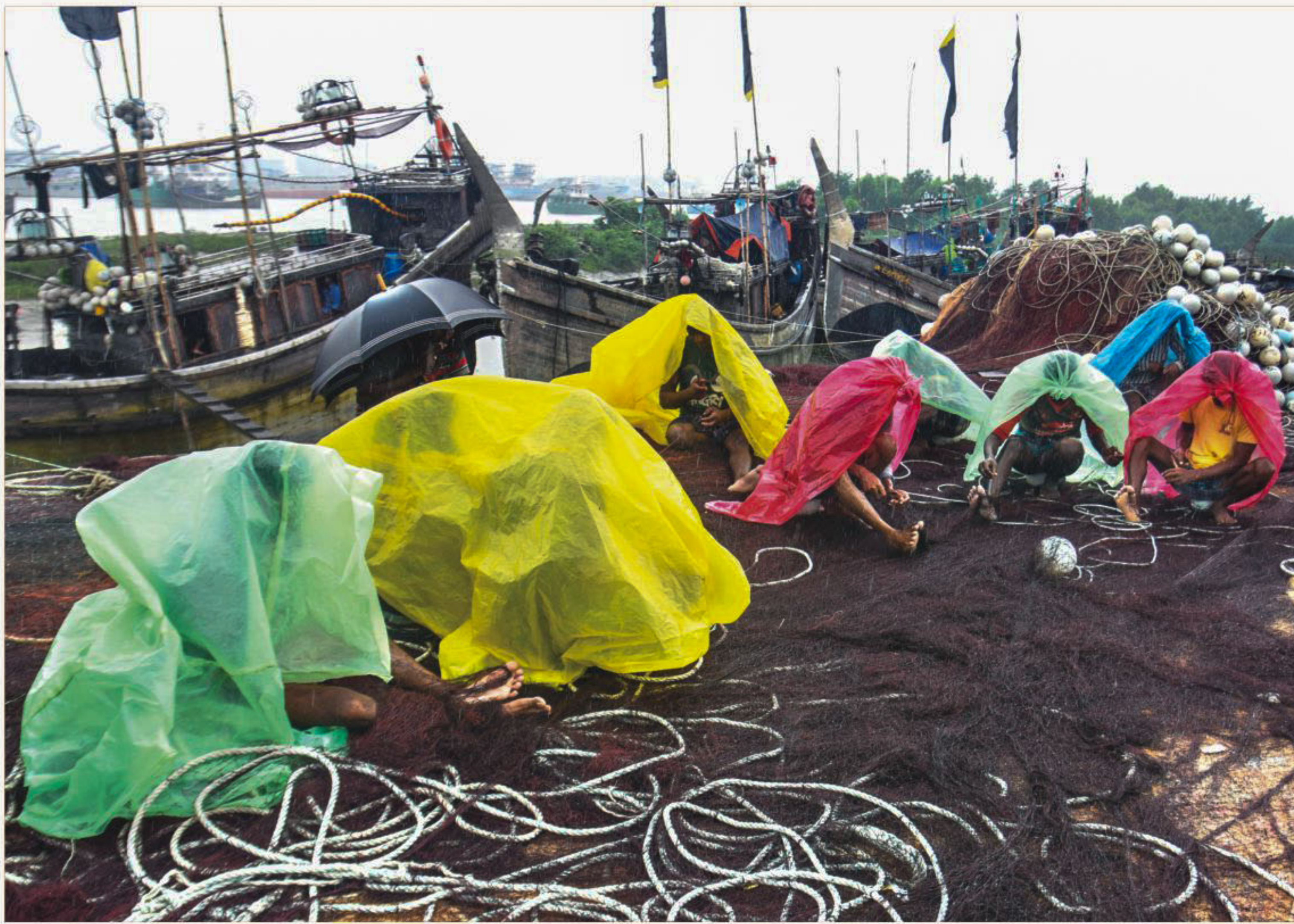
Unable to go to the sea to catch hilsa during the peak season due to inclement weather, fishermen cover themselves with plastic sheets in the rain and mend their nets to utilise their time at shore. The photo was taken at Fishery Ghat in Chittagong city yesterday.