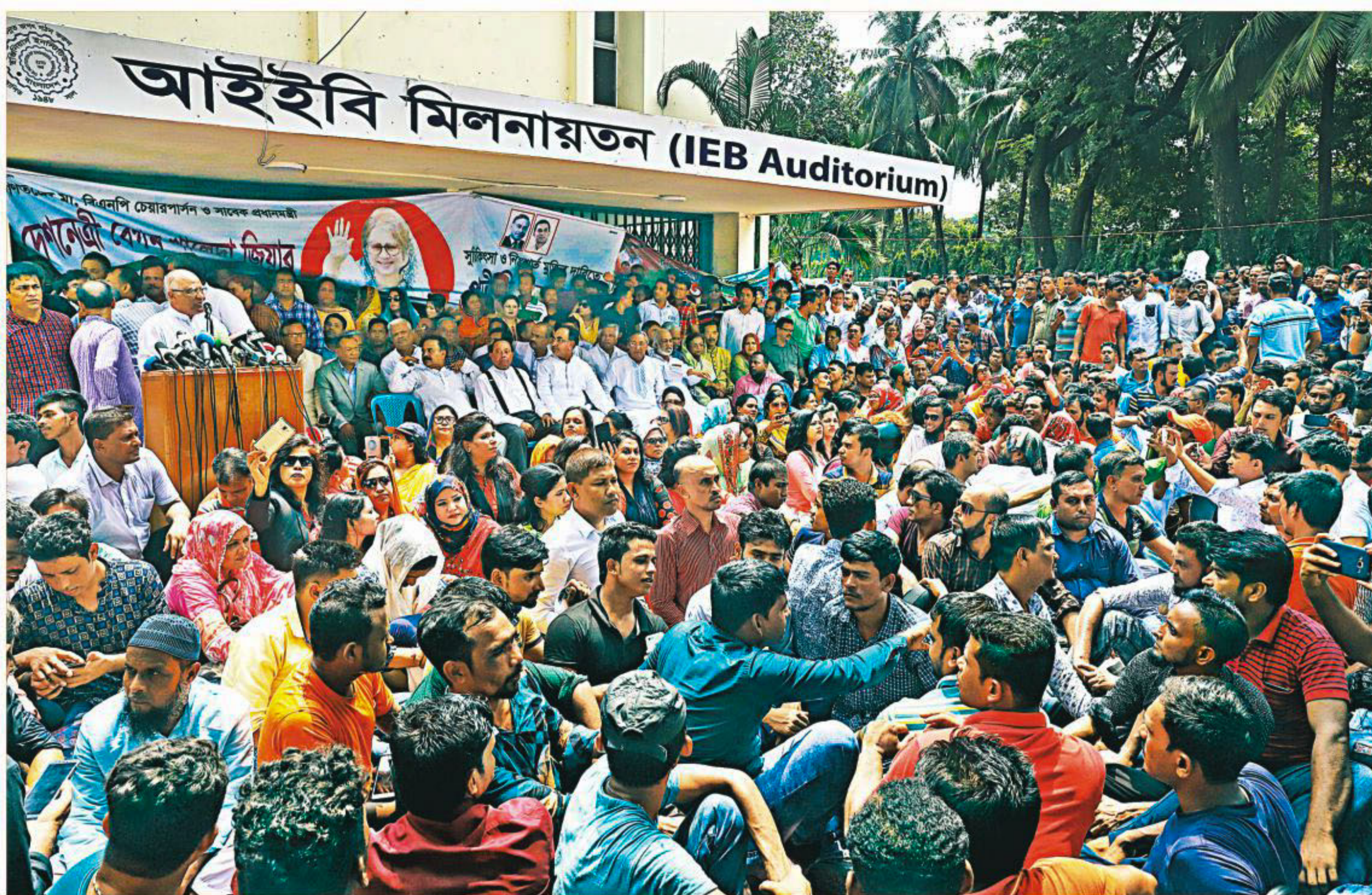
BNP standing committee member Khandker Mosharraf Hossain addresses a party rally in front of the IEB (Institution of Engineers, Bangladesh) Auditorium in Dhaka yesterday.