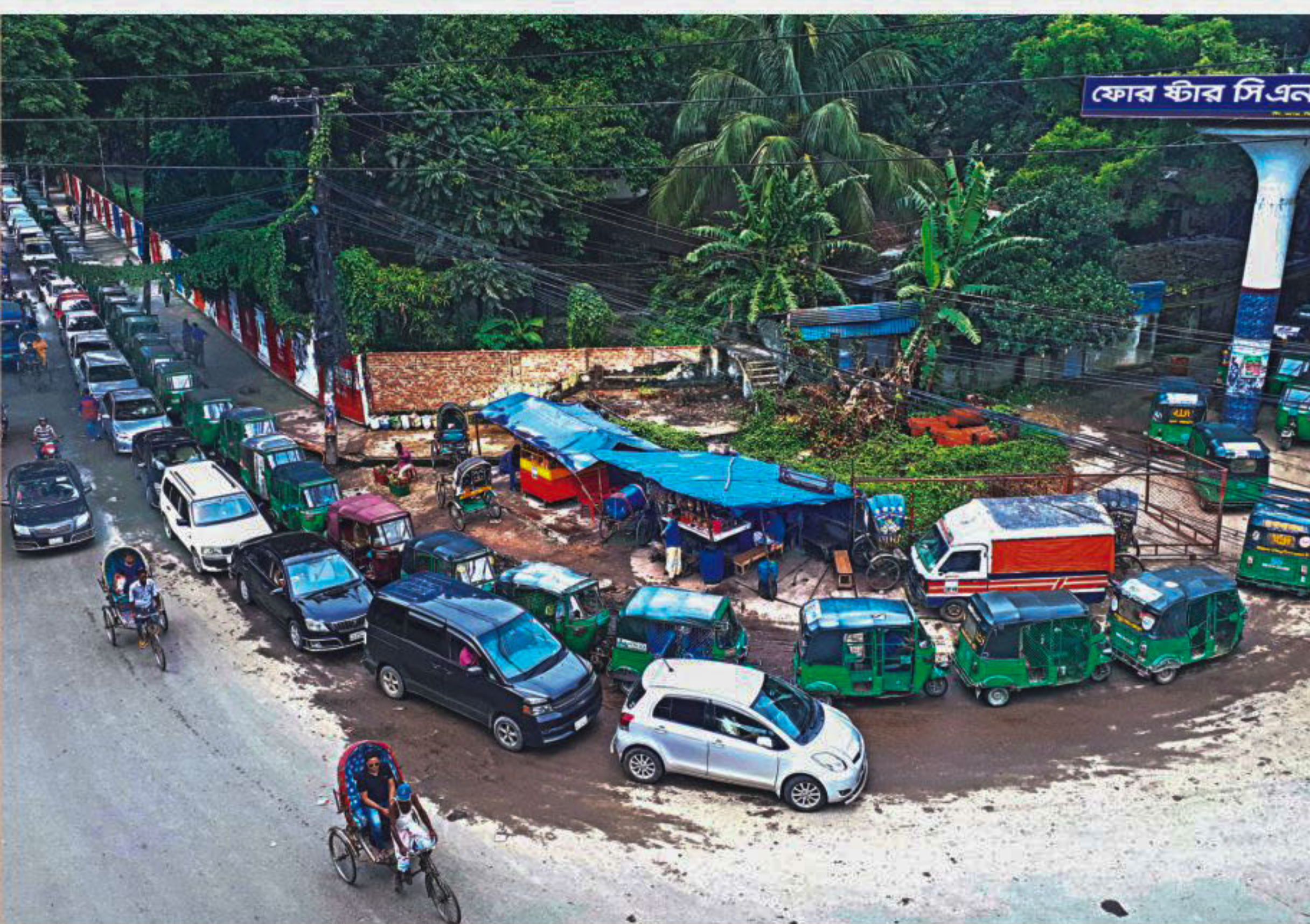
Vehicles queue up at a CNG refuelling station in Chittagong city's Kadamtali area around 11:00am yesterday following a disruption to supply of gas for around three hours. Officials said the disruption occurred due to a glitch in the supply line in Anwara upazila.