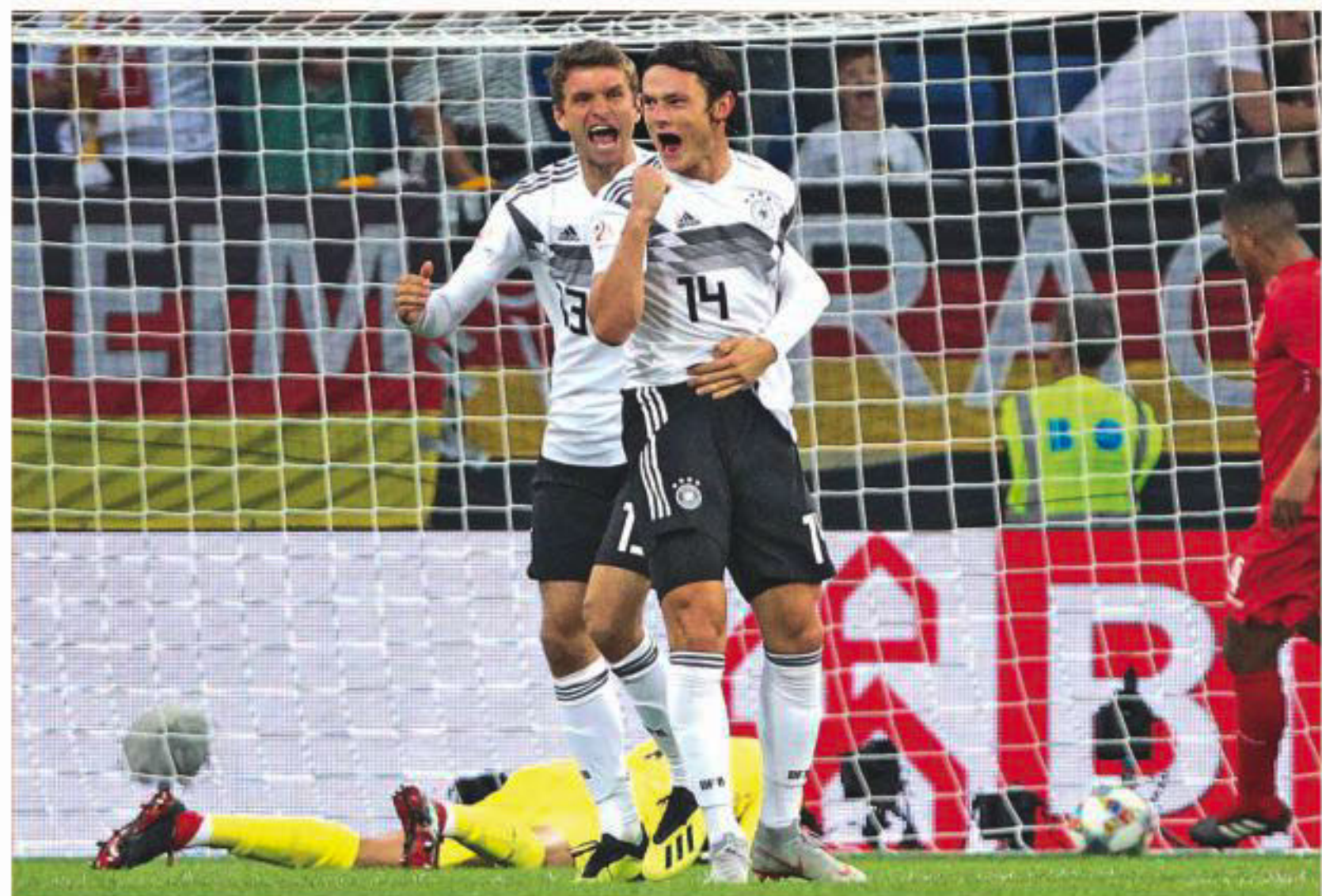
Germany defender Nico Schulz (R) is ecstatic after his winning goal against Peru in their international friendly in Sinsheim on Sunday.

The lead lasted all of three minutes, as Julian Brandt levelled the scores with a delicate chip over Gallese.