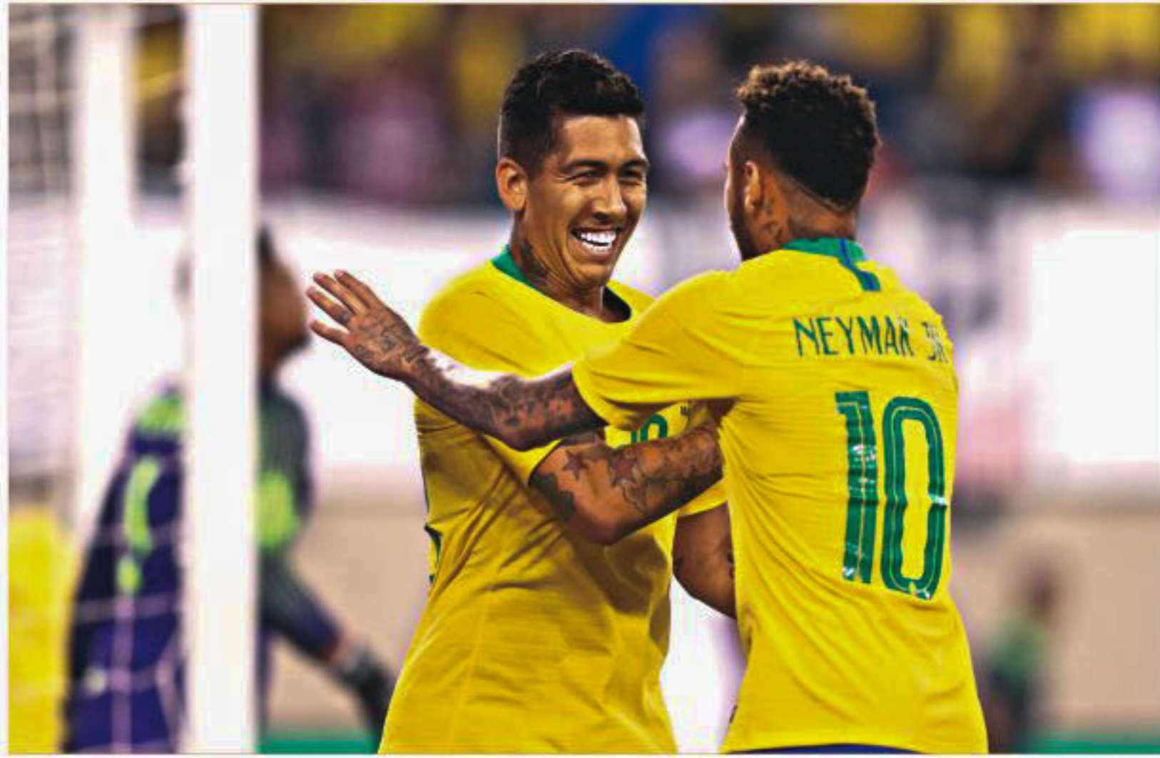
Brazil's goalscorers Neymar and Roberto Firmino celebrate the latter's opening goal against the United States of America in a 2-0 friendly win in New Jersey yesterday.

There was never much doubt that Brazil would extend their winning record