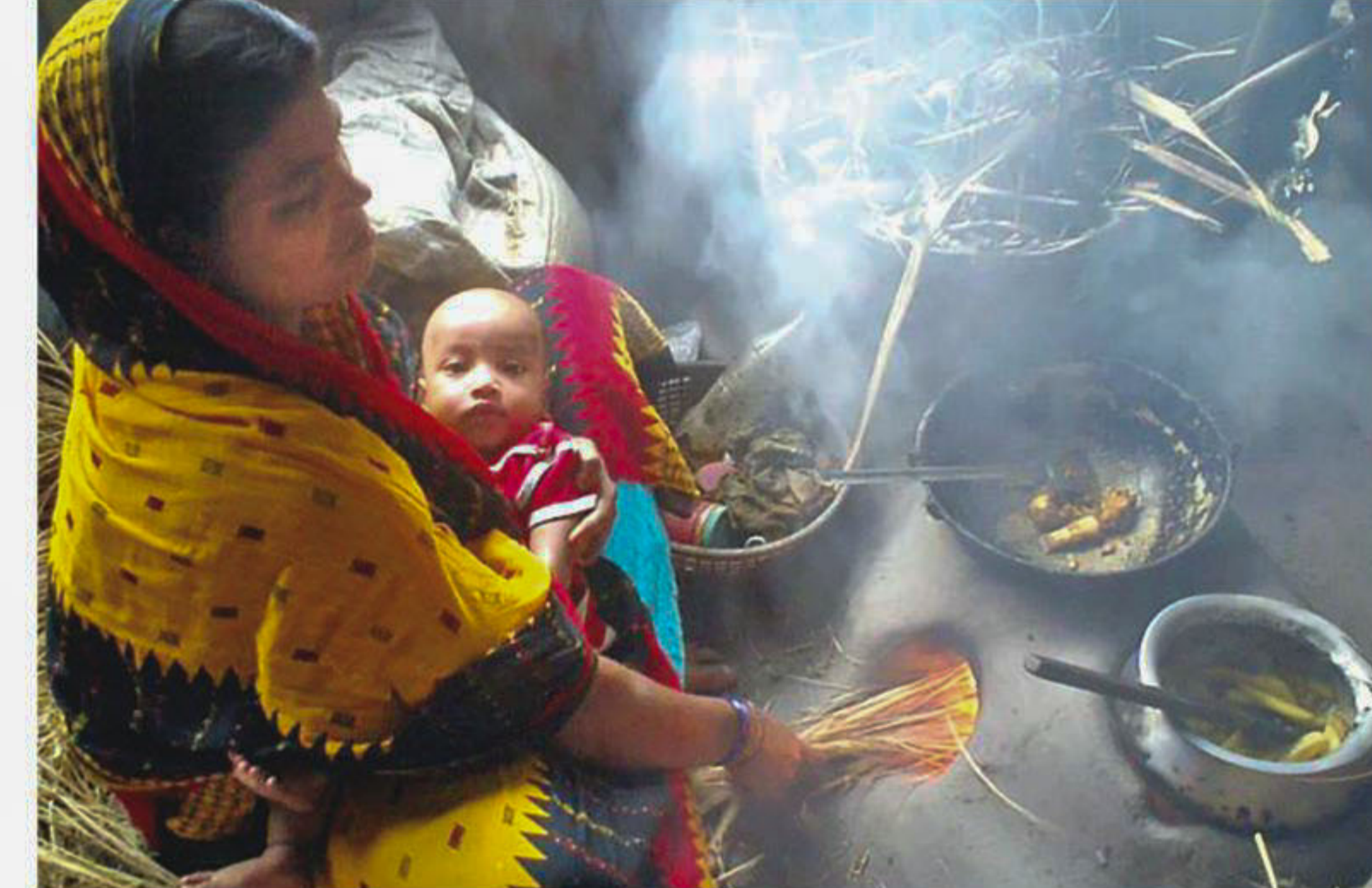
The work that women do at home has immense value since it creates social capital.