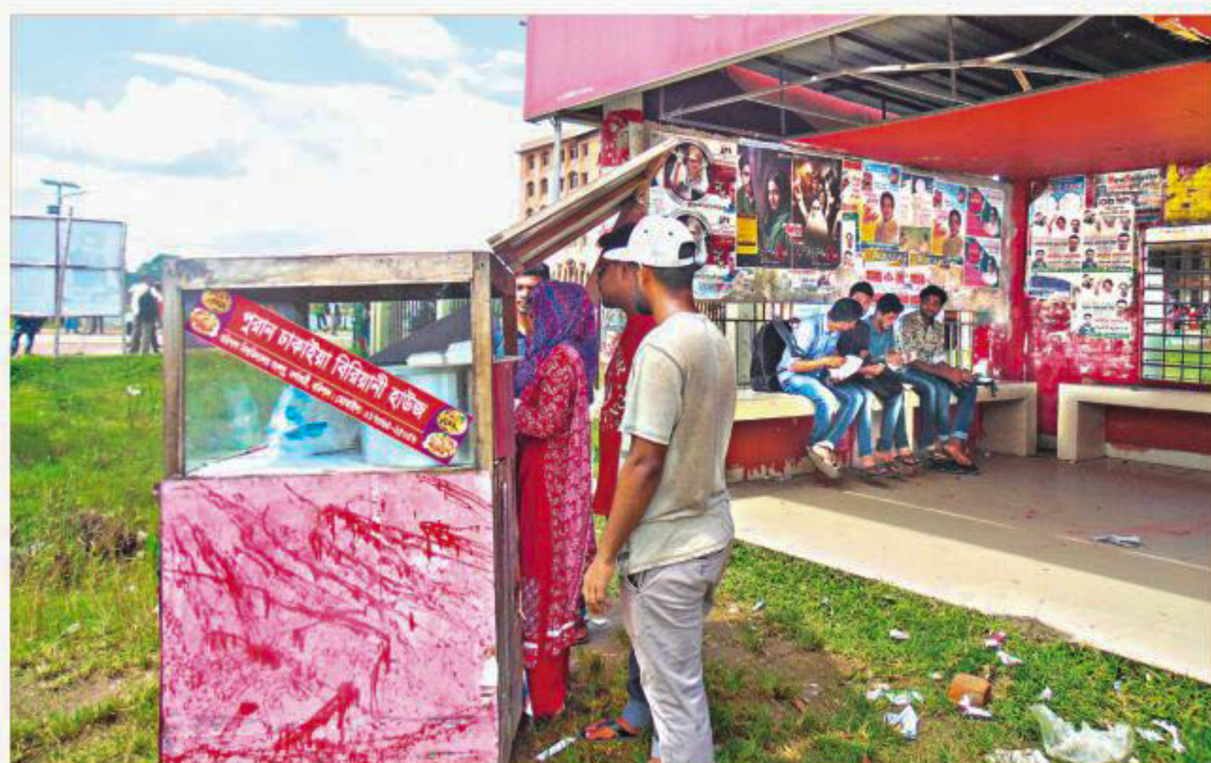
The food cart near the main gate of Barisal University.

Barisal University students run food cart for peers, set positive example